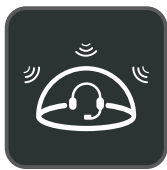
Acoustic Shield Technology