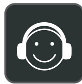
All Day Wearing Comfort