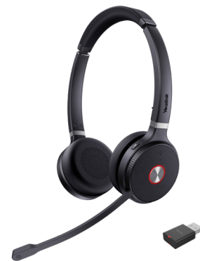
WH62 Dual Portable Teams WH62 Dual Portable UC

Based on hundreds of head form evaluations and thousands of wearing comfort tests, WH62 Portable well meets the ergonomic requirements. Besides, with premier soft leather cushions and lightweight design, you can wear it all day comfortably. For more workspace freedom, WH62 Portable can also free you up to 120 m away from the desk.