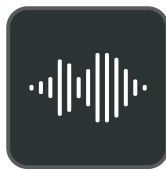
Optimal Audio Experience