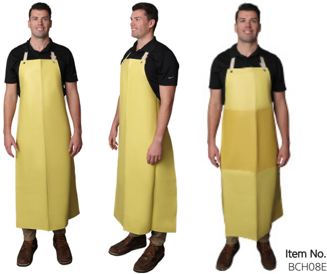
Item No. BCH08E