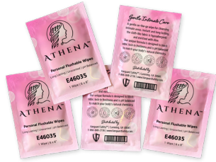
Item No. E46035