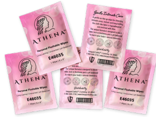
Item No. E46035