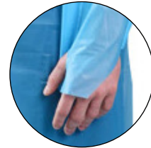
Die Cut Thumbholes