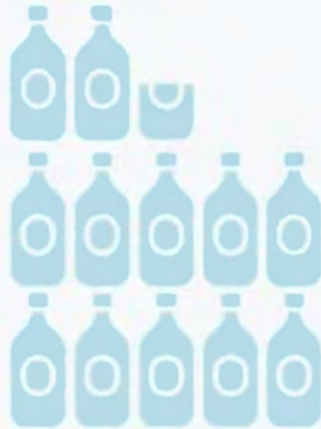
12 and half 400ml small bottles weighing 60gr each = 750gr