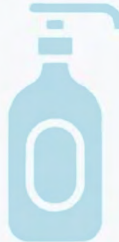
one 5lt refi lbottle weighs 180gr