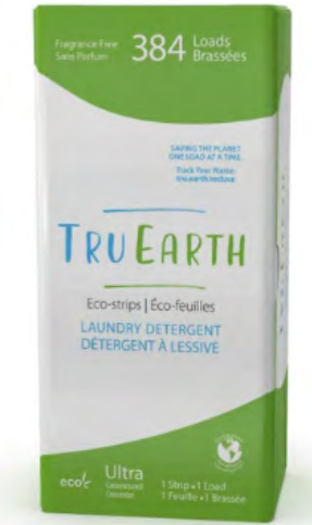
Laundry Strips Fragrance Free