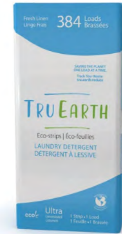
Laundry Strips Fresh Linen