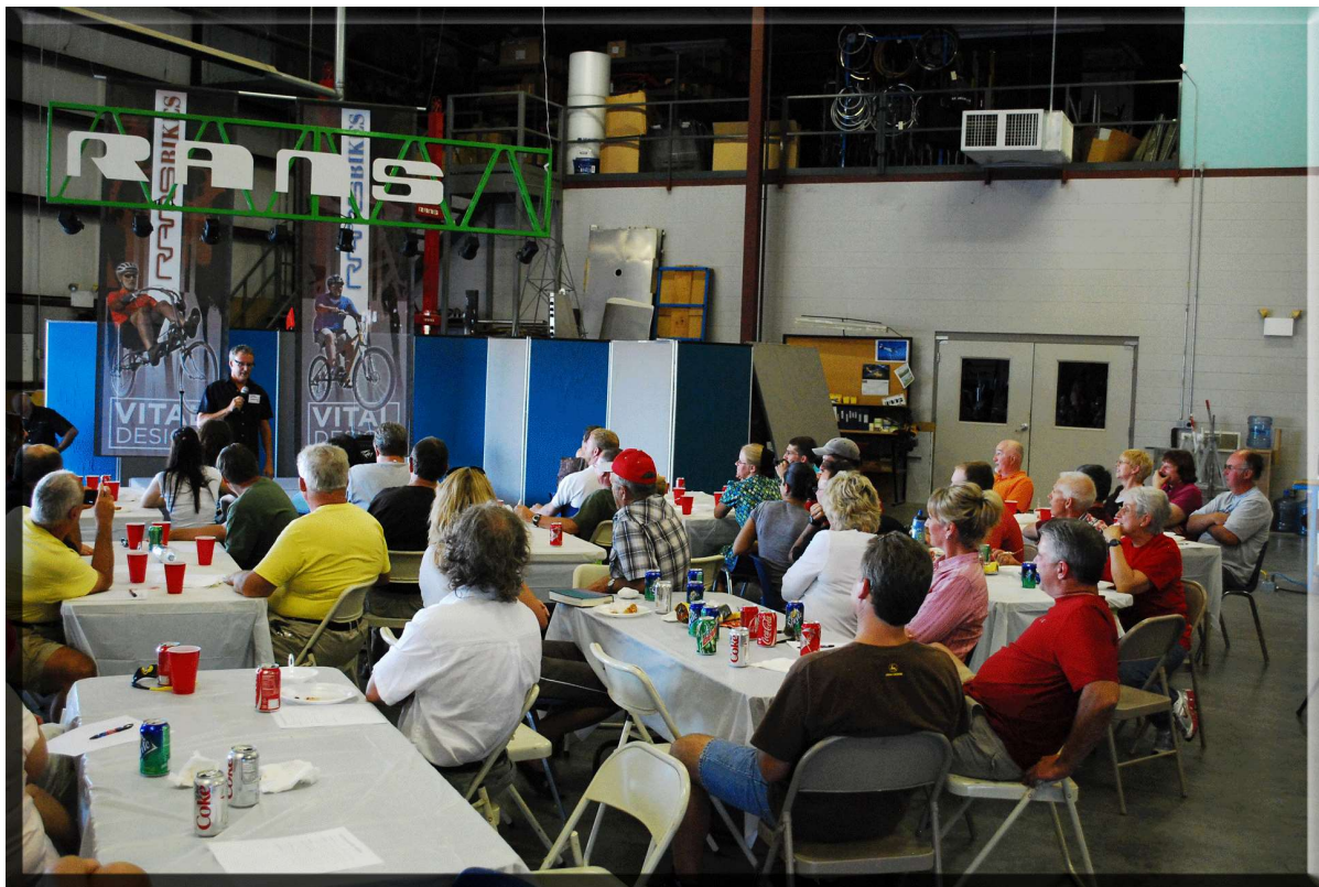
2010 RANS RALLY PHOTOS