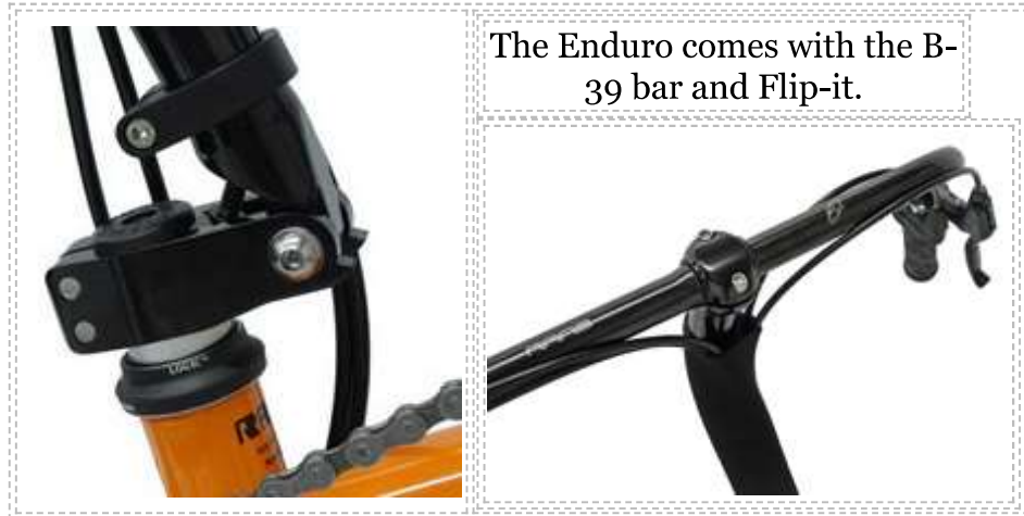
The Enduro comes with the B-39 bar and Flip-it.