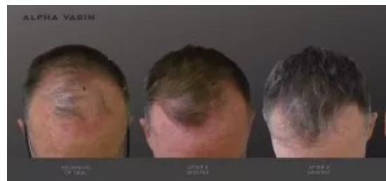
Works on straight hair too