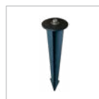
Ground spike support kit LKITA0000000022