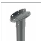
Pole connection B LKITA00000040109