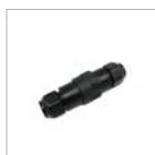
Fast connector IP 3 poles LKITA0000000003