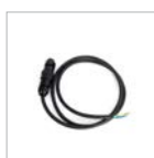
Cable with connector Ca. 2m/Co. IP 2 poli LKITA00000000040 Ca. 2m/Co. IP 3 poli LKITA00000000041