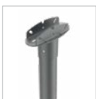
Pole connection B LKITA000000401 09