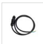
Cable with connector Ca. 2m/Co. IP 2 poli LKITA00000000040 Ca. 2m/Co. IP 3 poli LKITA00000000041