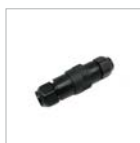
Fast connector IP 3 poles LKITA00000000003