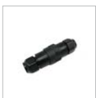
Fast connector IP 3 poles LKITA00000000003