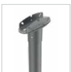
Pole connection B LKITA000000401 09