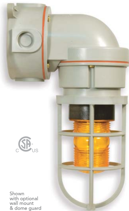
Shown with optional wall mount & dome guard