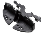
Aluminium Rail Holder