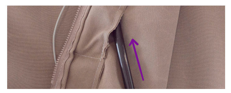
The bottom of the rod will fit into the base of the channel, concealing it.