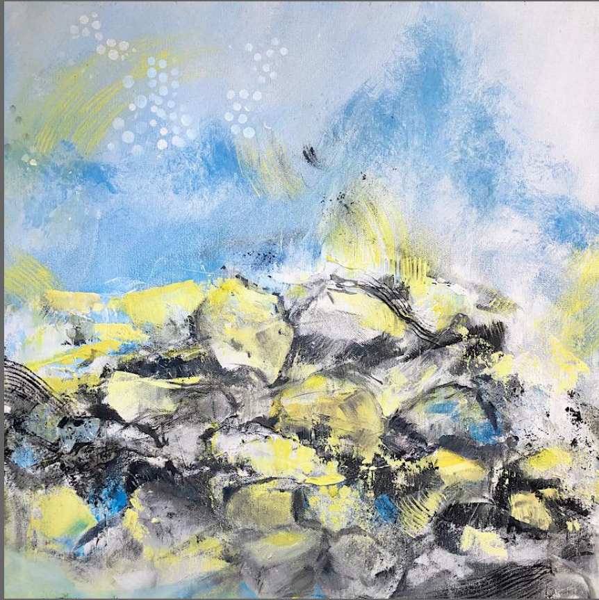
Joy - 20x20x1.5" Acrylic on Canvas