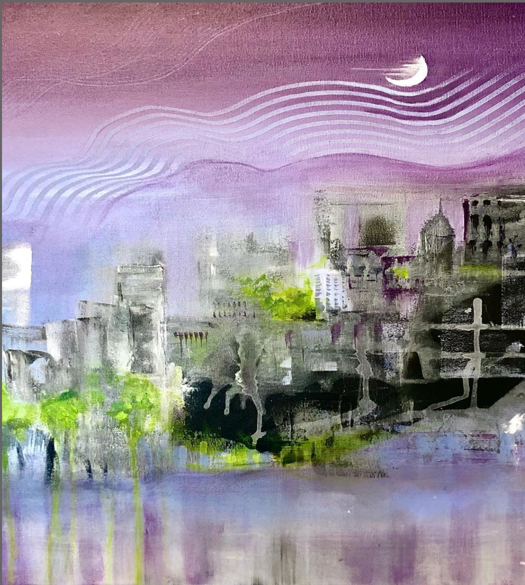
My City - 24x24x1.5" Acrylic on Canvas

Facebook: https://www.facebook.com/MahassaArts/