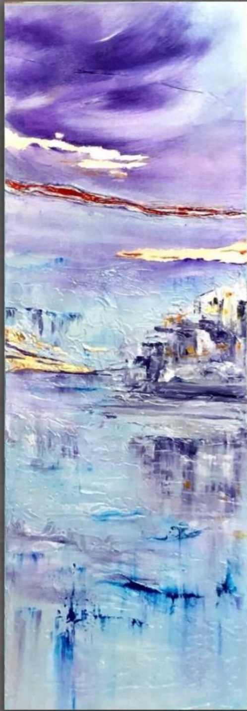
Venice 12x36x1.5" Acrylic on Canvas