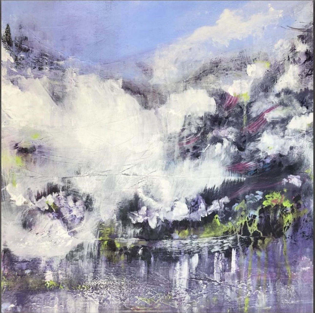
Elusive – 20x20x1.5” Acrylic on Canvas