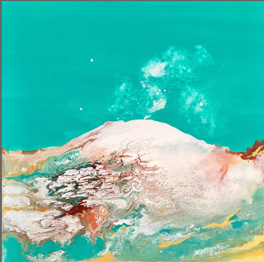
The Volcano - 20x20x0.75" Acrylic on Canvas