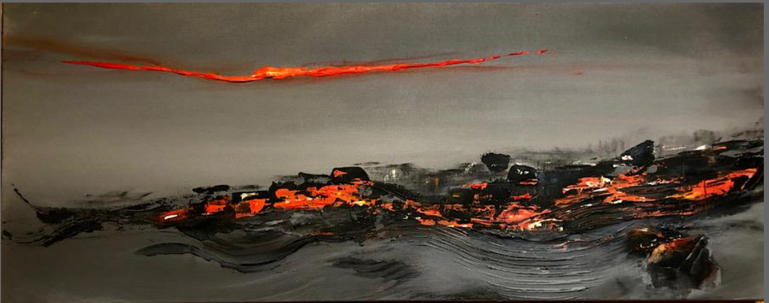
“Molten Sunset” - 40x16x1.5” Acrylic on Canvas

It happens quite often that when I see those intriguing scenes through my abstract lens while walking around, I hear myself gasping. My hope is to give the same joy and excitement to my audience, touch their hearts and stimulate their senses.