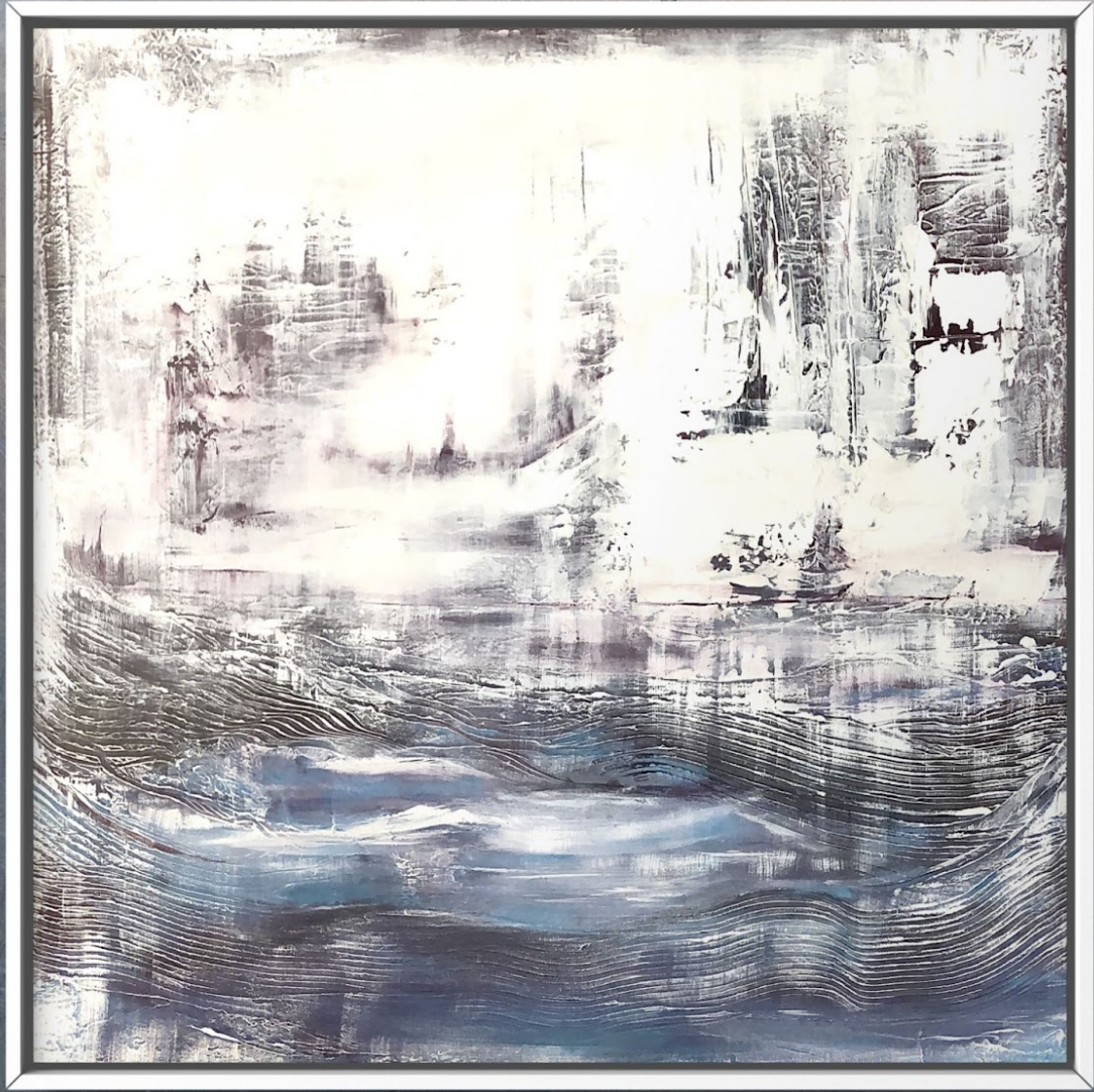
Silence Within 36x36x1.5" Acrylic on Canvas