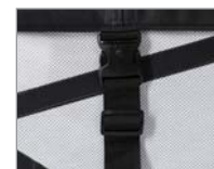
Top lid connected to ground mat by buckle for safety