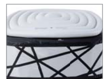
Inflatable bladder for better heat preservation and rain outflow