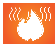
Quick heating technology