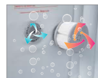
All around bubbling design & Smart filtration