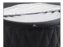
Inflatable bladder for better heat preservation and rain outflow