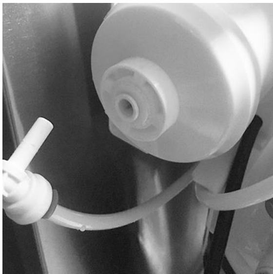
FIG 1. Plugs Removed