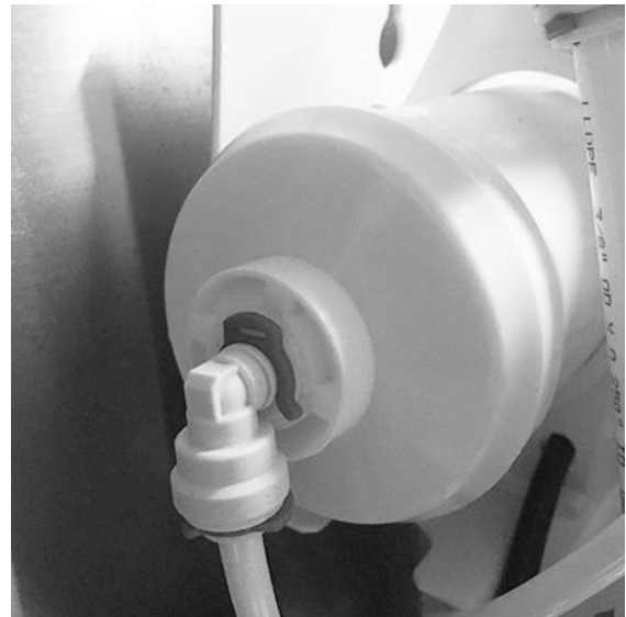
FIG 2. Fitting & Clip Installed