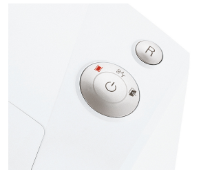
The full bin is indicated via the display and the machine switches off automatically.

The induction-hardened, solid steel cutting rollers guarantee durability.