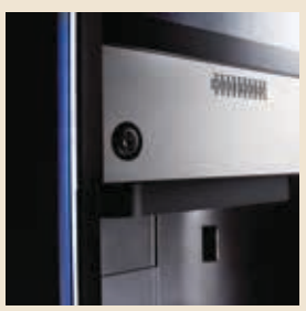
LED lights frame the cup area which enhance the overall look and feel of the machine.