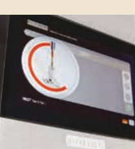
The user-friendly interface lets you prepare a drink just the way you like it, allowing you to make changes to the strength and amount of ingredients for a fully personalised drink experience.