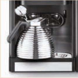
The spacious delivery area with adjustable cup holders allows you to fill coffee pots or thermo jugs.