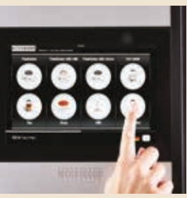
The 10" touch screen - offers a visual guide, making choices easier. The design and layout of the screen can also be fully customized to suit any environment.