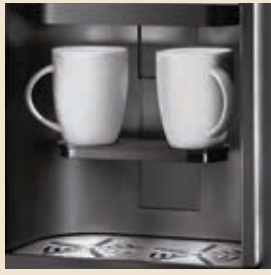
Separate delivery points: Coffee, chocolate, and mixed drinks on the left, and hot water on the right.