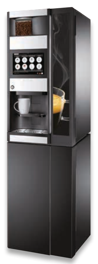
The elegant base stand enhances the design of the machine.