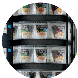
Flexible snack, food and drinks offer