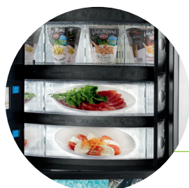
Variable temperature options