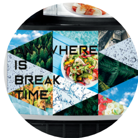
A simple design for a true automatic canteen