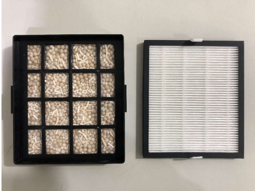
NCCO Reactor (NA213020300) and Normal White HEPA