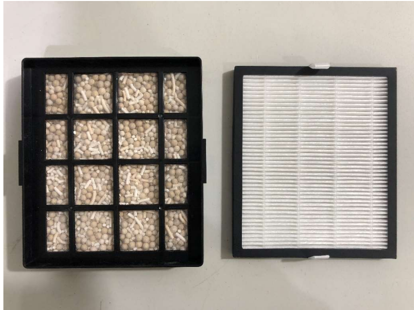
NCCO Reactor (NA213020300) and Normal White HEPA