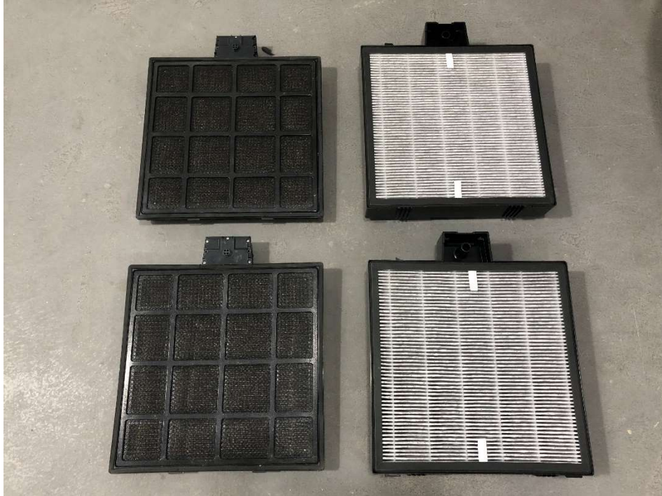
NCCO Reactor (NA213020300) and Activated Carbon HEPA