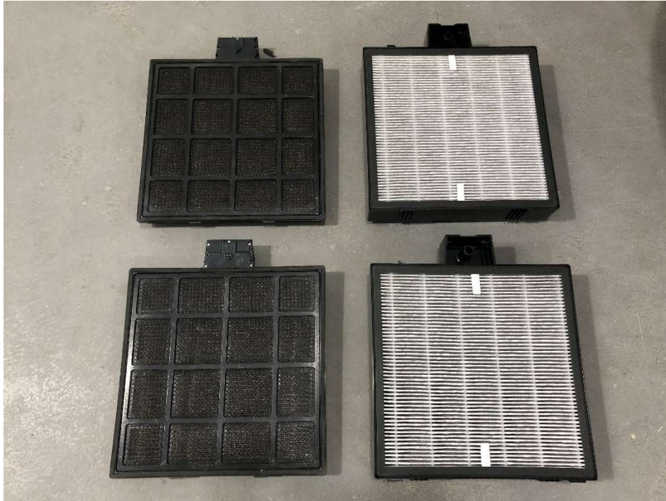
NCCO Reactor (NA213020300) and Activated Carbon HEPA