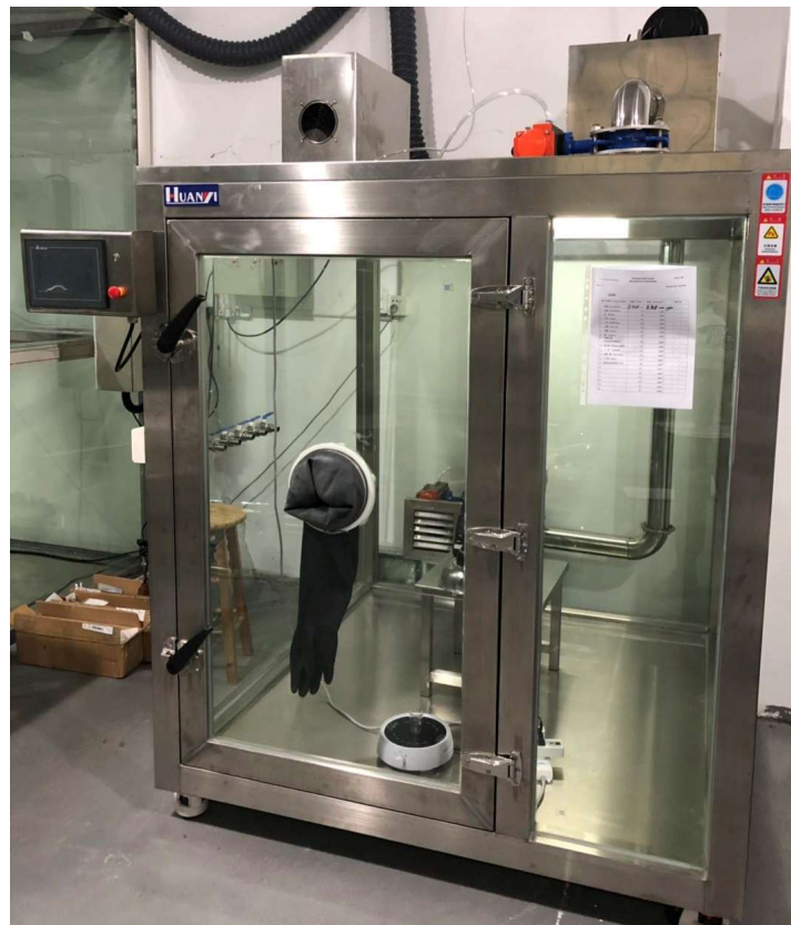
3m 3 Testing Chamber