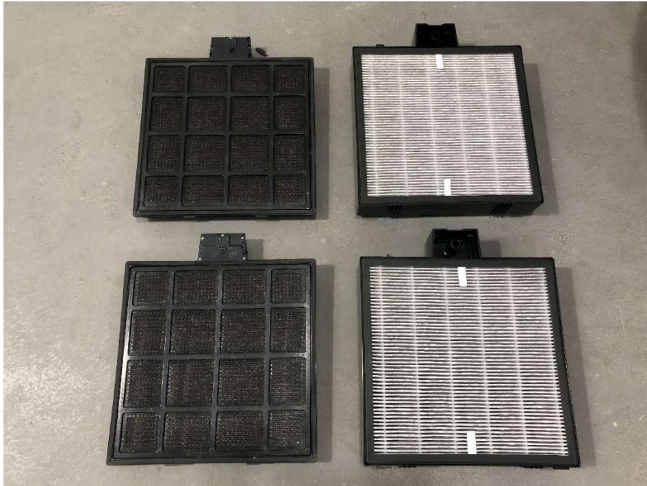
NCCO Reactor (NA213020300) and Activated Carbon HEPA