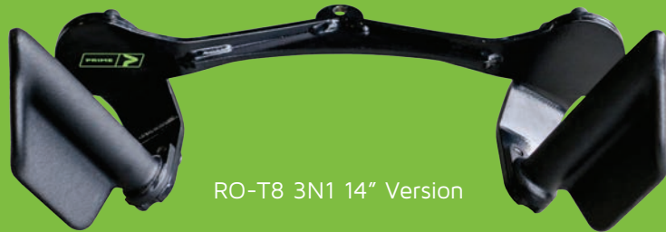
RO-T8 3N1 14" Version