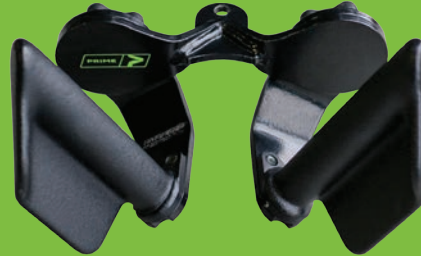
RO-T8 3N1 6" Version

The RO-T8 3N1 Handles feature the same ergonomic paddle grip you love on the original RO-T8 Handles (maximizing output potential), but these have been taken to a whole new level of versatility. The RO-T8 3N1 Handles offer a 3-grip position feature that can be adjusted from a neutral grip to a semi-pronated or semi-supinated position in just seconds.