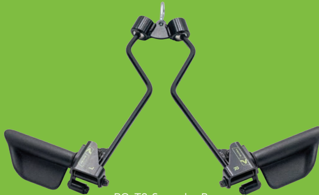
RO-T8 Spreader Bar