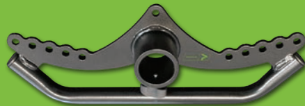
RO-T8 Landmine Bar