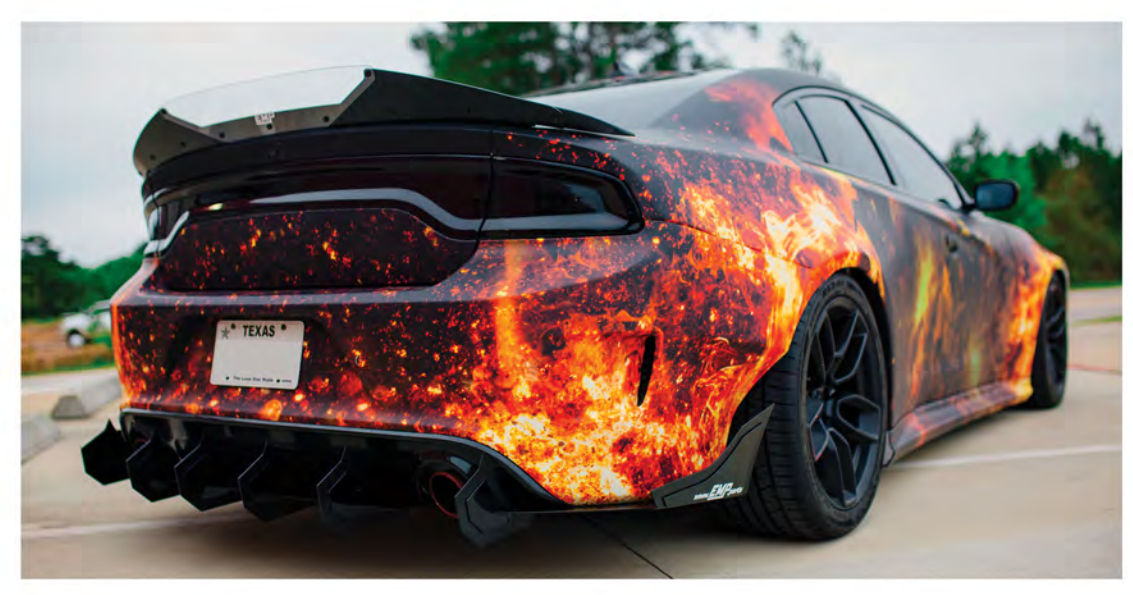
DONE! Check out our other premium parts and continue raising the bar.

Perform installation at your own risk. We are not responsible for damage to parts or vehicles or injury to persons during installation and/or use of this Wicker Bill and/or Gurney Flap. Automatic car wash not recommended. Always hand wash car after wicker bill is installed. Periodically check all screws to ensure they remain tight and wicker bill is solidly attached. Only tighten screws again if loose. Do not over tighten screws into rivet nuts. Do not drive car with loose wicker bill screws. EMP is not responsible for products beyond initial quality and condition due to conditions, installation quality and other factors beyond our control.