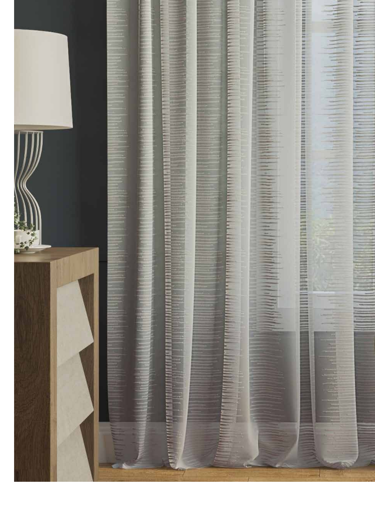
Above — Waterloo Top left — Hastings Bottom left — Acton