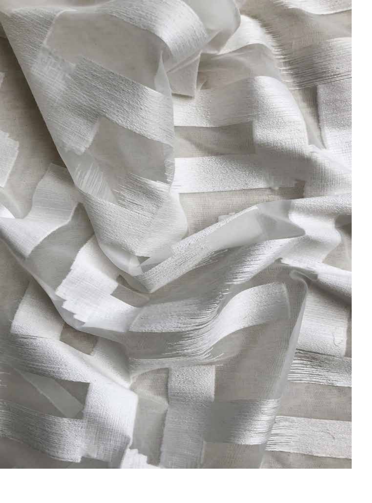
Above — Oakley, Top right — Ducale Voile, Bottom righ — Eclipse Voile