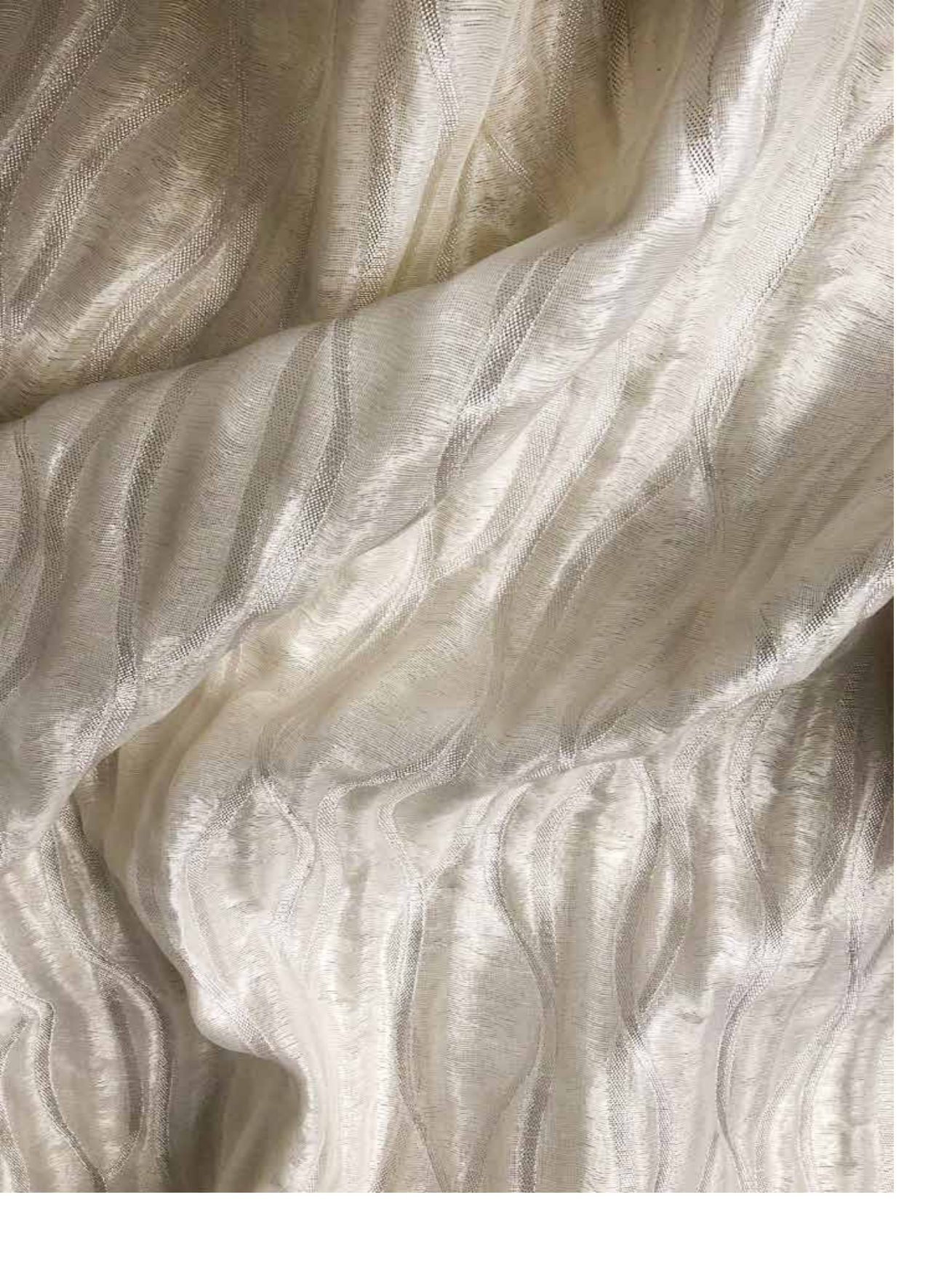
Above — Hampton Top right — Forest Hill Bottom right — Laguna