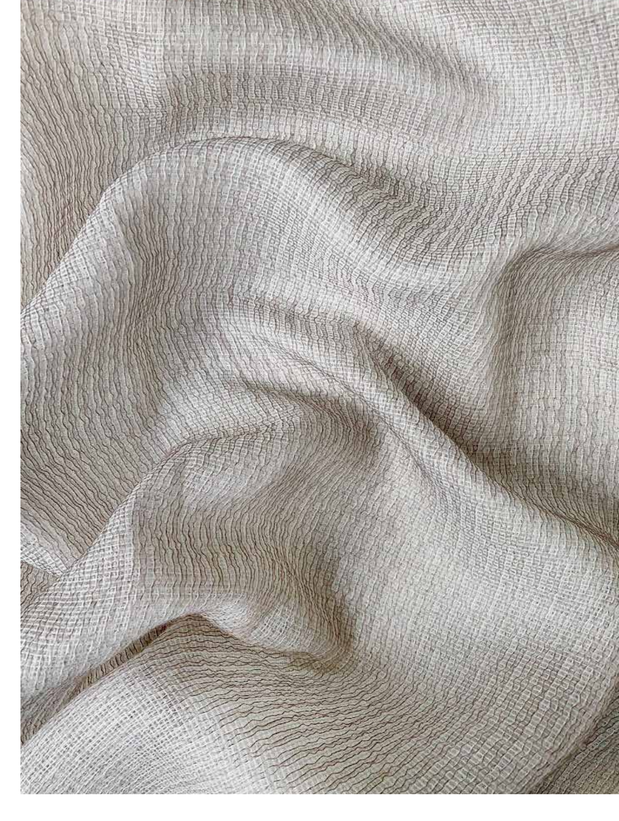
Above — Riverdale Top left — Woodland Bottom left — Scarsdale