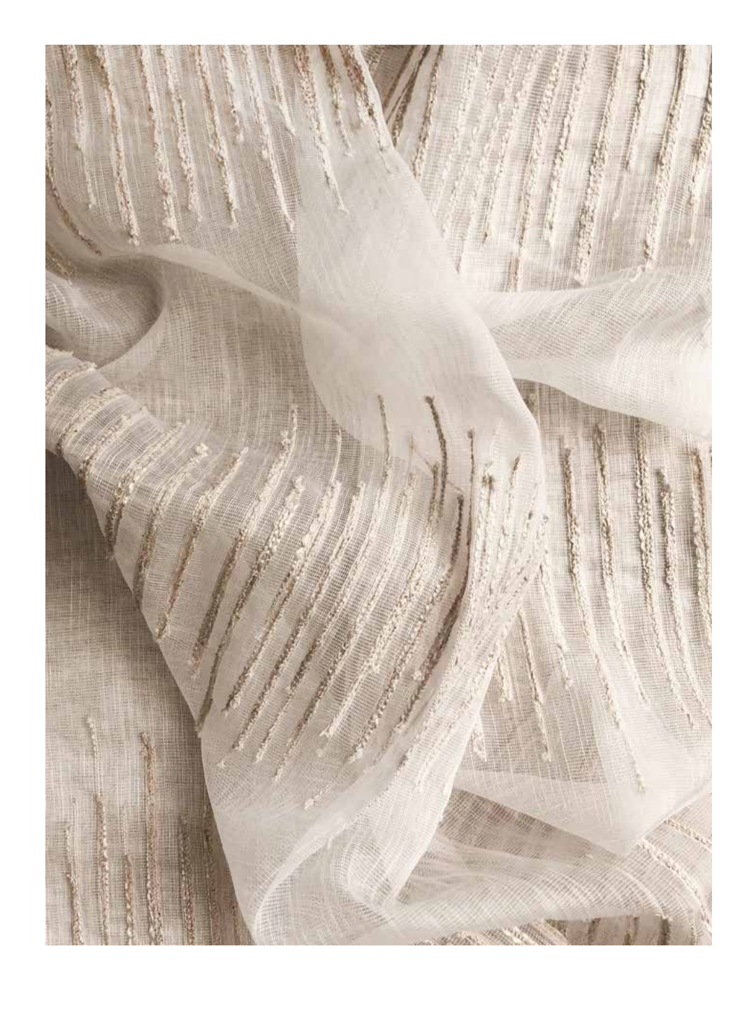
Above — Waterloo Right — Fabrics on sofa Apex Voile, Birmingham