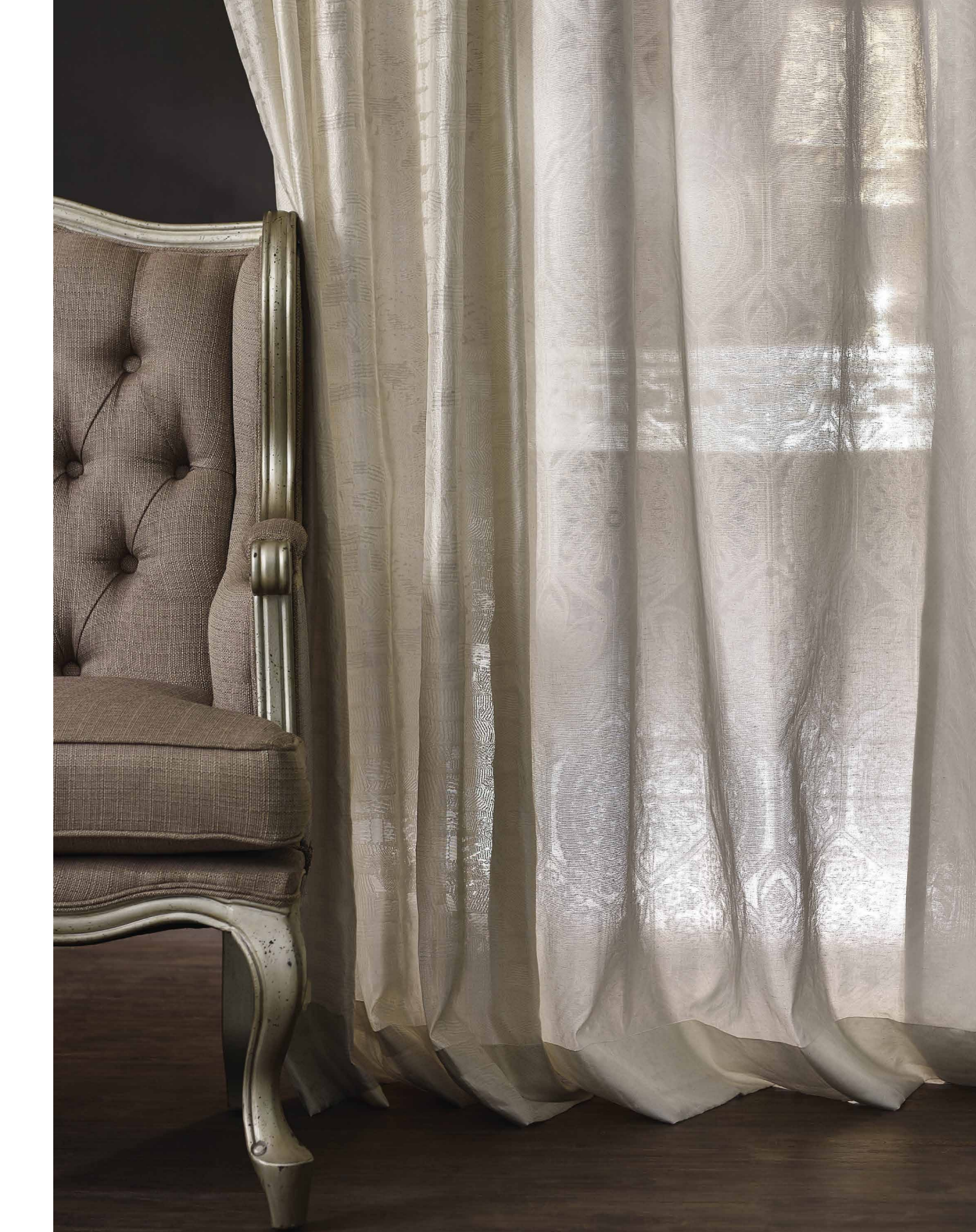
Above — Kenzington Right — Curtain Alpine