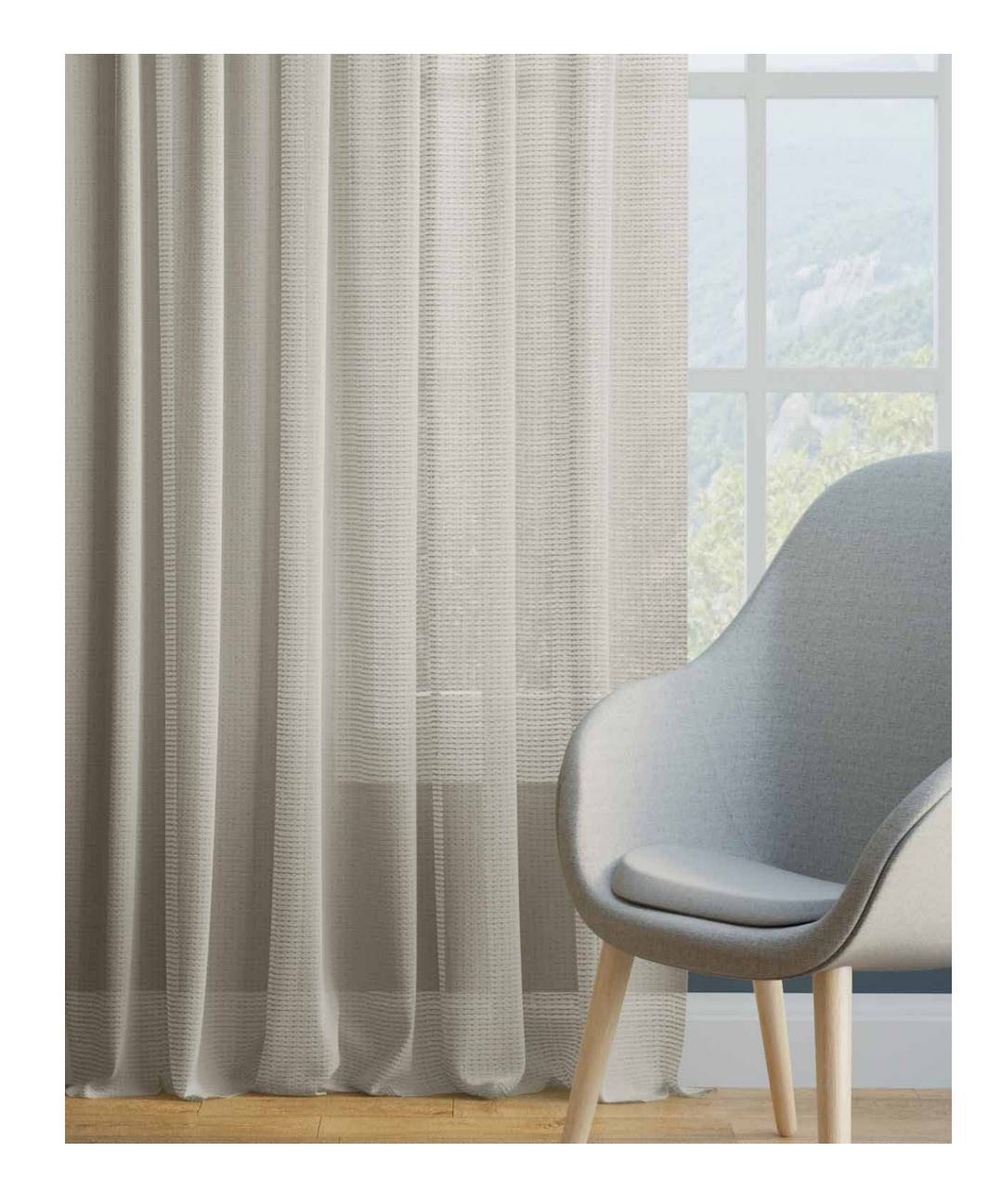
Above — Curtain Dawson Right — Curtain Apex Voile