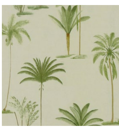
Castaway Olive Green