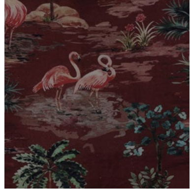
Nakuru Old Rose