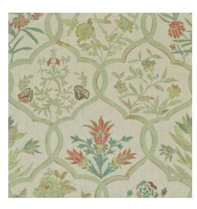
Neemrana Palace Green