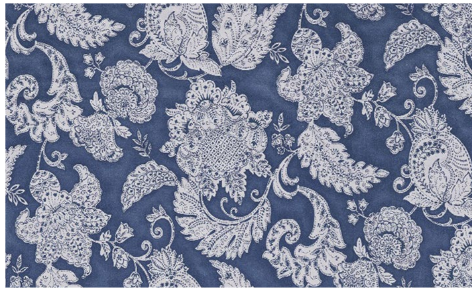
Above — Blinds Neemrana Renaissance Red, Chairs Lancaster Sepia Rose