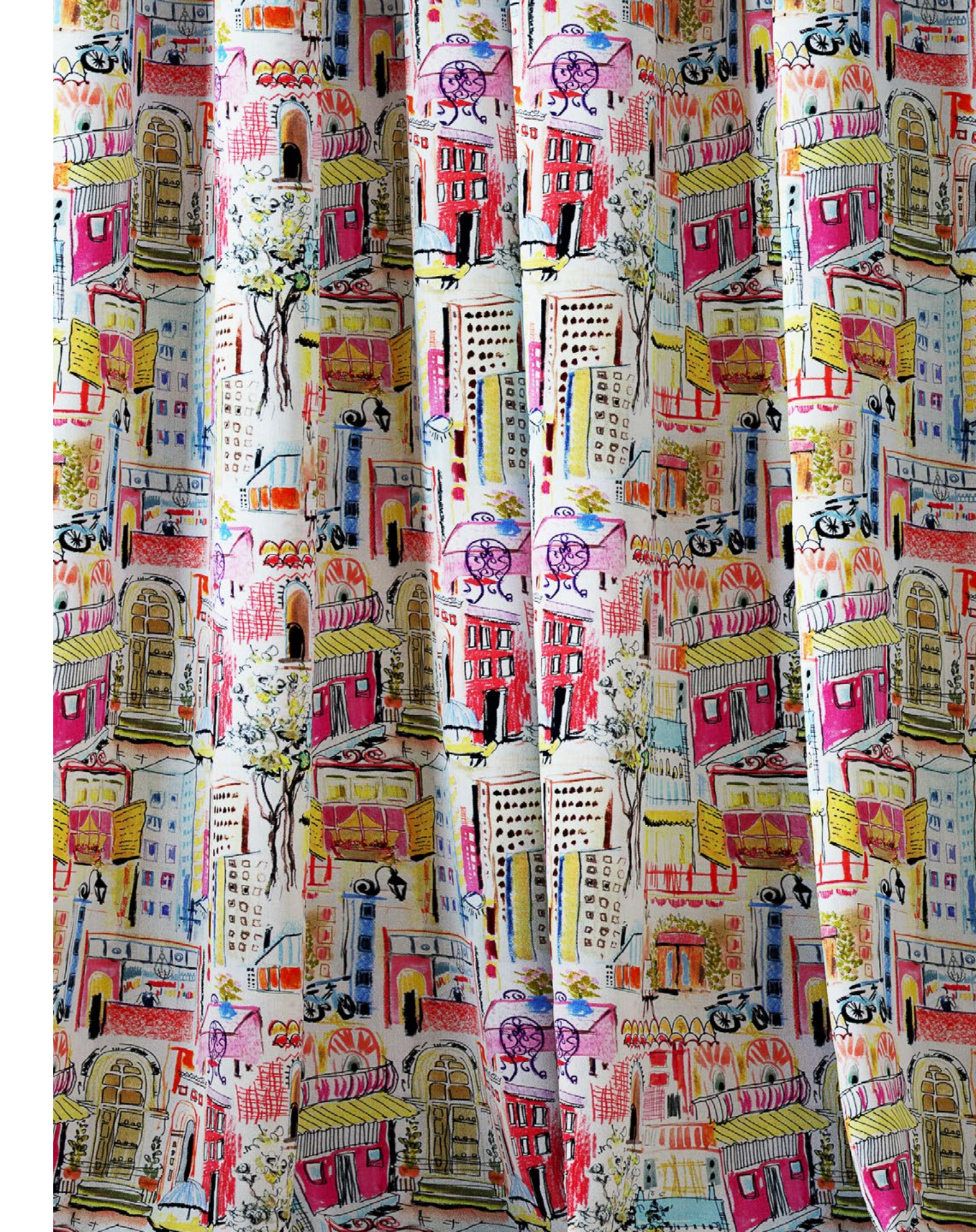
Above — Armchairs Bergamot Rouge Summer Right — Curtain Bastille Powder Pink