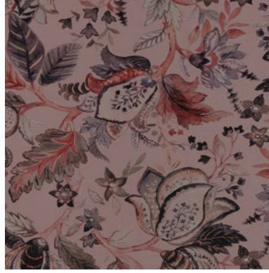
Tudor Rosewood Sage