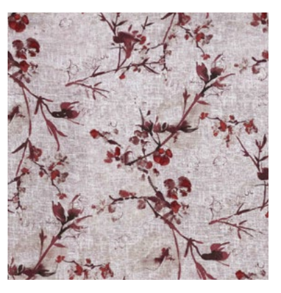
Sakura Cinnamon Sangria