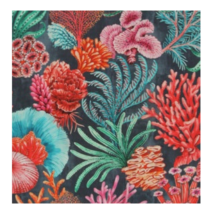
Thalassa Tangerine Sea

Composition: 100% Cotton End Use: Multipurpose