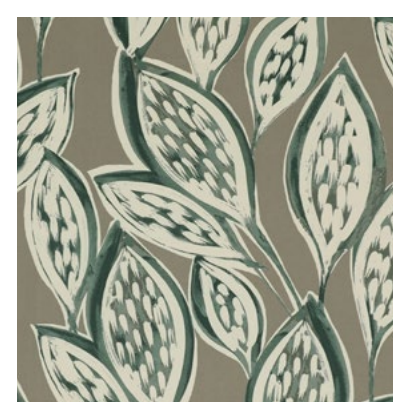
Begonia Brown Fudge