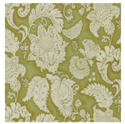
Lancaster Sonar Green