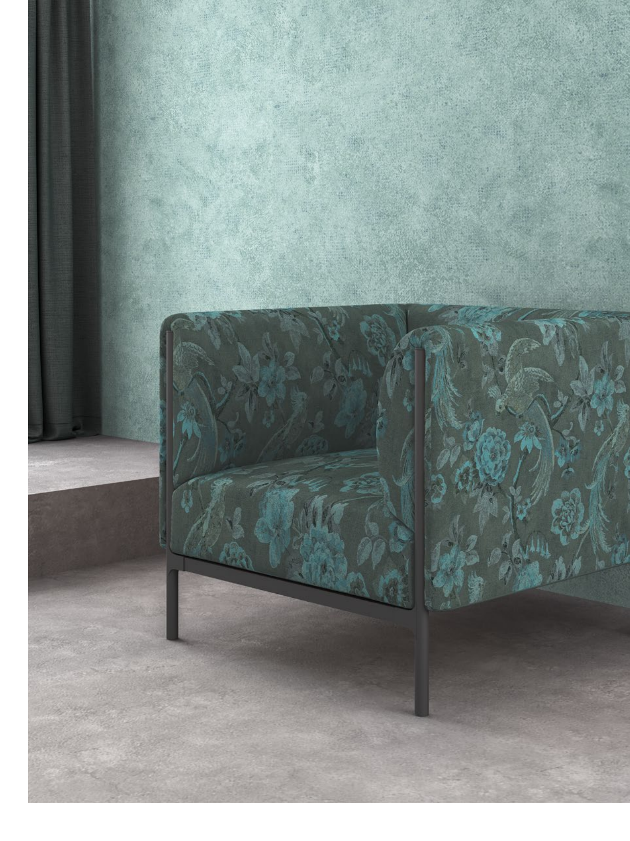
Above — Kruger Cerulean Ash Top left — Kruger Coral Tortilla Bottom left — Kruger Rosewood Sage