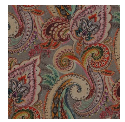
Zenobia Antique Brass