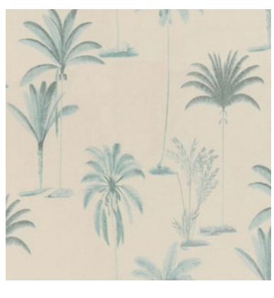
Castaway Ocean Sage