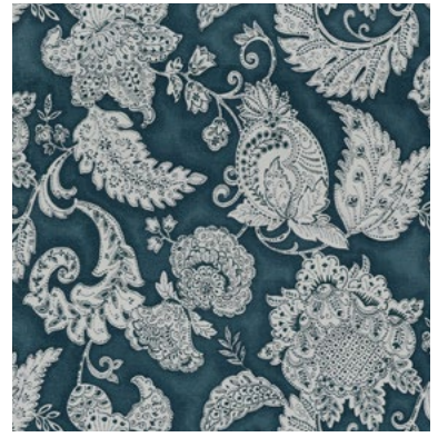
Lancaster Myrtle Green