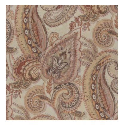
Zenobia Old Rose