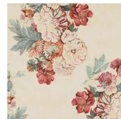
Mimosa Fresh Melon