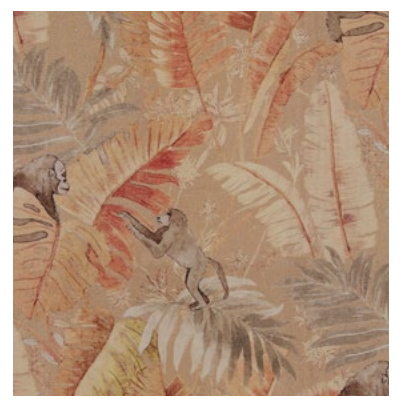
Botswana Cider Sepia

Composition: 100% Cotton End Use: Multipurpose