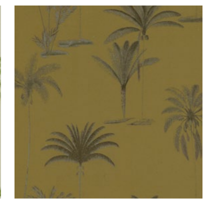
Castaway Fawn Shadow