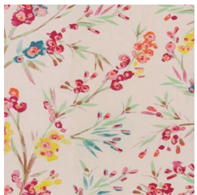
Bergamot Rouge Summer