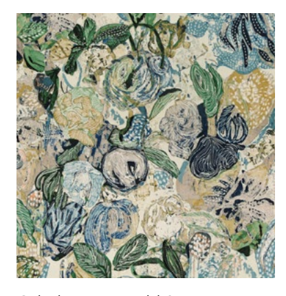
Caledonia Emerald Sea