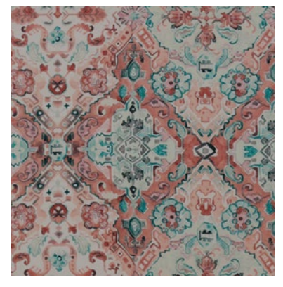
Jubilee Coral Sapphire