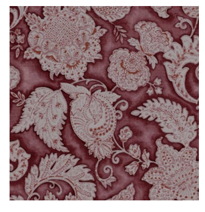
Lancaster Sepia Rose