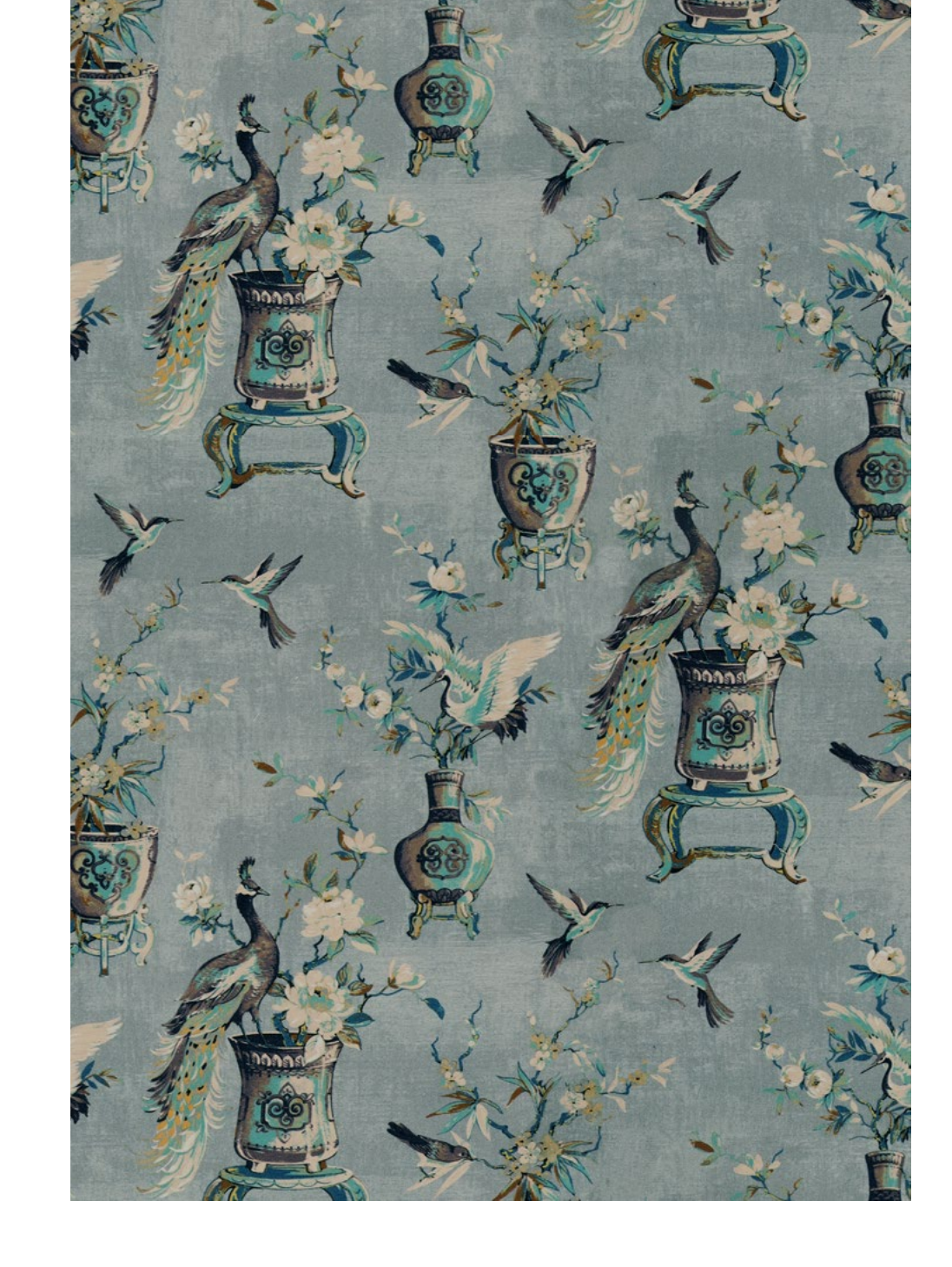
Left — Sofa Arita Coral Sand Above — Arita Cyan Stone