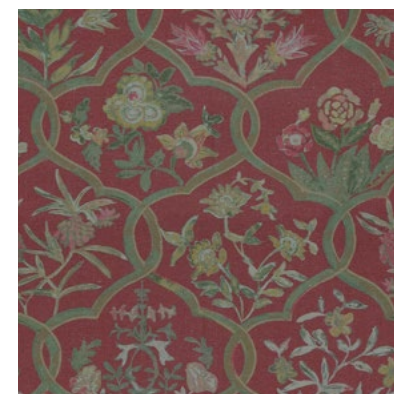
Neemrana Renaissance Red