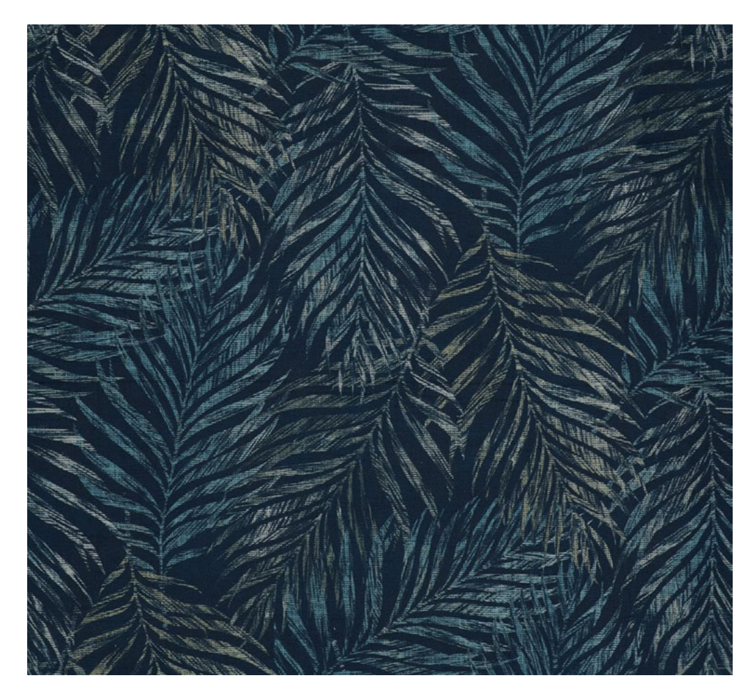
Above — Antibes Terracotta Spruce, Antibes Deep Ocean Left — Curtain Antibes Deep Ocean, Chair Camden Chasm