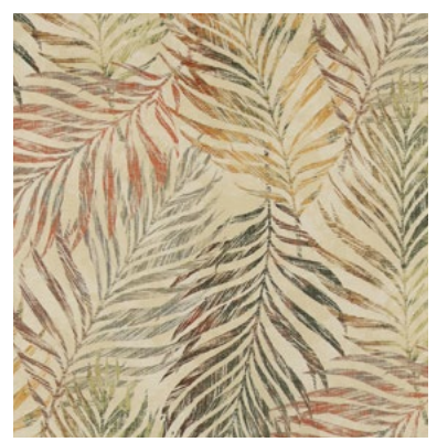
Antibes Terracotta Spruce