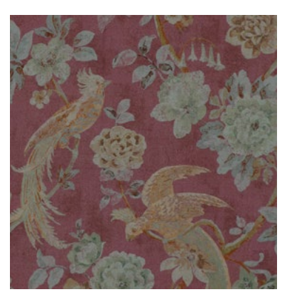
Kruger Rosewood Sage