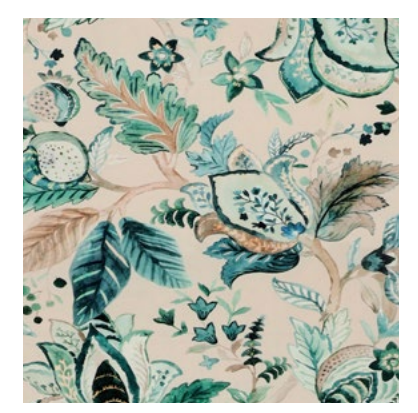
Tudor Emerald Lake

Composition: 100% Cotton End Use: Multipurpose