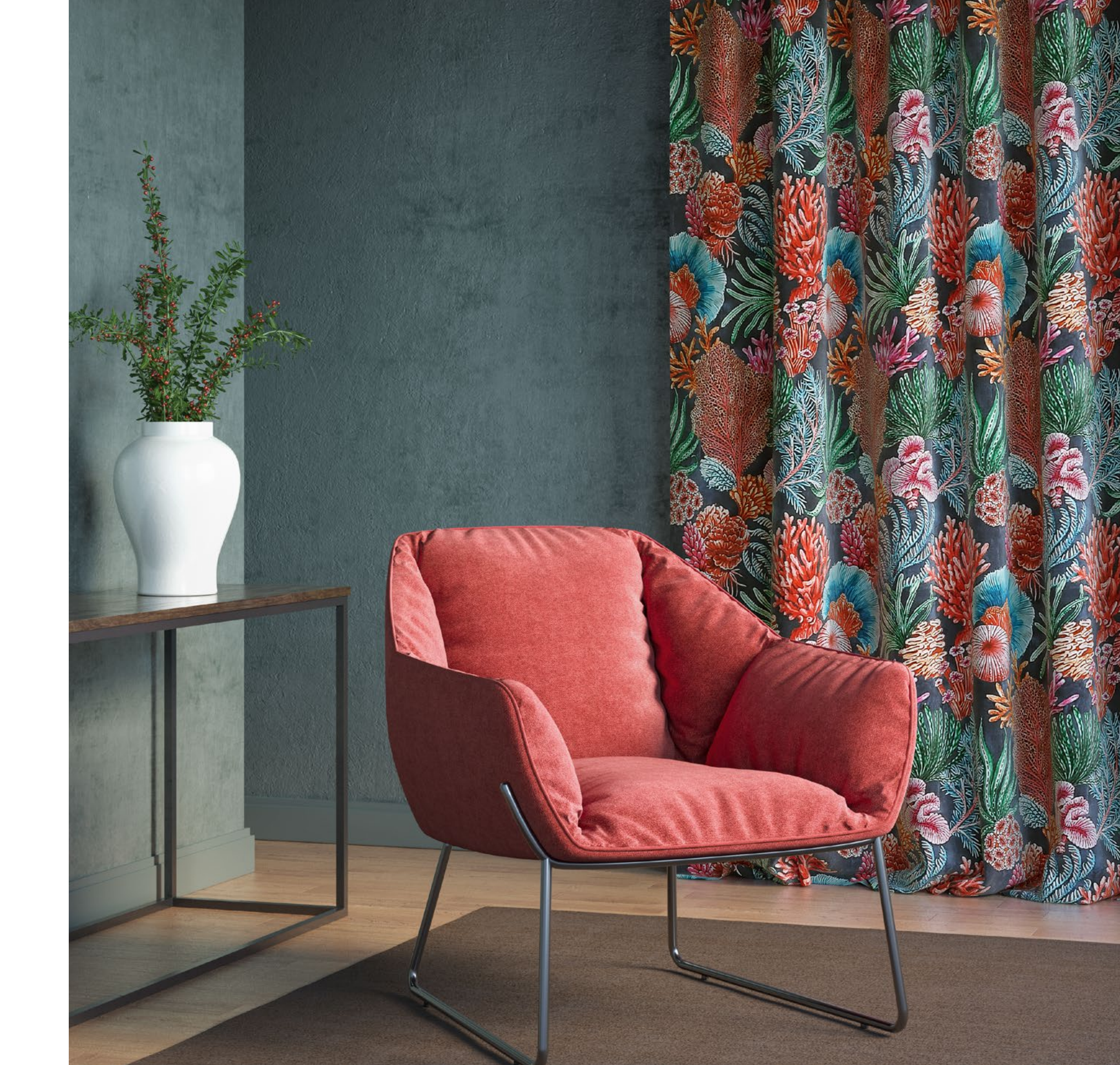
Curtain Thalassa Tangerine Sea, Armchair Corsica Cayenne