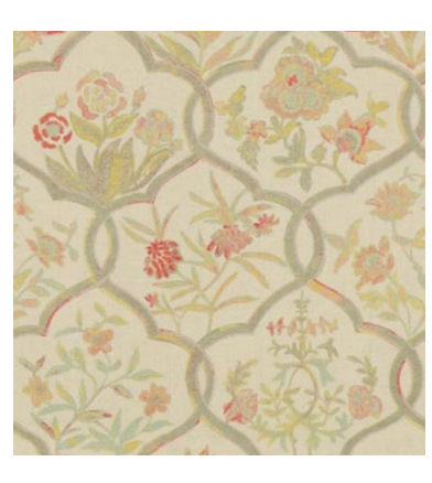
Neemrana Olive Blush