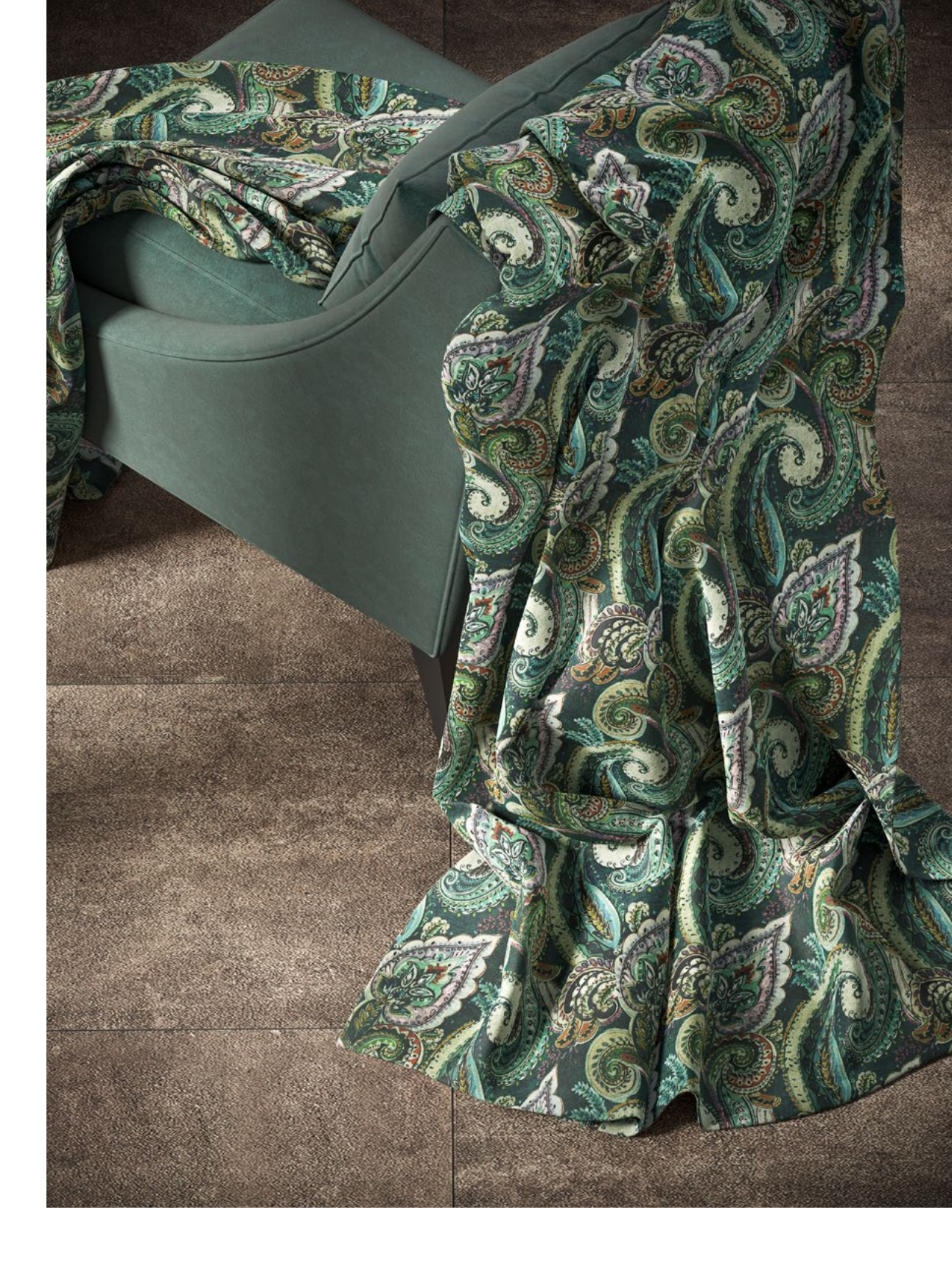
Above — Draped Fabric Zenobia Mountain Meadow, Armchair Tahlia Spruce Top left — Zenobia Antique Brass Bottom left — Zenobia Sage Ash