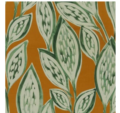
Begonia Orange Blossom