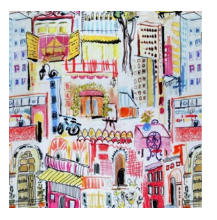
Bastille Powder Pink