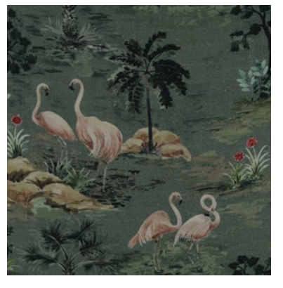
Nakuru Arctic Slate