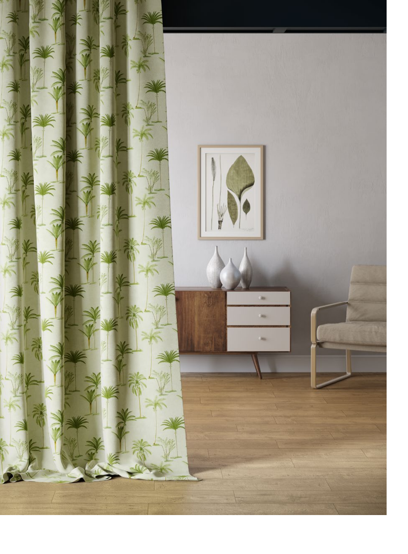
Above — Castaway Olive Green Top right — Castaway Ocean Sage Bottom right — Castaway Fawn Shadow