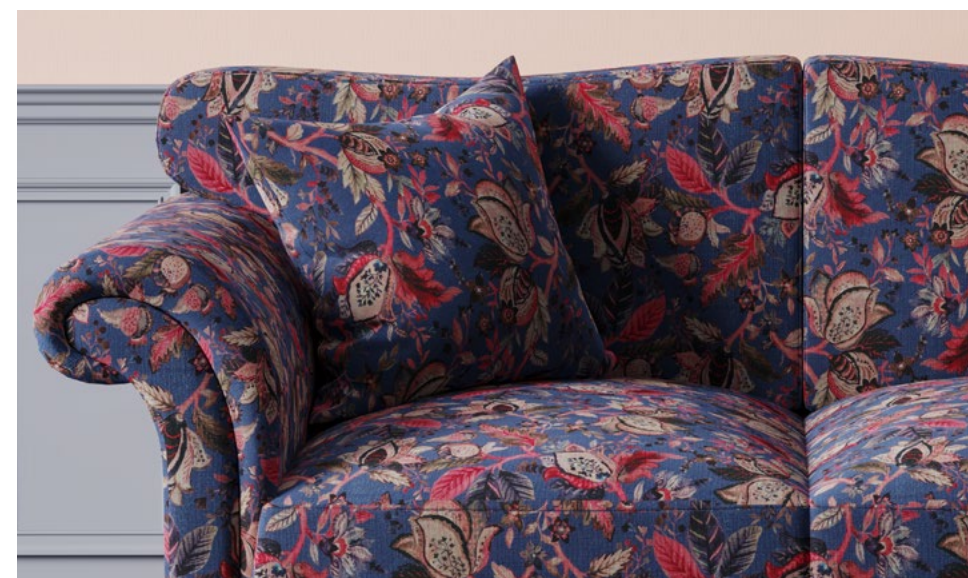
Above — Sofa Tudor Rosewood Sage