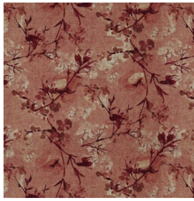
Sakura Sepia Rose