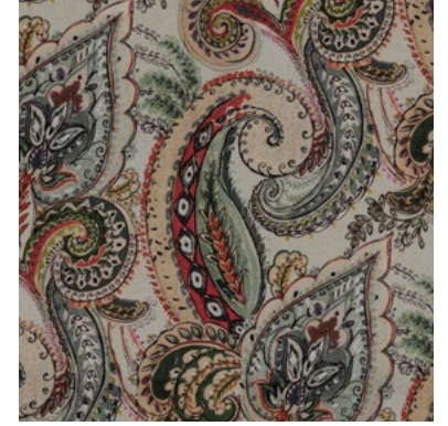
Zenobia Sage Ash