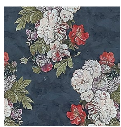
Mimosa Coral Slate