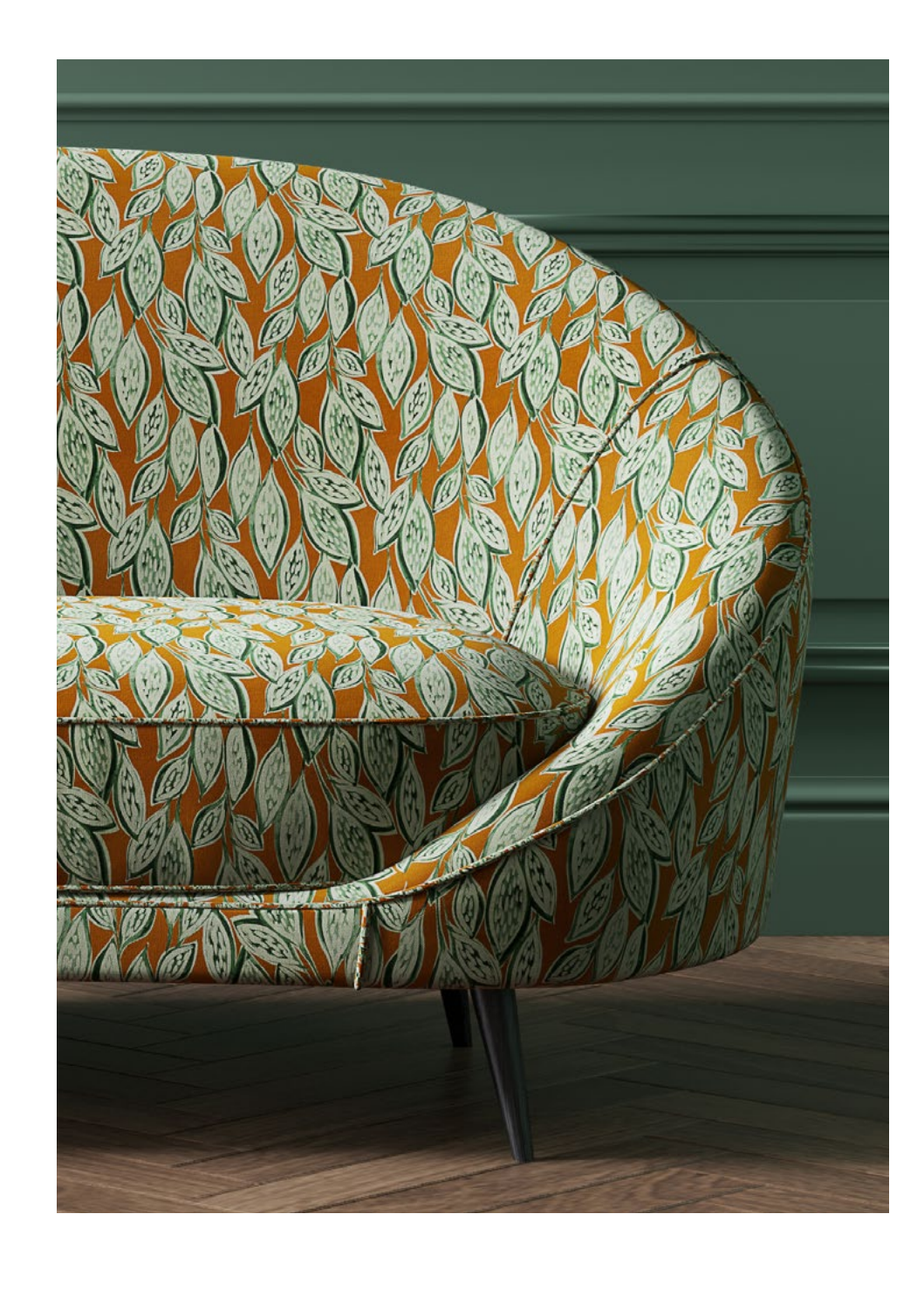
Above — Sofa Begonia Orange Blossom Top Right — Sofa Begonia Brown Fudge, Cushion Vernazza Turquoise Bottom Right — Begonia Brown Fudge