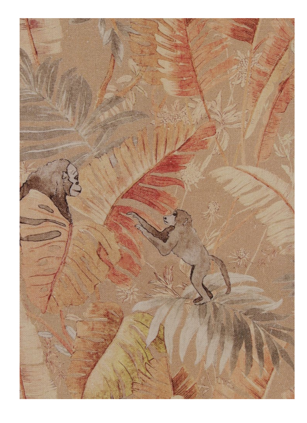
Above — Botswana Cider Sepia Top Right — Curtain & Wall Covering Botswana Rosewood Pine Bottom Right — Botswana Spruce Parchment