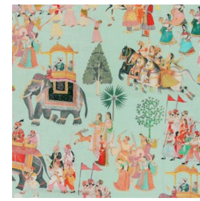
Maurya Turquoise Jewel