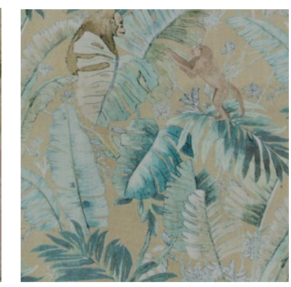
Botswana Spruce Parchment