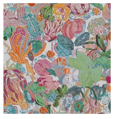
Caledonia Raspberry Forest