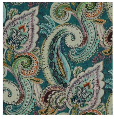
Zenobia Mountain Meadow