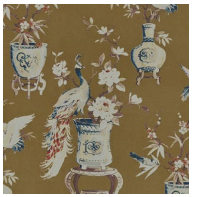
Arita Coral Sand

Composition: 100% Cotton End Use: Multipurpose