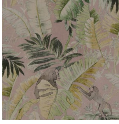
Botswana Rosewood Pine