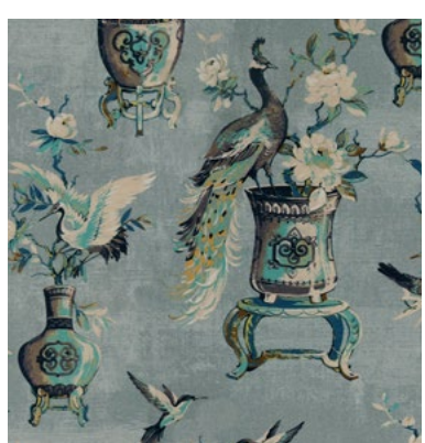
Arita Cyan Stone