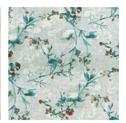
Sakura Teal Cherry