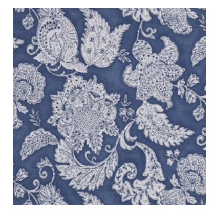
Lancaster Indigo Salt

Composition: 100% Cotton End Use: Multipurpose