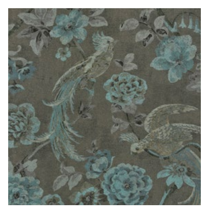
Kruger Cerulean Ash