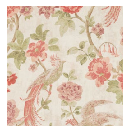
Kruger Coral Tortilla