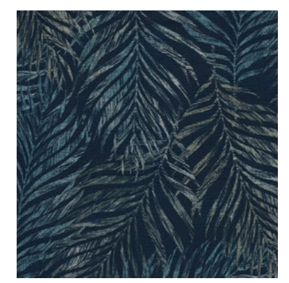
Antibes Deep Ocean

Composition: 100% Cotton End Use: Multipurpose