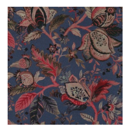
Tudor Turkish Tile