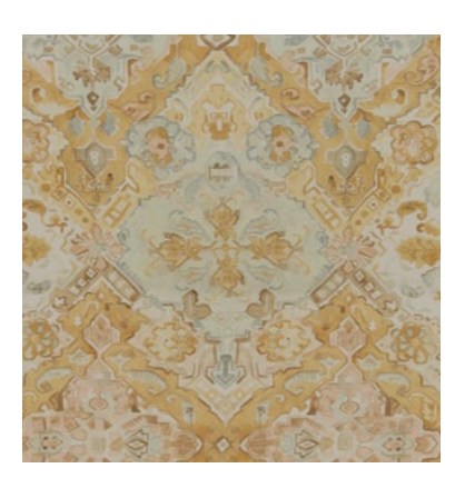
Jubilee Amber Tan

Composition: 100% Cotton End Use: Multipurpose