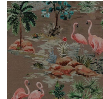
Nakuru Pine Ash