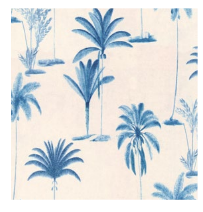
Castaway Aegean Ivory