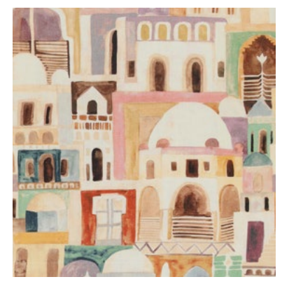
Zabeel Sand Safari

Composition: 100% Cotton End Use: Multipurpose