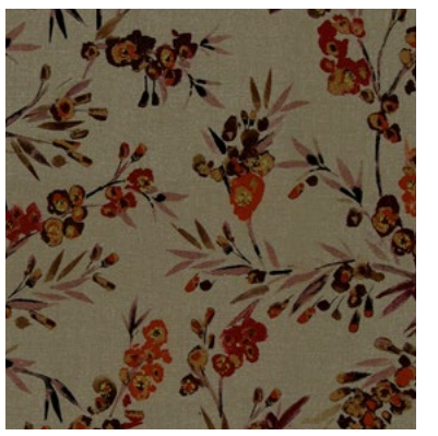
Bergamot Garnet Clay

Composition: 100% Cotton End Use: Multipurpose