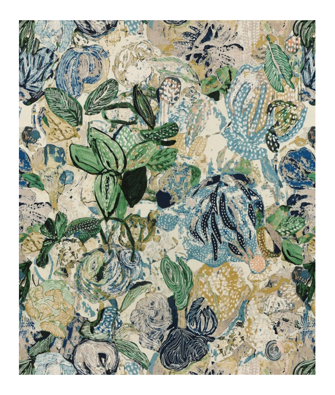
Above — Caledonia Emerald Sea