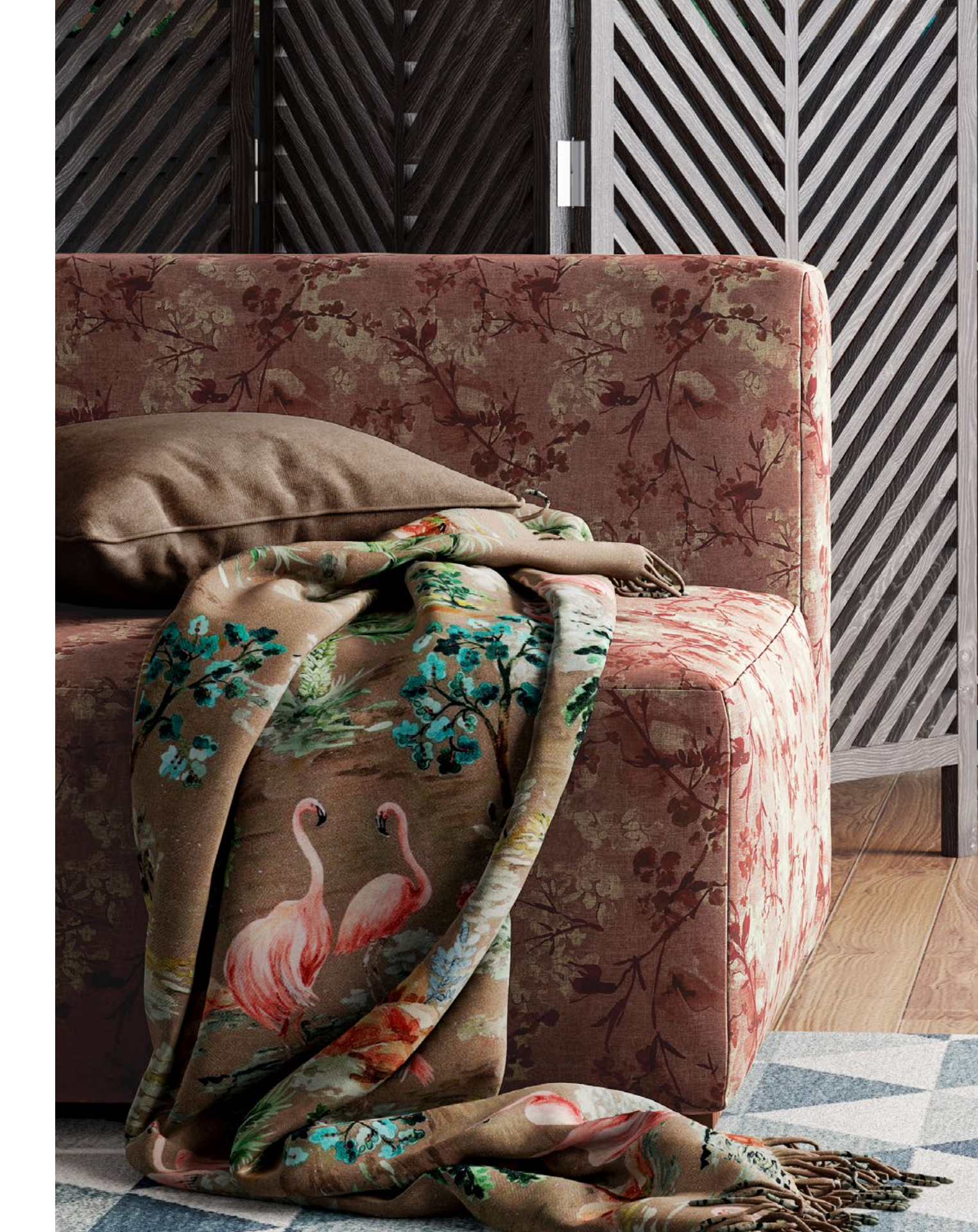
Above — Nakuru Old Rose Right — Sofa Sakura Sepia Rose, Throw Nakuru Pine Ash, Cushion Corsica Prarie Sand