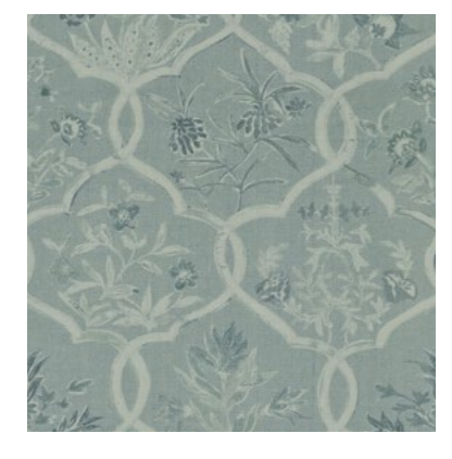
Neemrana Ivory Spruce