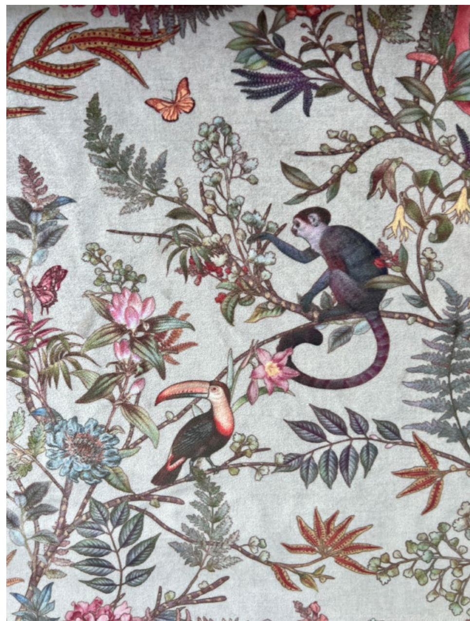
Above — Parco Dora Pearl Left — Top to Bottom Sunderban Glacier, Ranthambore Sapphire, Parco Dora Pearl