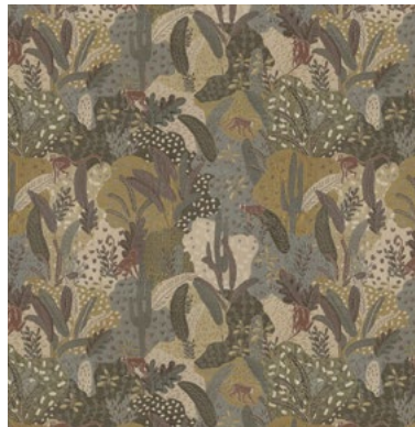
Saguaro Mustard Gold