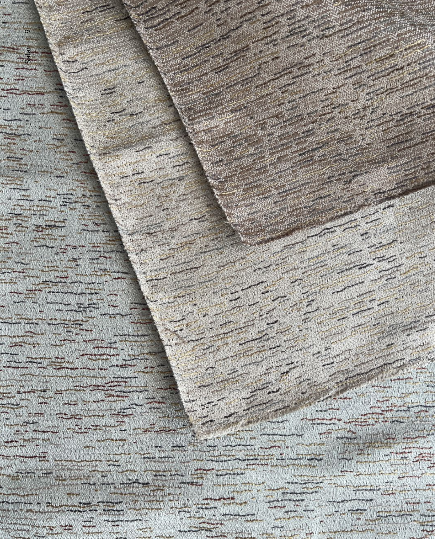
Top to bottom — Ranthambore Oyster Grey, Ranthambore Glacier, Ranthambore Sapphire