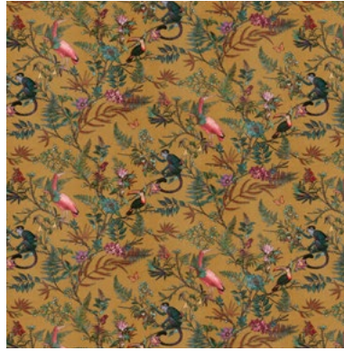
Parco Dora Ochre