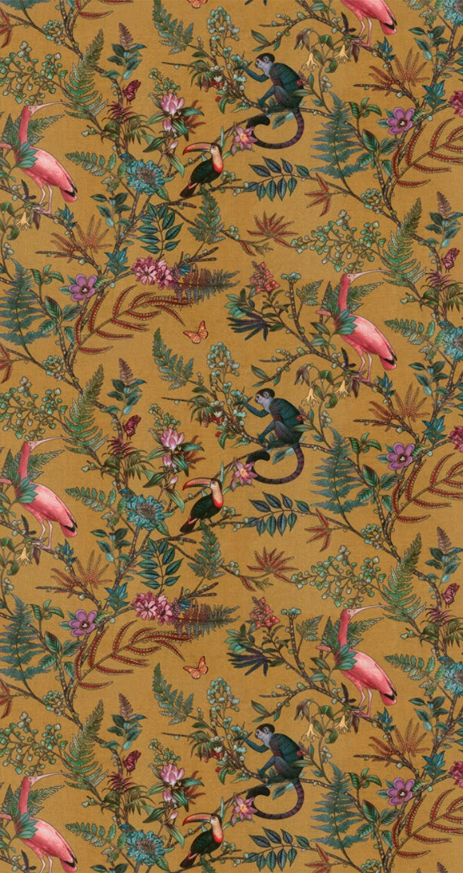
Parco Dora Ochre