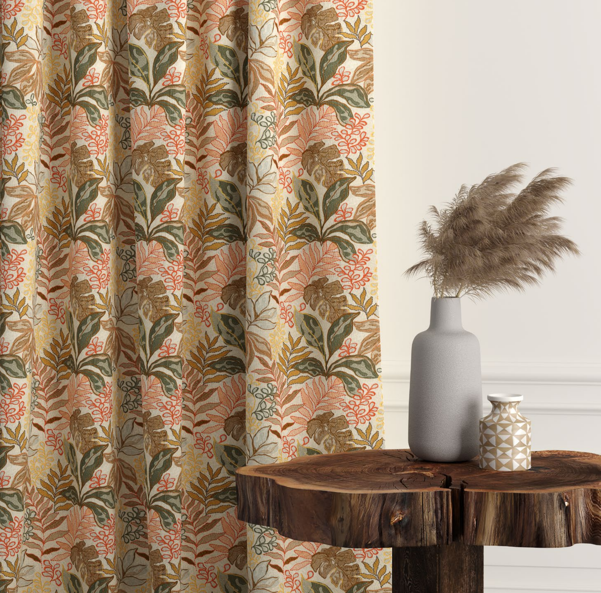
Curtain Bandipur Ginger