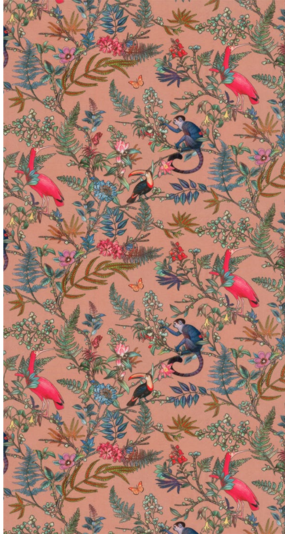
Parco Dora Salmon