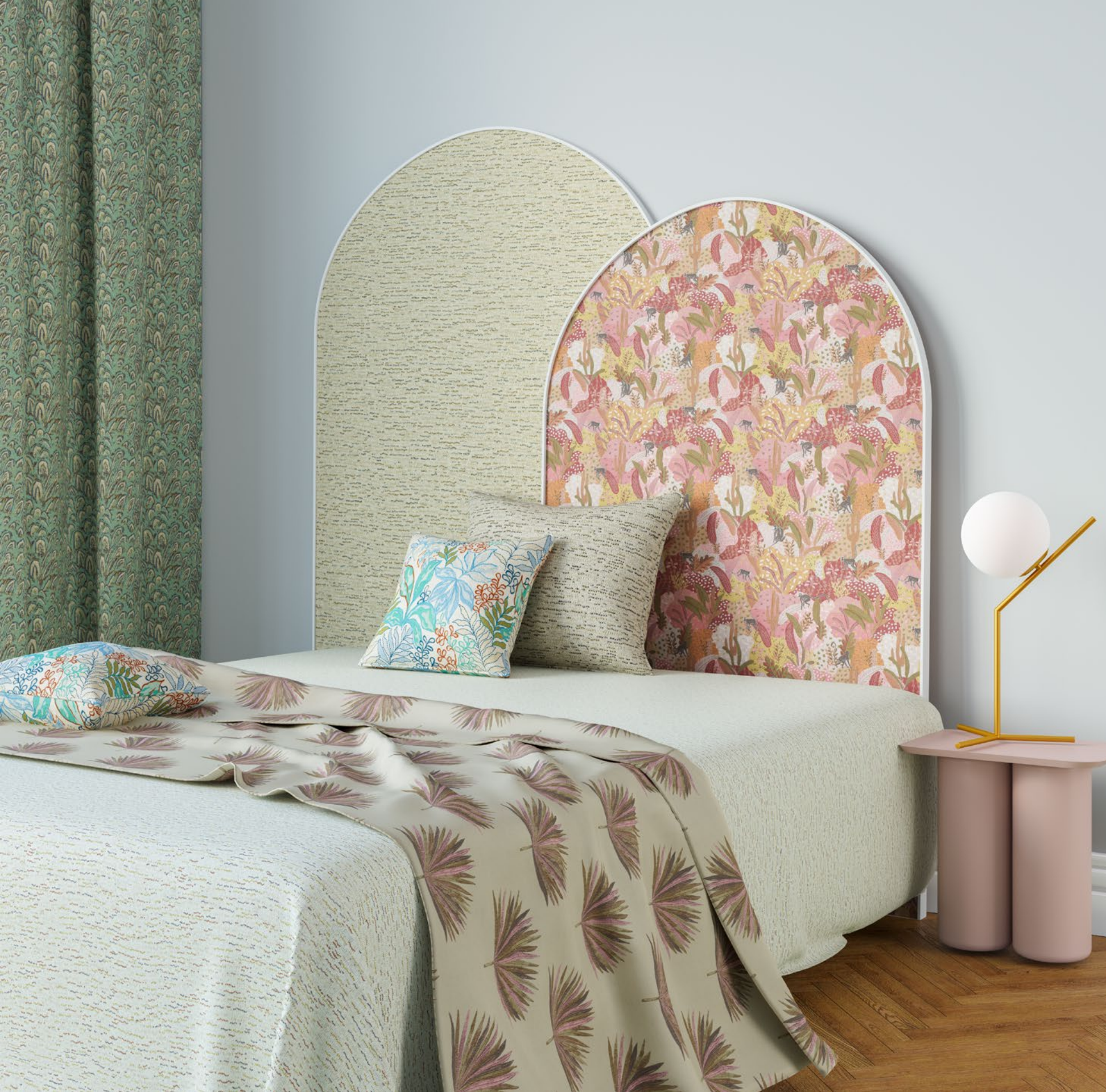
Curtain Sunderban Glacier Headboard Ranthambore Parchment, Saguaro Salmon Bedspread Ranthambore Glacier, Throw Joshua Peony, Cushions Ranthambore Parchment, Bandipur Heritage Blue