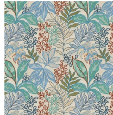
Bandipur Heritage Blue