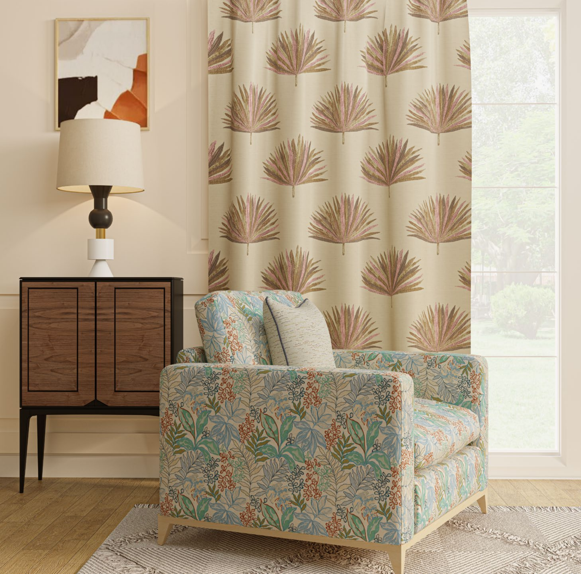
Curtain Joshua Peony, Cushion Ranthambore Glacier, Armchair Bandipur Heritage Blue