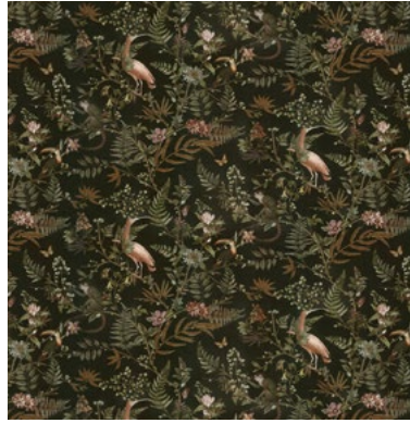
Parco Dora Thyme