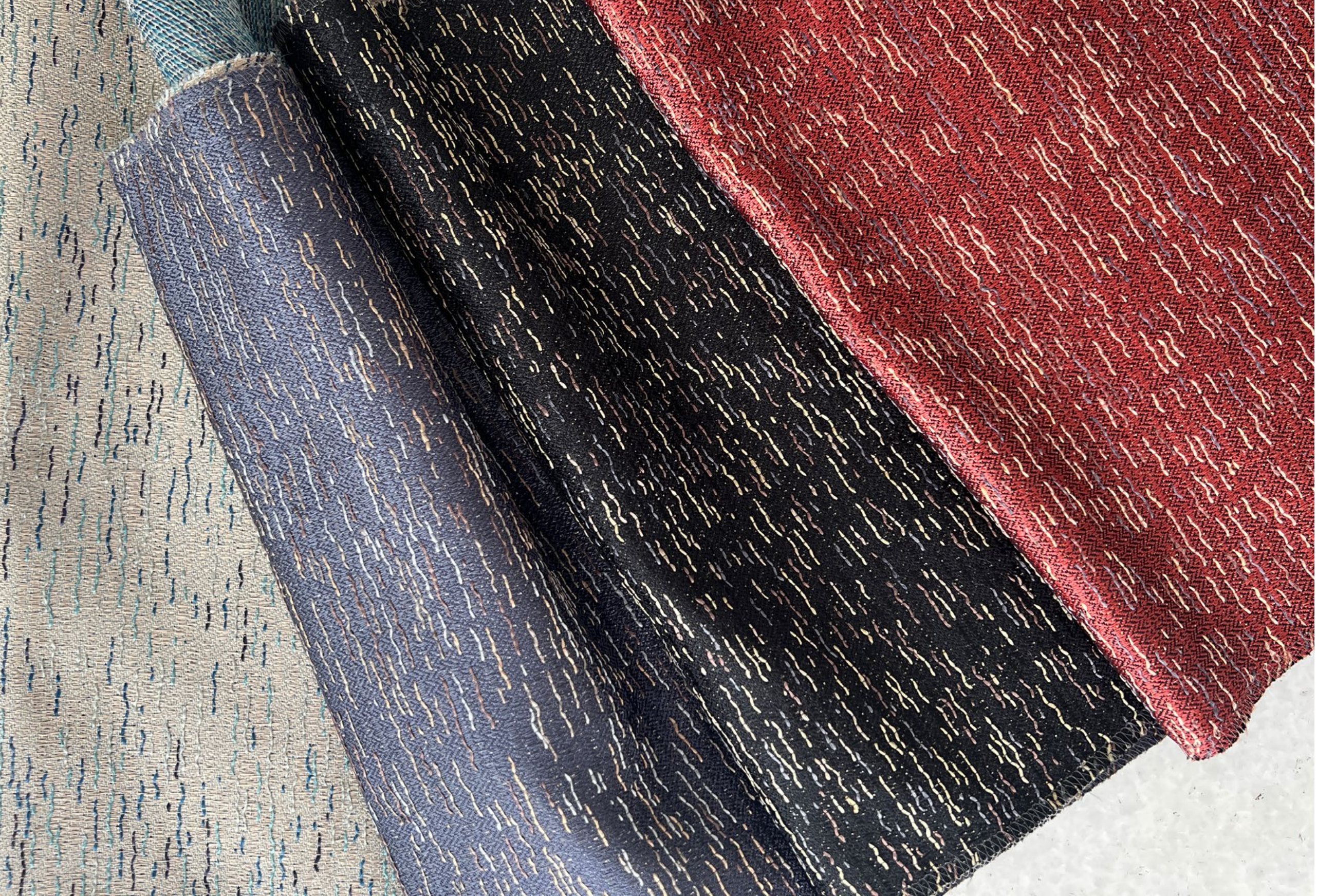
Left to right — Ranthambore Sapphire, Ranthambore Indigo, Ranthambore Noir, Ranthambore Crimson