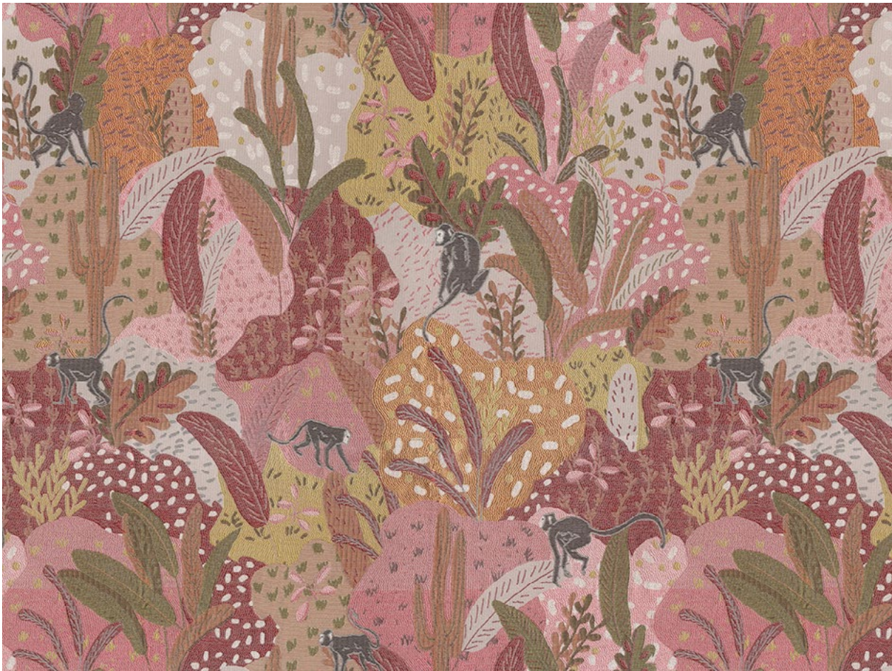
Above — Saguaro Sapphire Top left — Saguaro Copper Bottom left — Saguaro Salmon