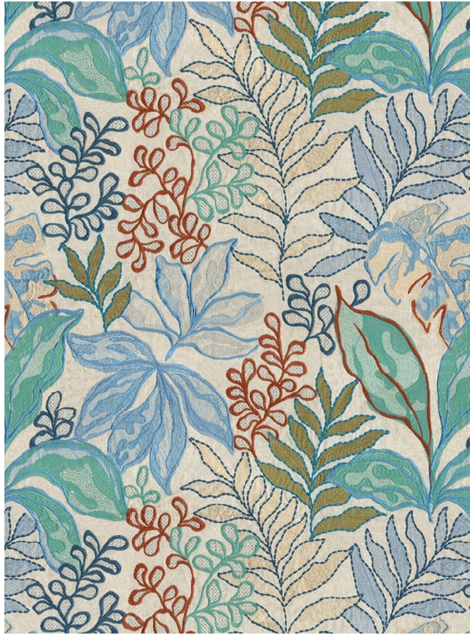
Above — Bandipur Heritage Blue Right — Bandipur Ginger