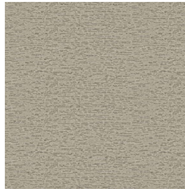
Ranthambore Oyster Grey