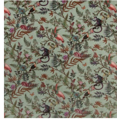
Parco Dora Pearl