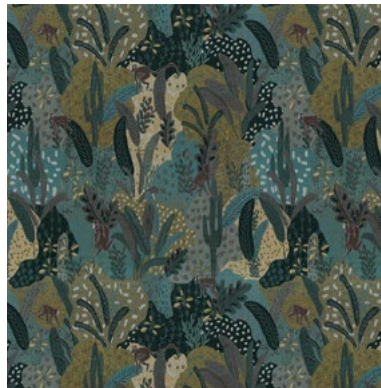
Saguaro Dark Forest