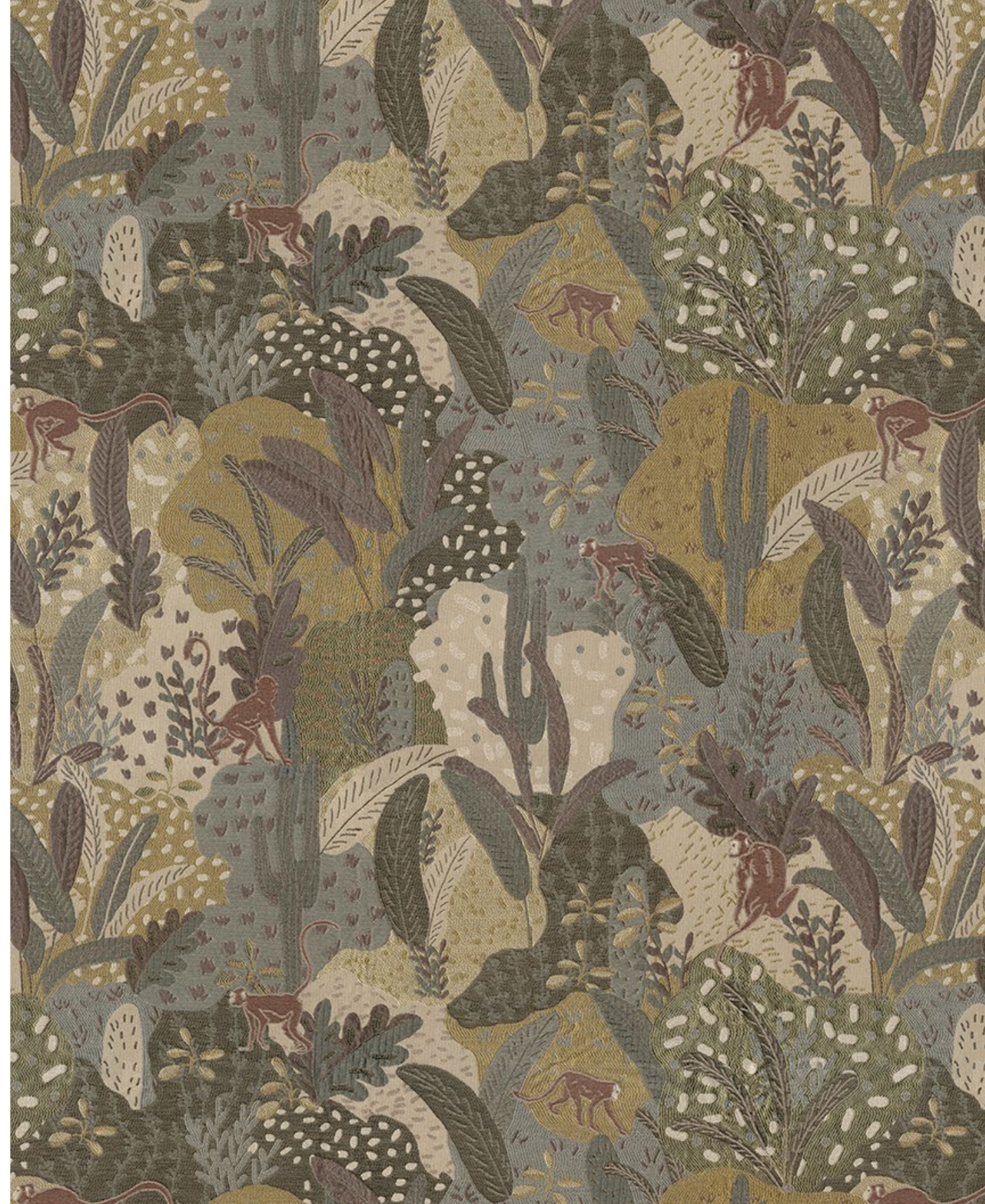
Saguaro Mustard Gold