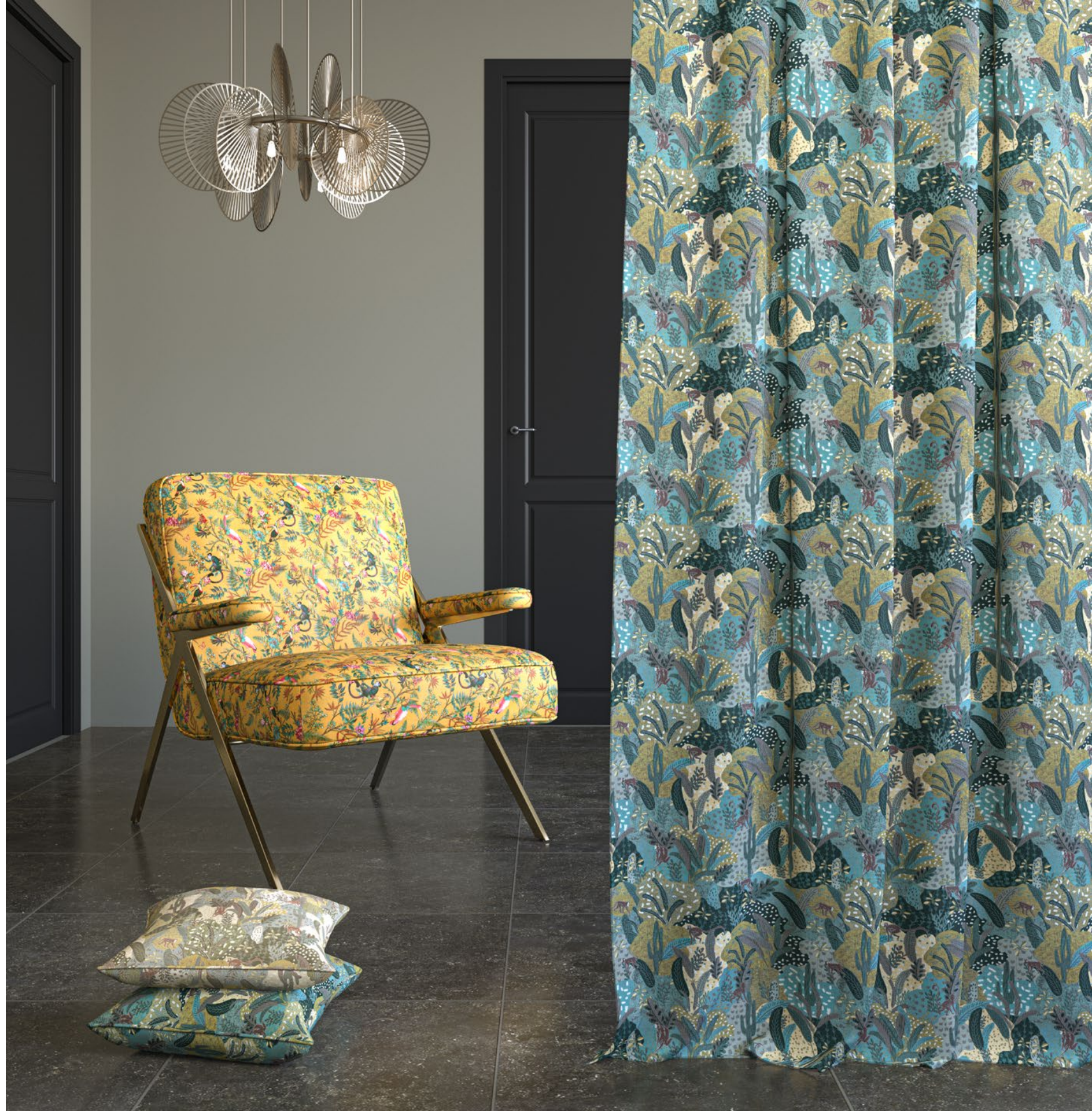
Curtain Saguario Dark Forest, Armchair Parco Dora Ochre, Cushions Saguario Dark Forest, Saguario Mustard Gold