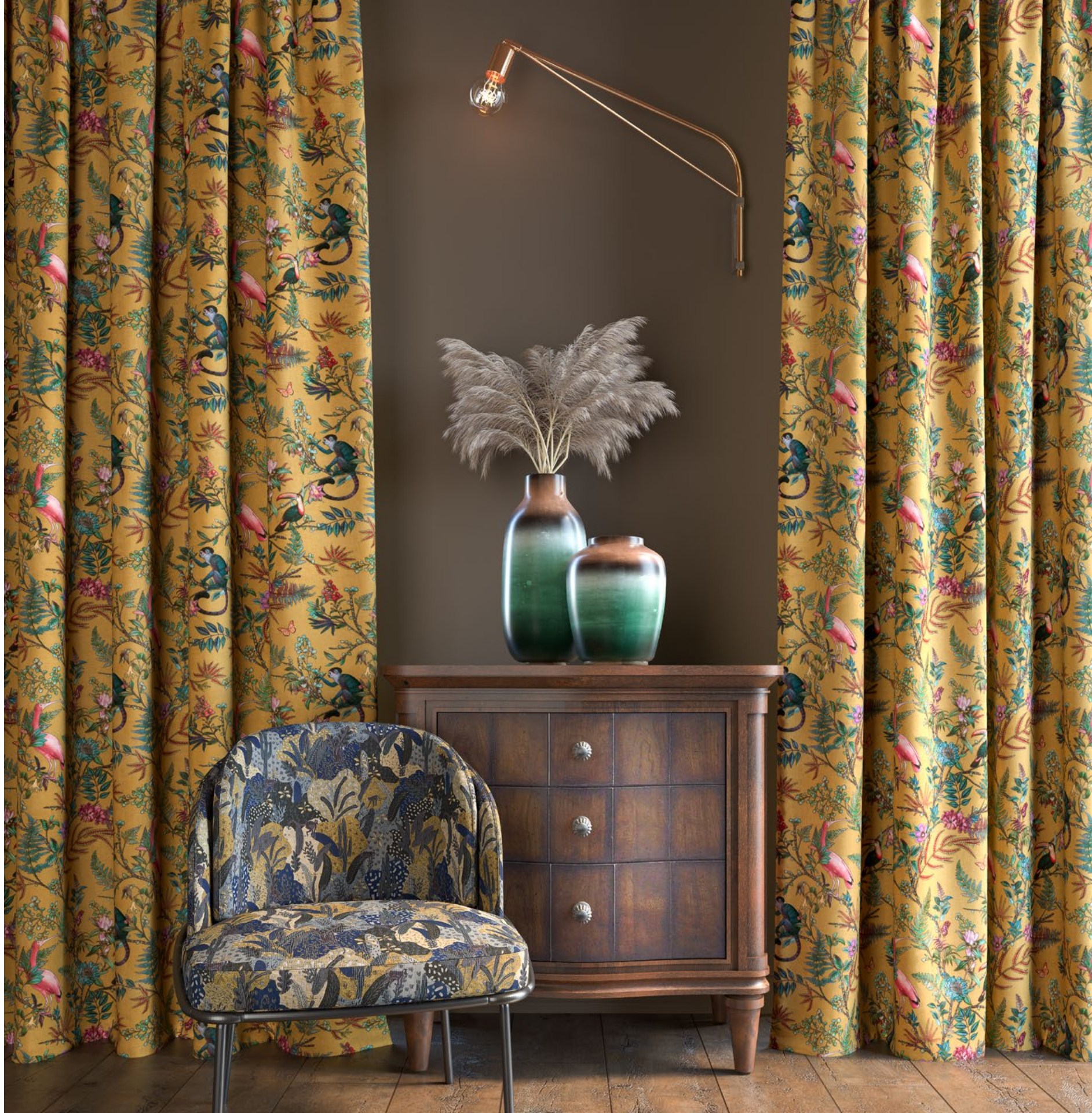
Curtain Parco Dora Ochre Armchair Saguaro Sapphire