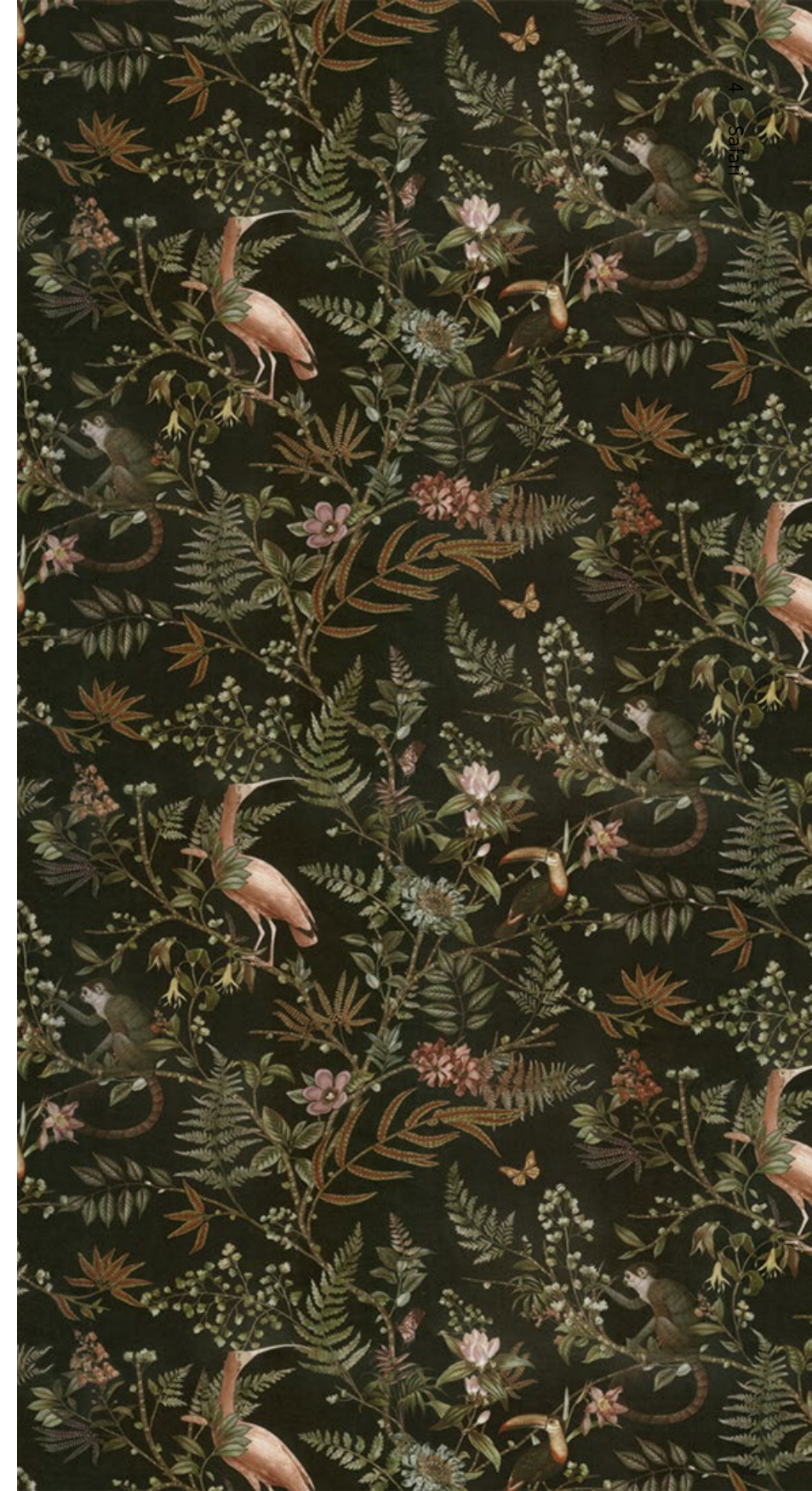
Parco Dora Thyme