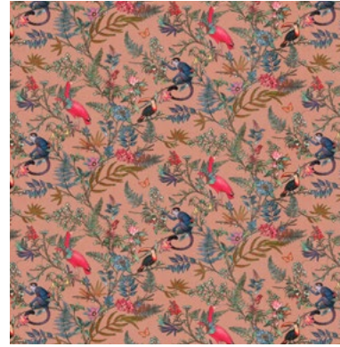
Parco Dora Salmon