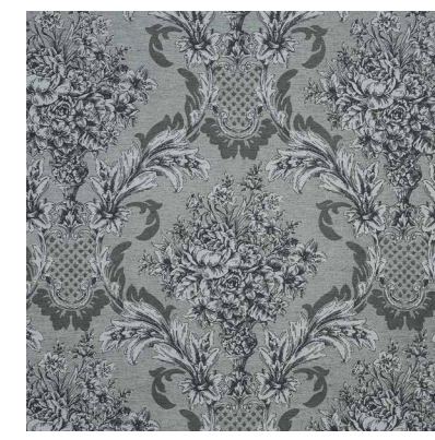
Samode Dawn Blue