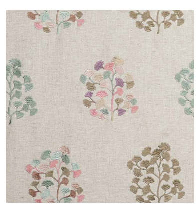
Meenakari Crystal Pink