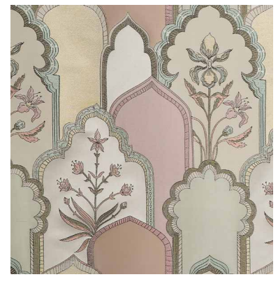
Fresco Crystal Pink