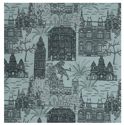
Wodeyar Dawn Blue