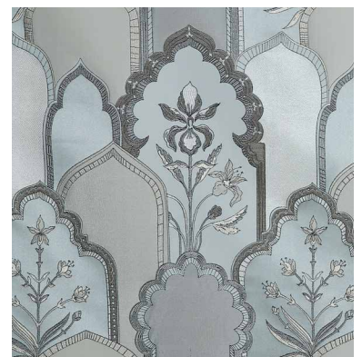
Fresco Dawn Blue