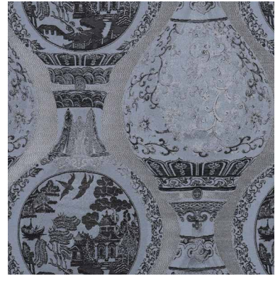
Ming Dawn Blue