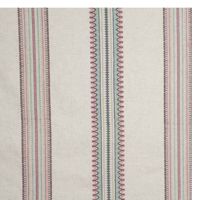
Pichola Crystal Pink