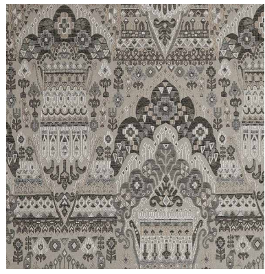
Angkor Mojave Desert