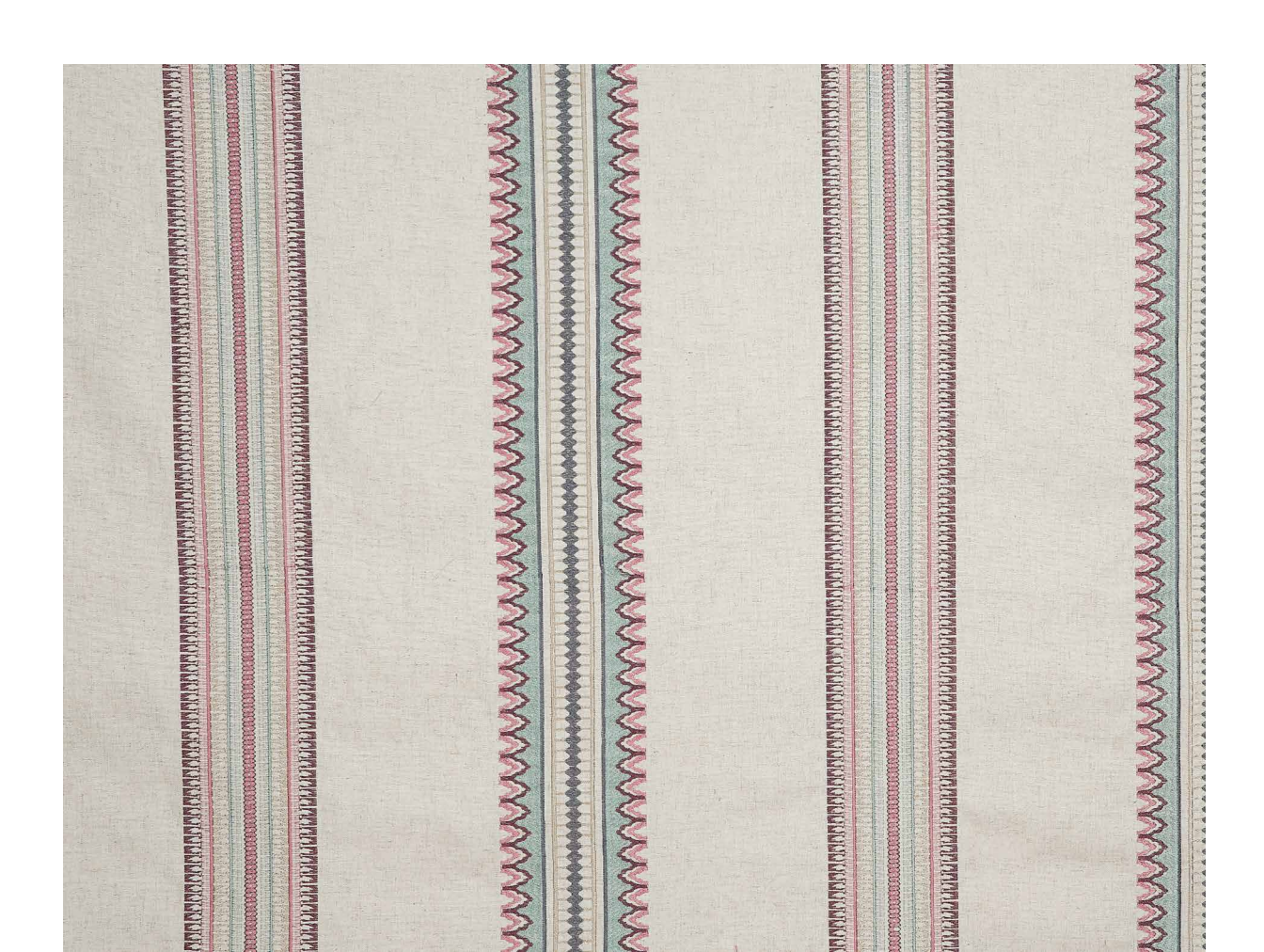
Above — Meenakari Allure Top right — Vilaas Allure Bottom right — Pichola Crystal Pink