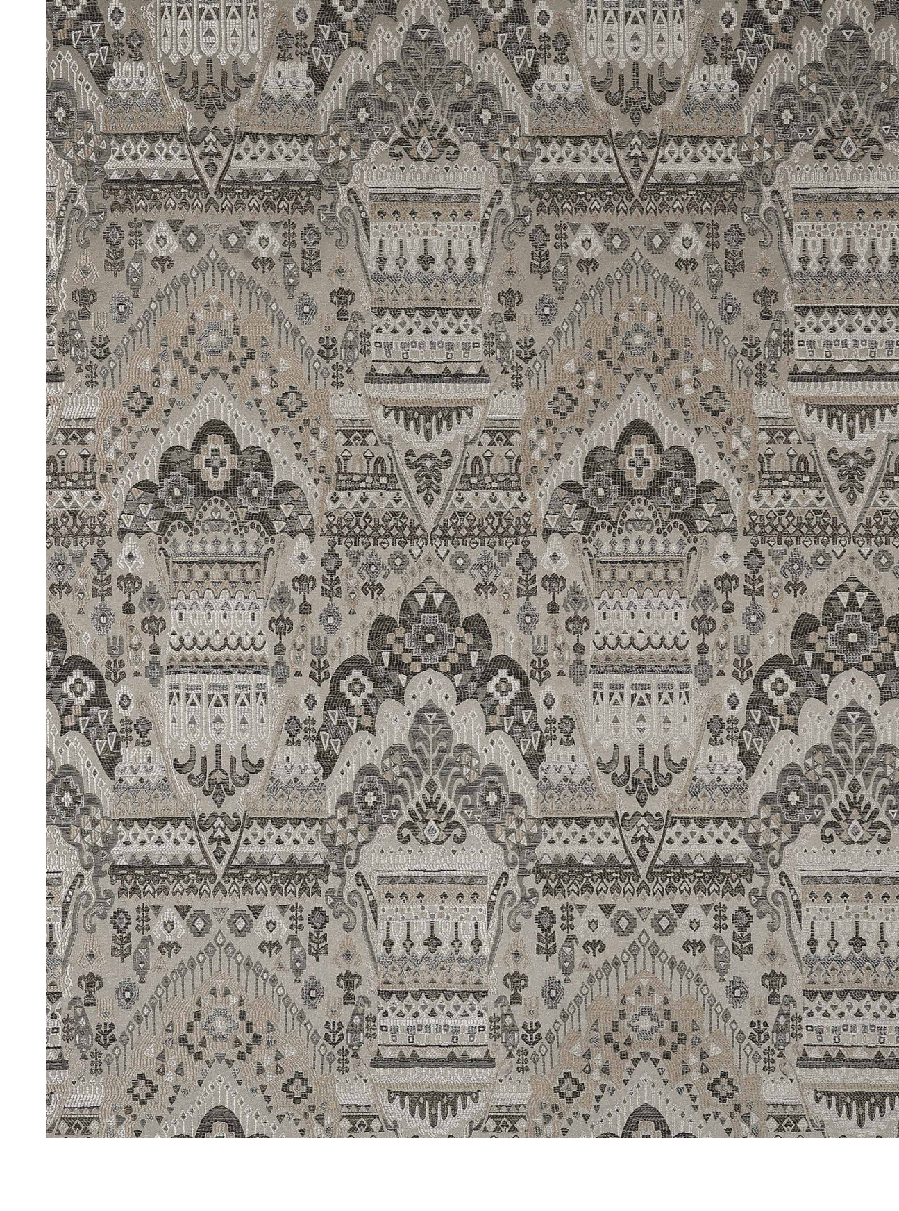
Above — Angkor Mojave Desert Top left — Kasturi Crystal Pink Bottom left — Sofa Kasturi Crystal Pink, Cushions Mombasa Lilac Mist, Angkor Crystal Pink, Mombasa Biscoti