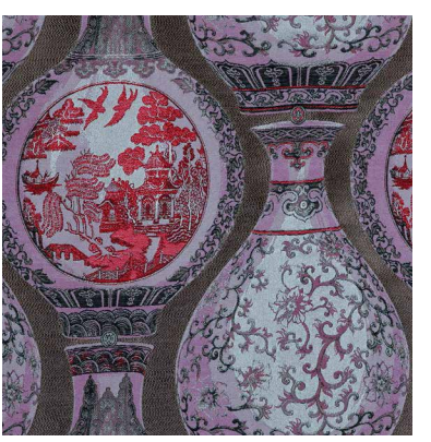
Ming Crystal Pink