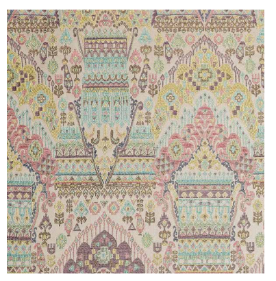
Angkor Crystal Pink