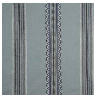
Pichola Dawn Blue