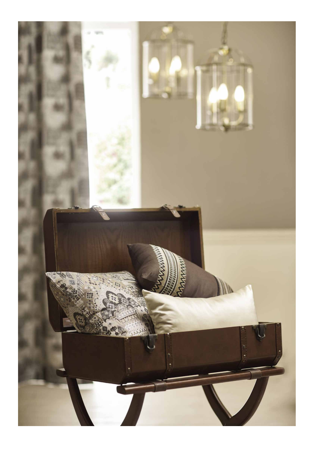
Above — Cushions Angkor Mojave Desert, Pichola Birch, Mombasa Biscotti Right — Curtain Wodeyar Birch