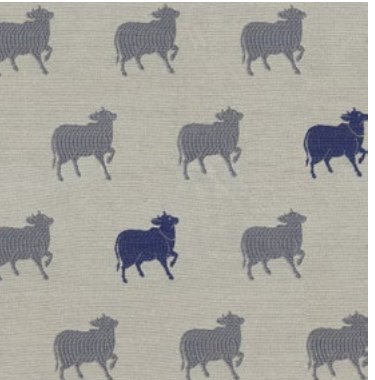
Pinjori Medieval Blue