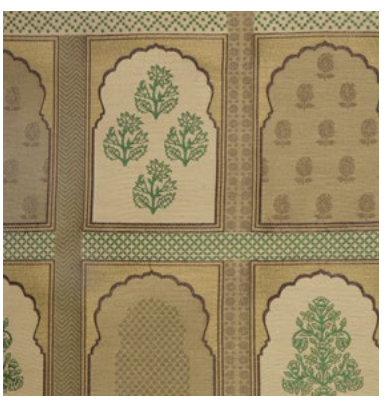
Shalamar Dull Gold