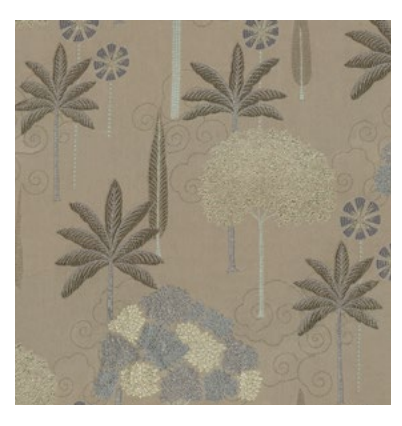
Himayat Dull Gold