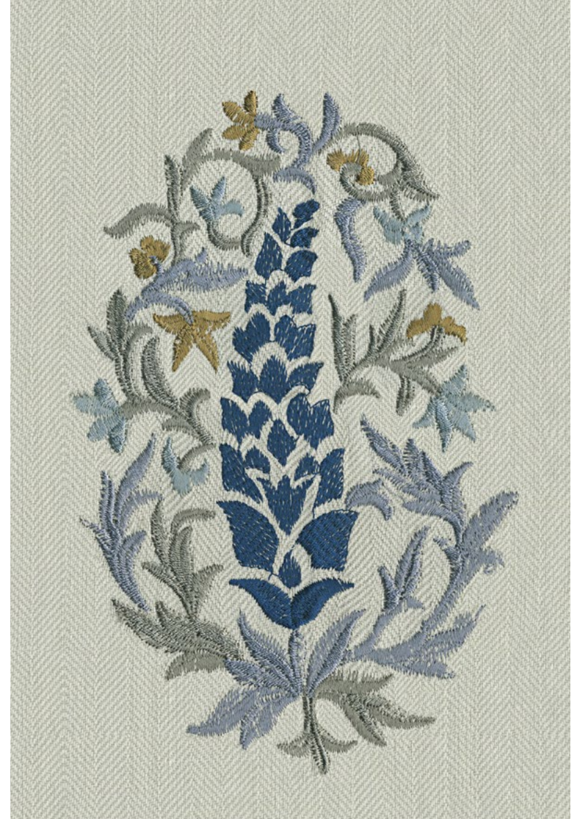
Close up of the embroidery from Zakir Below — Zakir Marine Blue Right — Zakir Medieval Blue