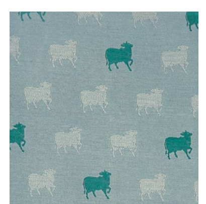
Pinjori Marine Blue