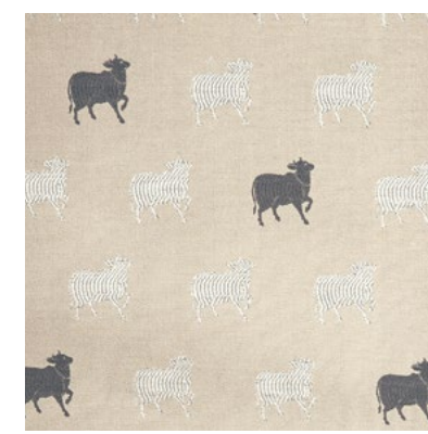
Pinjori Oyester Gret