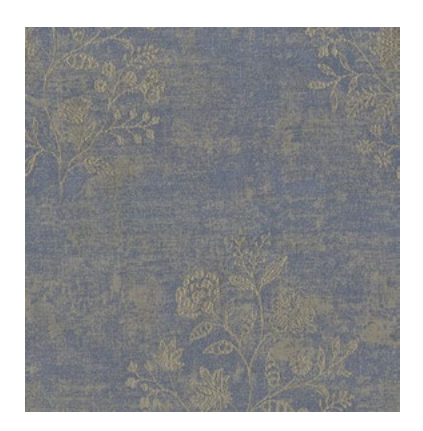
Lodhi Medieval Blue