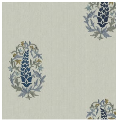
Zakir Medieval Blue