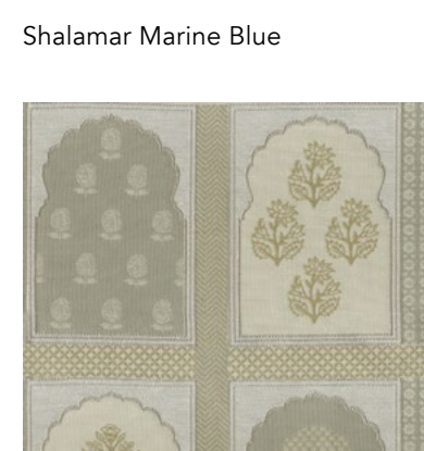
Shalamar Oyster Grey