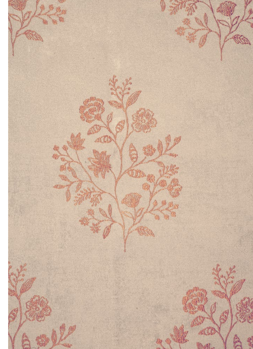
Lodhi Marine Blue Lodhi Dull Gold Lodhi Coral Sand