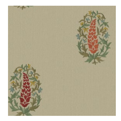
Zakir Artichoke Green