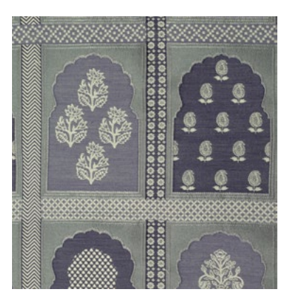
Shalamar Medieval Blue