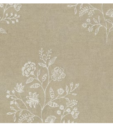
Lodhi Dull Gold