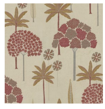
Himayat Coral Sand