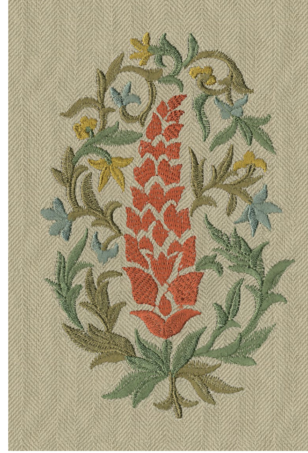
Close up of the embroidery from Zakir Above — Zakir Artichoke Green Left — Zakir Oyster Grey