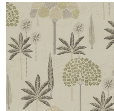
Himayat Oyster Grey