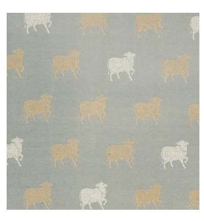
Pinjori Dull Gold