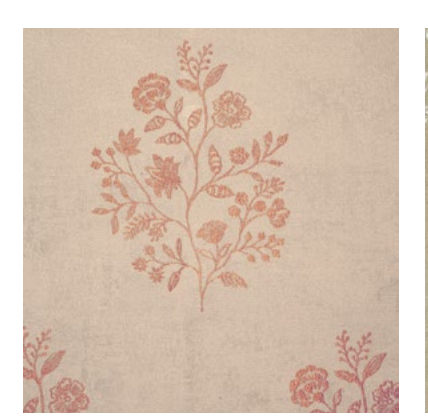
Lodhi Coral Sand