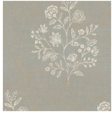
Lodhi Marine Blue