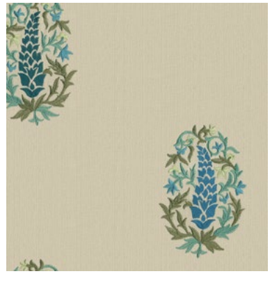
Zakir Marine Blue