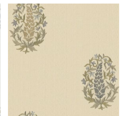
Zakir Oyster Grey