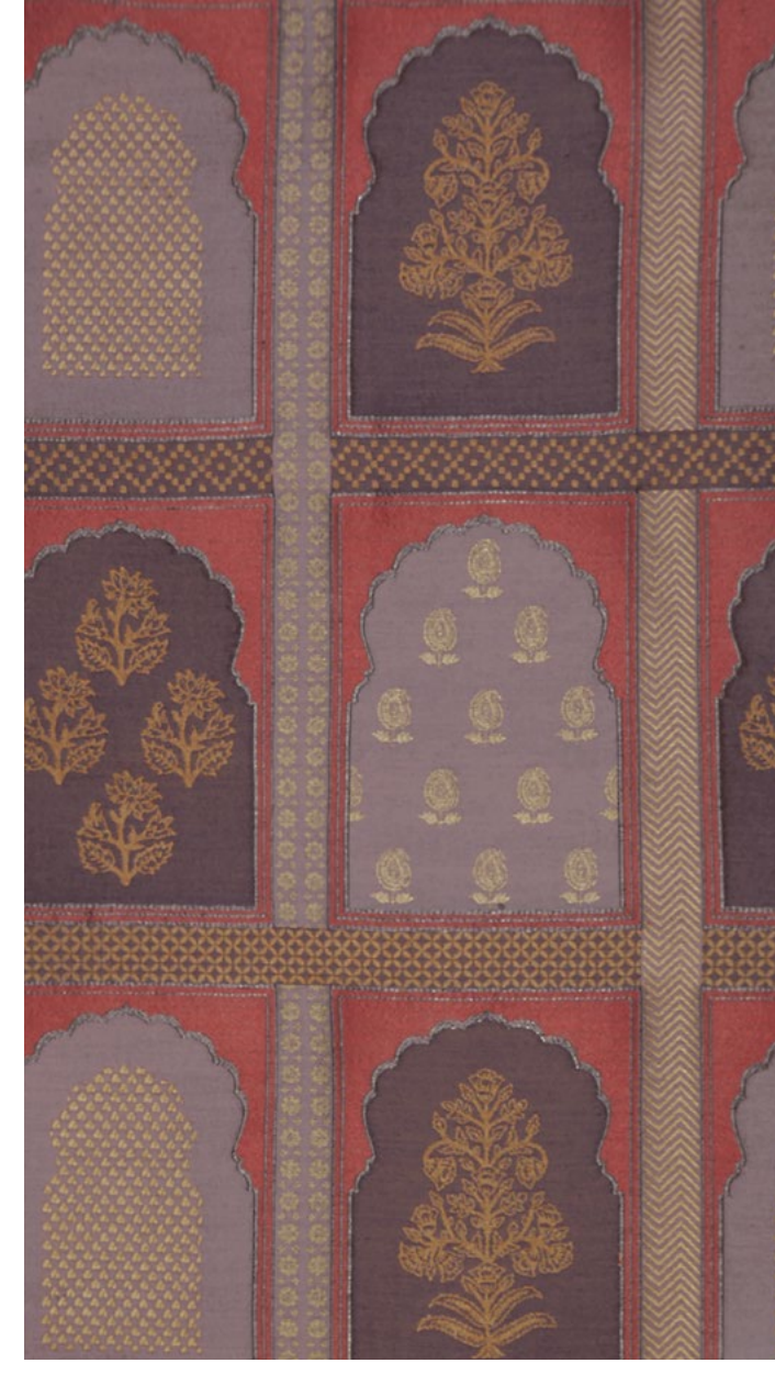
Shalamar Dull Gold Shalamar Marine Blue Shalamar Medieval Blue Shalamar Eggplant