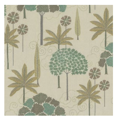
Himayat Marine Blue