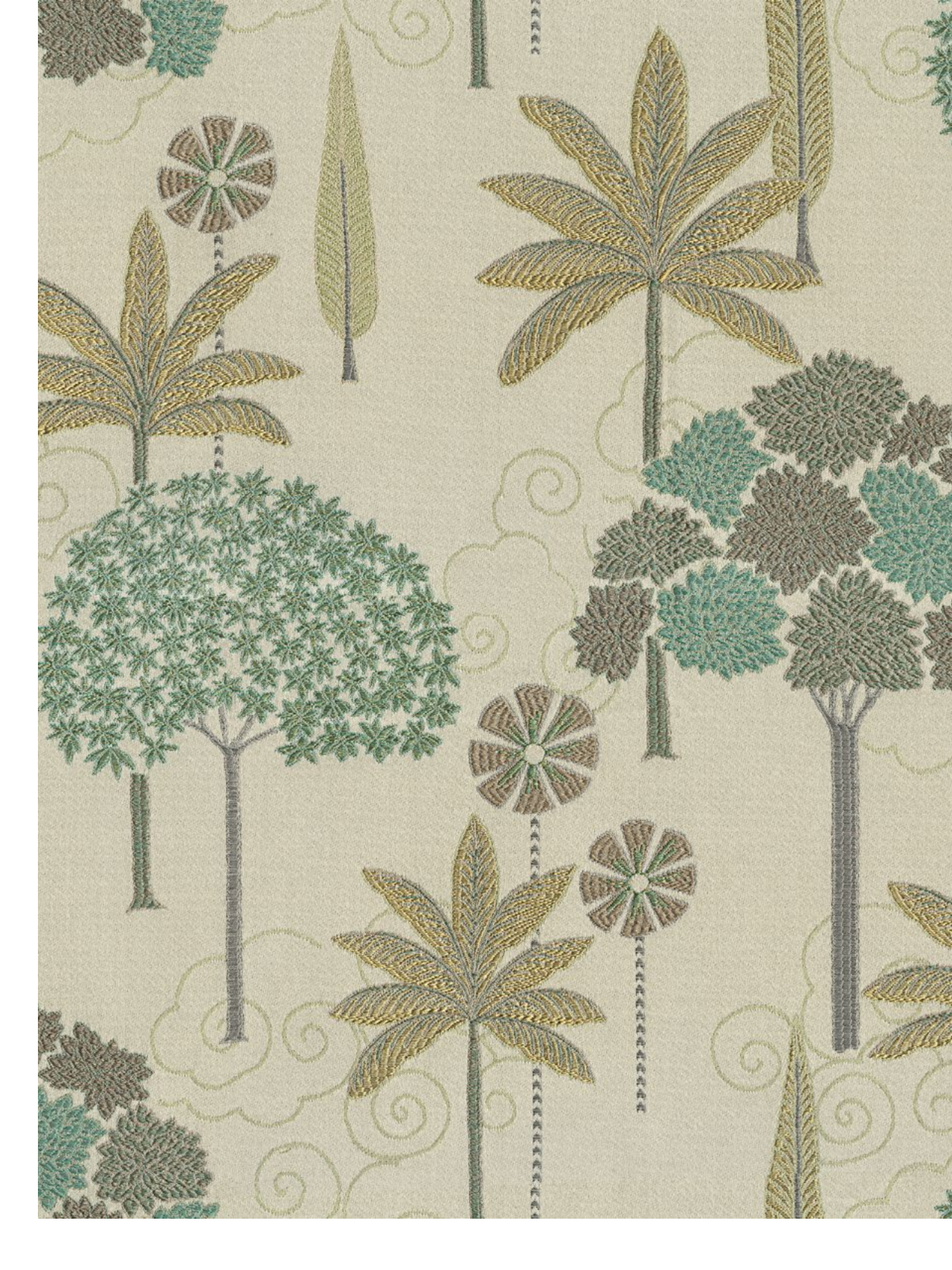
Above — Himayat Marine Blue Top left — Himayat Dull Gold Bottom left — Himayat Oyster Grey