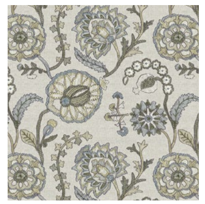
Cassia Moon Rock