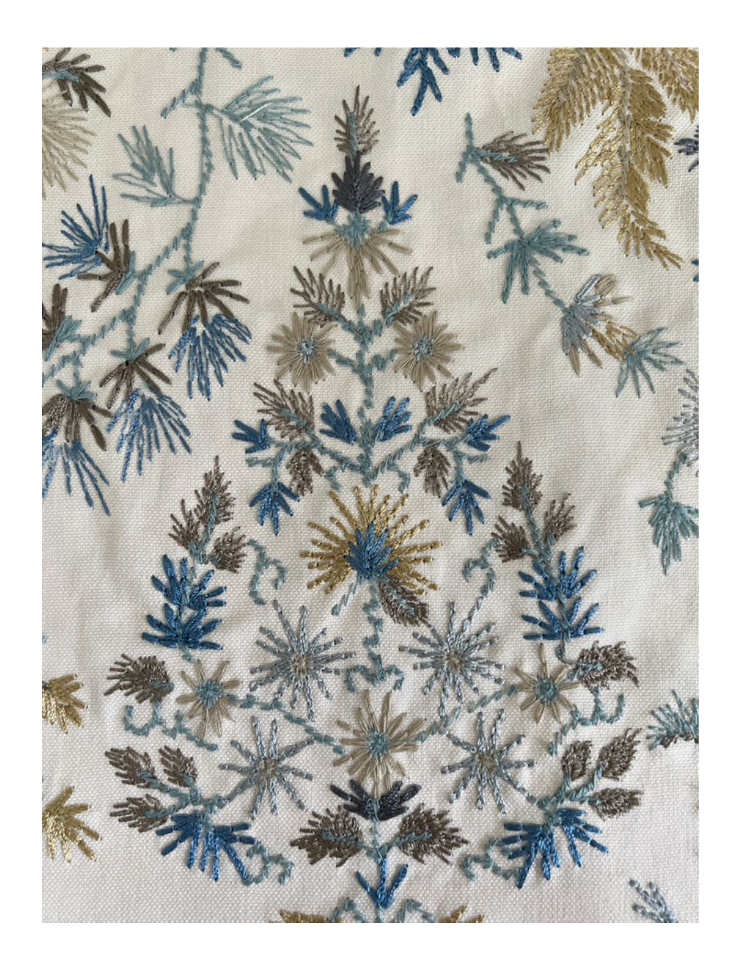
Above — Chervil Storm Blue (Detail) Left — Top to Bottom Chervil Storm Blue, Cassia Allure, Floriana Mineral Blue (Detail)