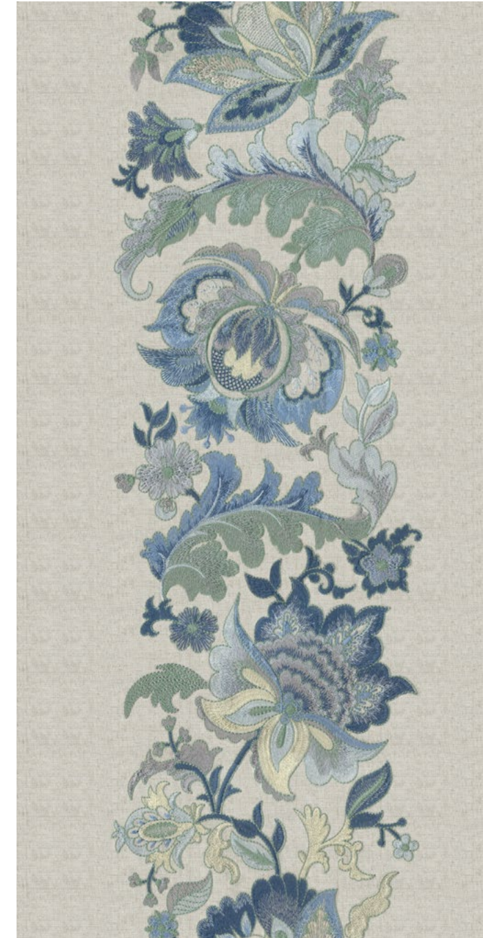
Floriana Chinois Green Floriana Chipmunk Floriana Forever Blue Floriana Mineral Blue