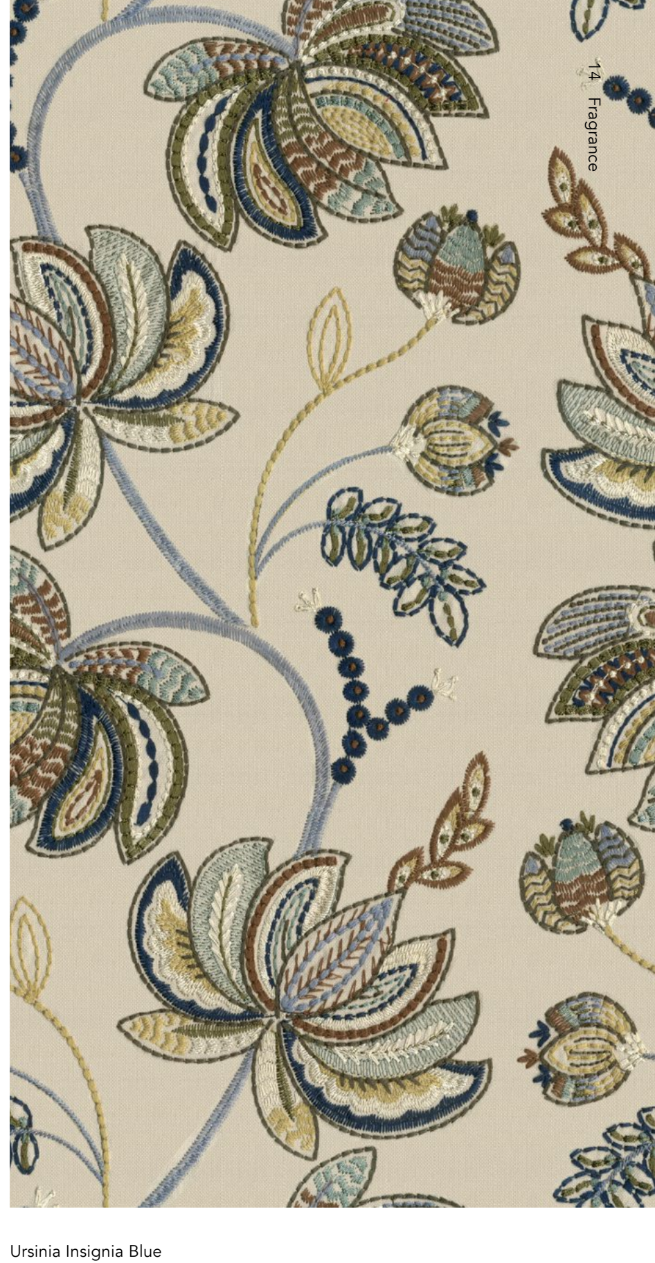
Ursinia Autumn Glaze Ursinia Coral Blue