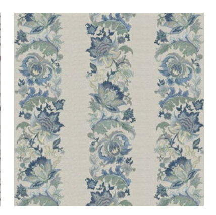
Floriana Mineral Blue