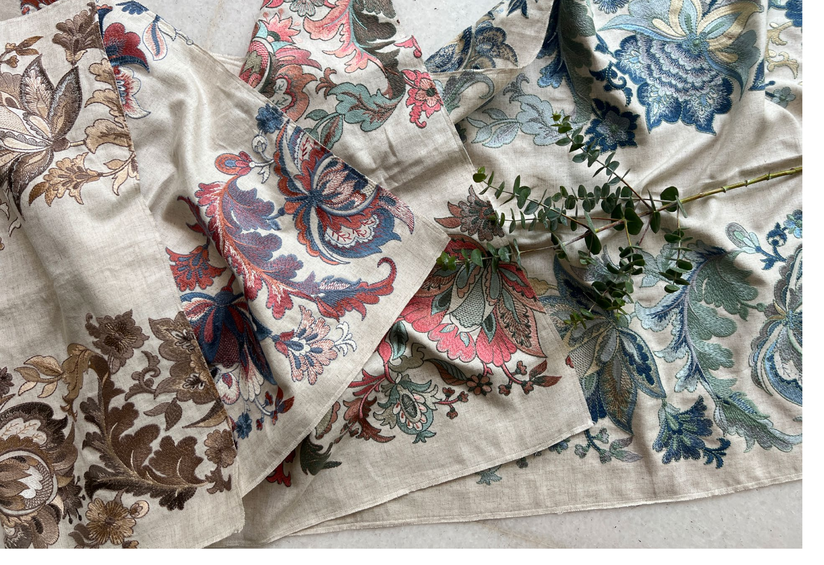
Left to right — Floriana Chipmunk, Floriana Forever Blue, Floriana Chinois Green, Floriana Mineral Blue