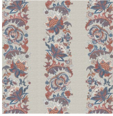
Floriana Forever Blue