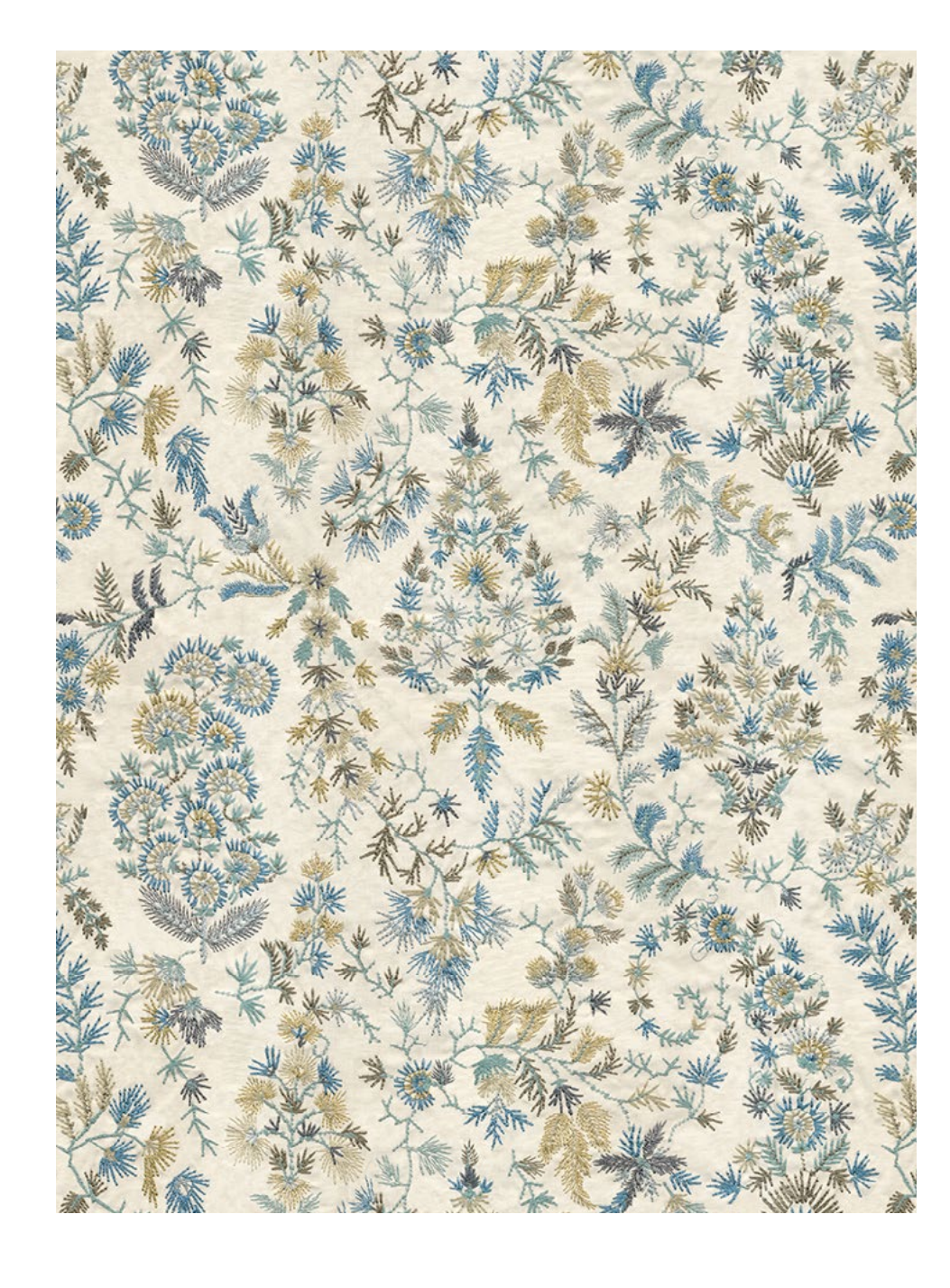
Above — Chervil Storm Blue Right — Chervil Coral