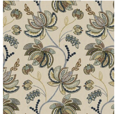
Ursinia Insignia Blue