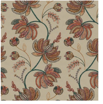
Ursinia Coral Blue