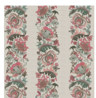
Floriana Chinois Green