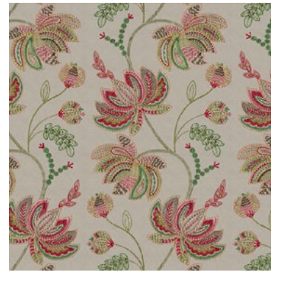
Ursinia Autumn Glaze