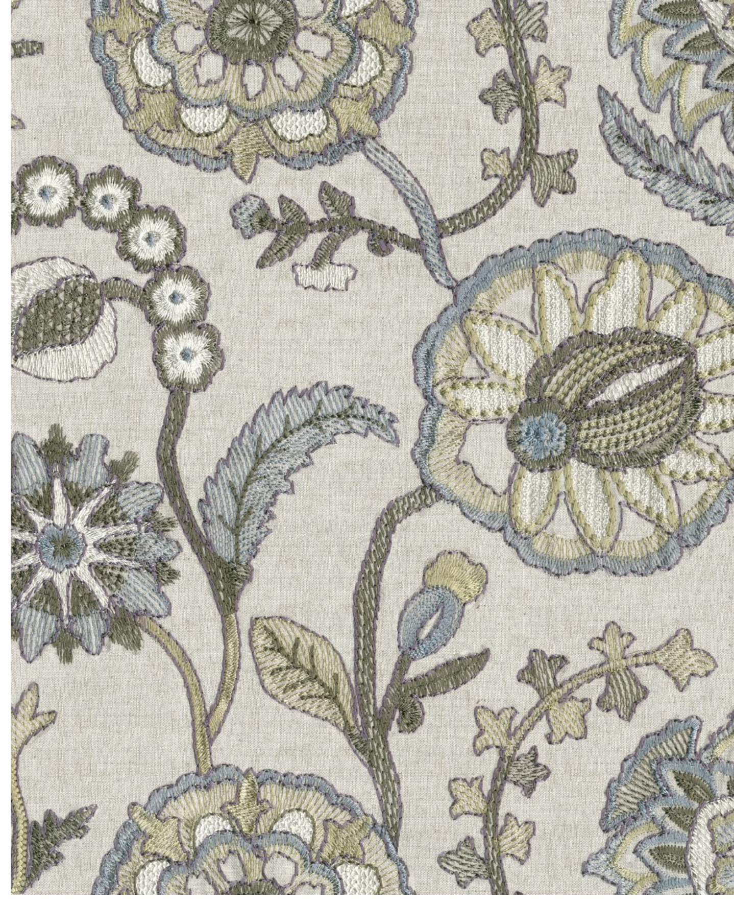
Cassia Coral Cassia Moon Rock (Detail)