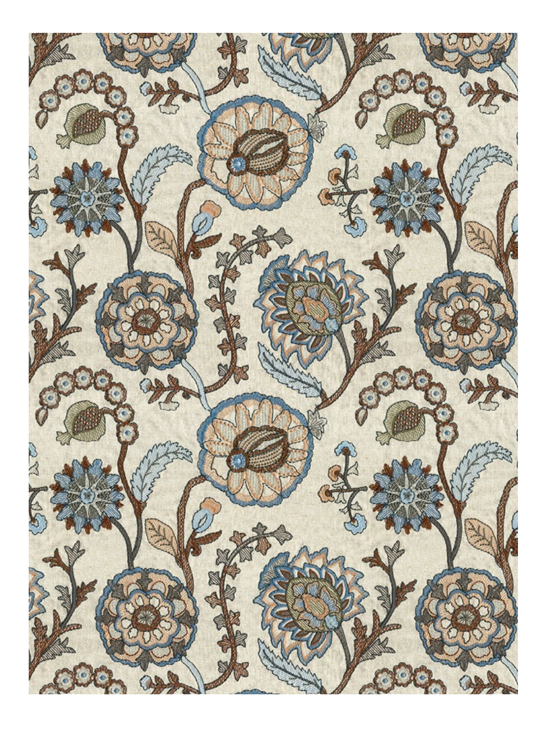
Above — Cassia Allure Right — Floriana Mineral Blue