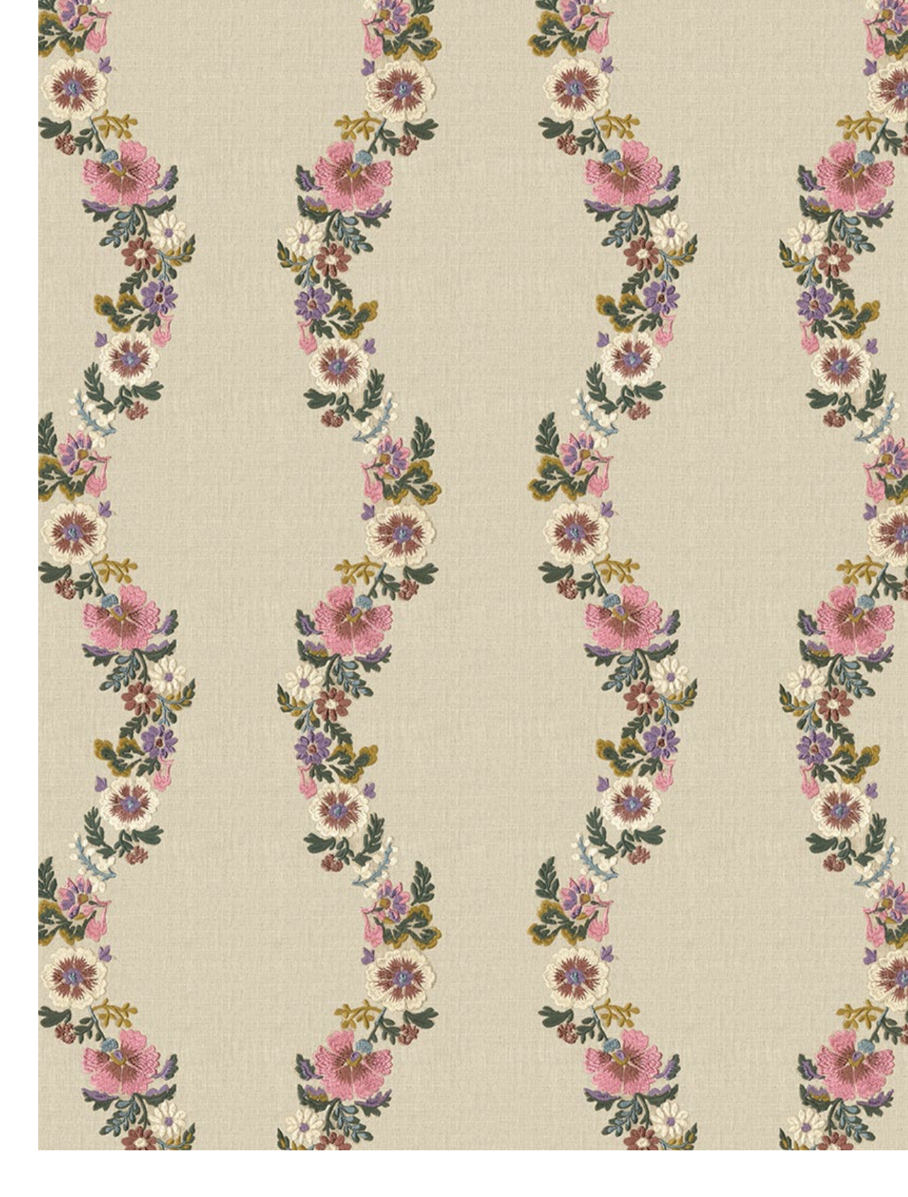
Above — Nargis Rose Tan Top left — Nargis Terracotta Bottom left — Nargis Emberglow