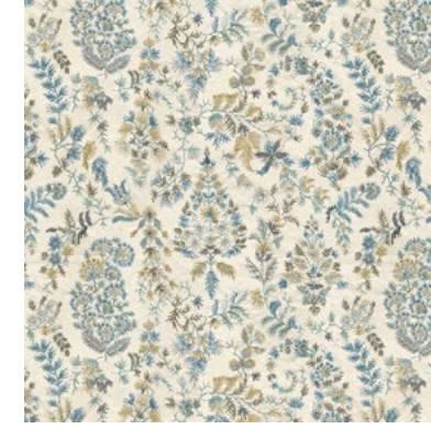
Chervil Storm Blue