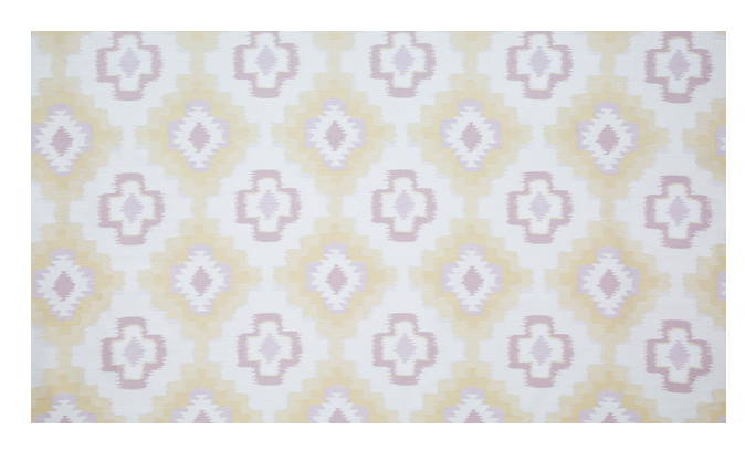
TEPEE 19% PES, 81% CV