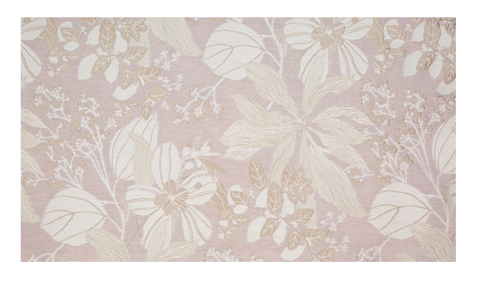
SUIBOKU 47% PES, 26% LI, 27% CO