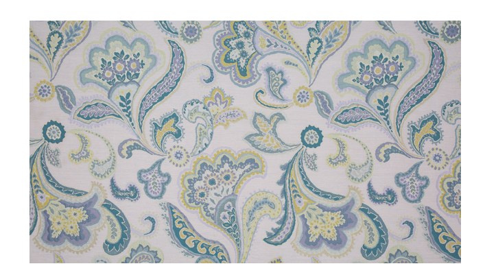
BATAHLA 5% SE, 21% LI, 11% CO, 29% PES, 34% CV