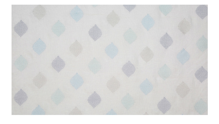
LILY 100% LI