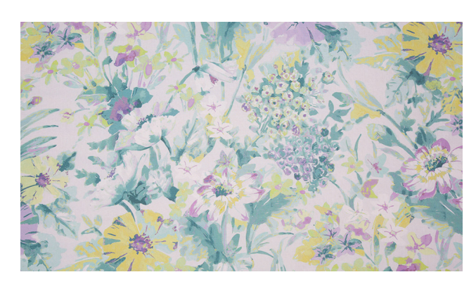
AZALEA 45% CO, 55% LI