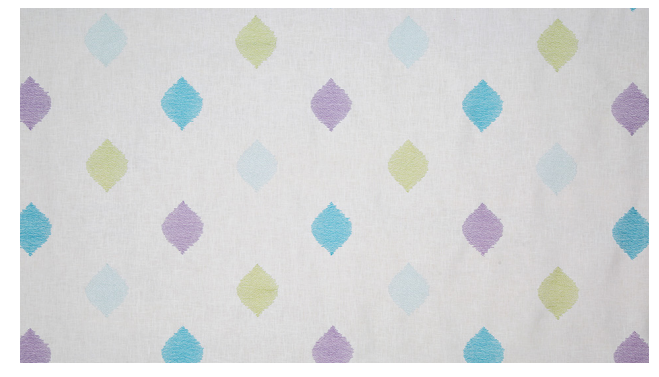
LOU 18% PES, 24% CV, 58% CO