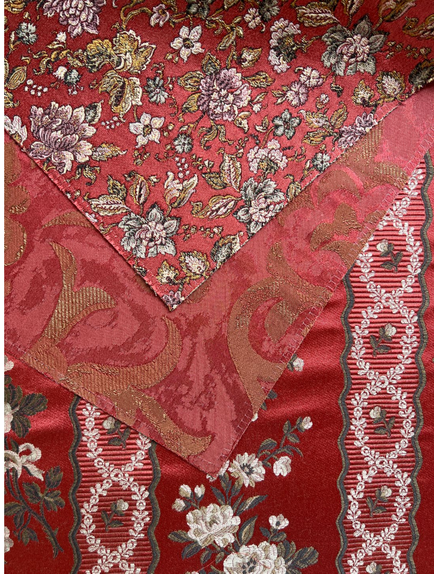
Above — Normandy Rust