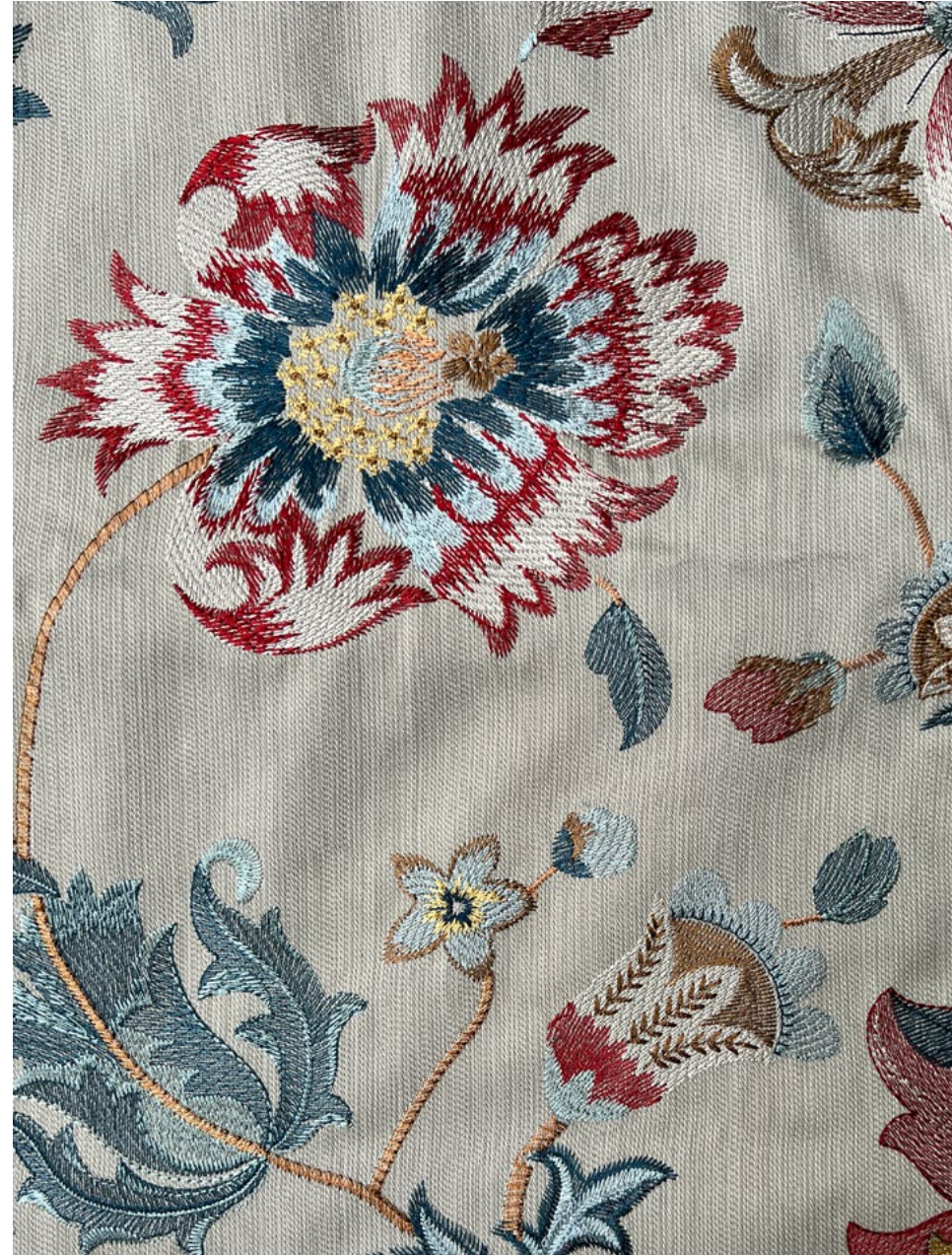
Above — Bruges Platinum Left — Top to Bottom Bruges Mustard, Bruges Platinum, Bruges Beige