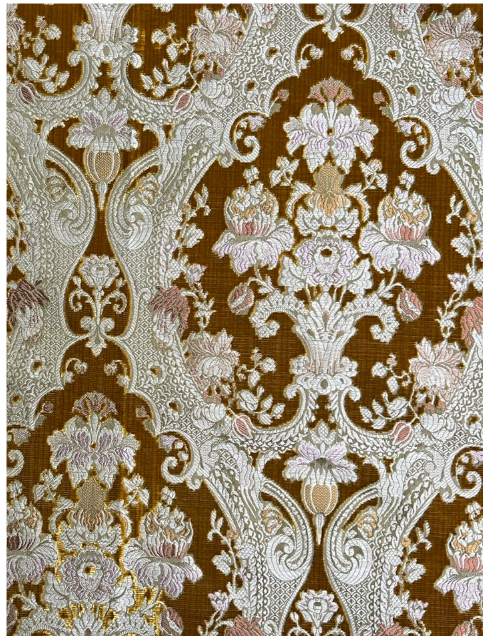
Above — Versailles Mustard Left — Bordeaux Mustard