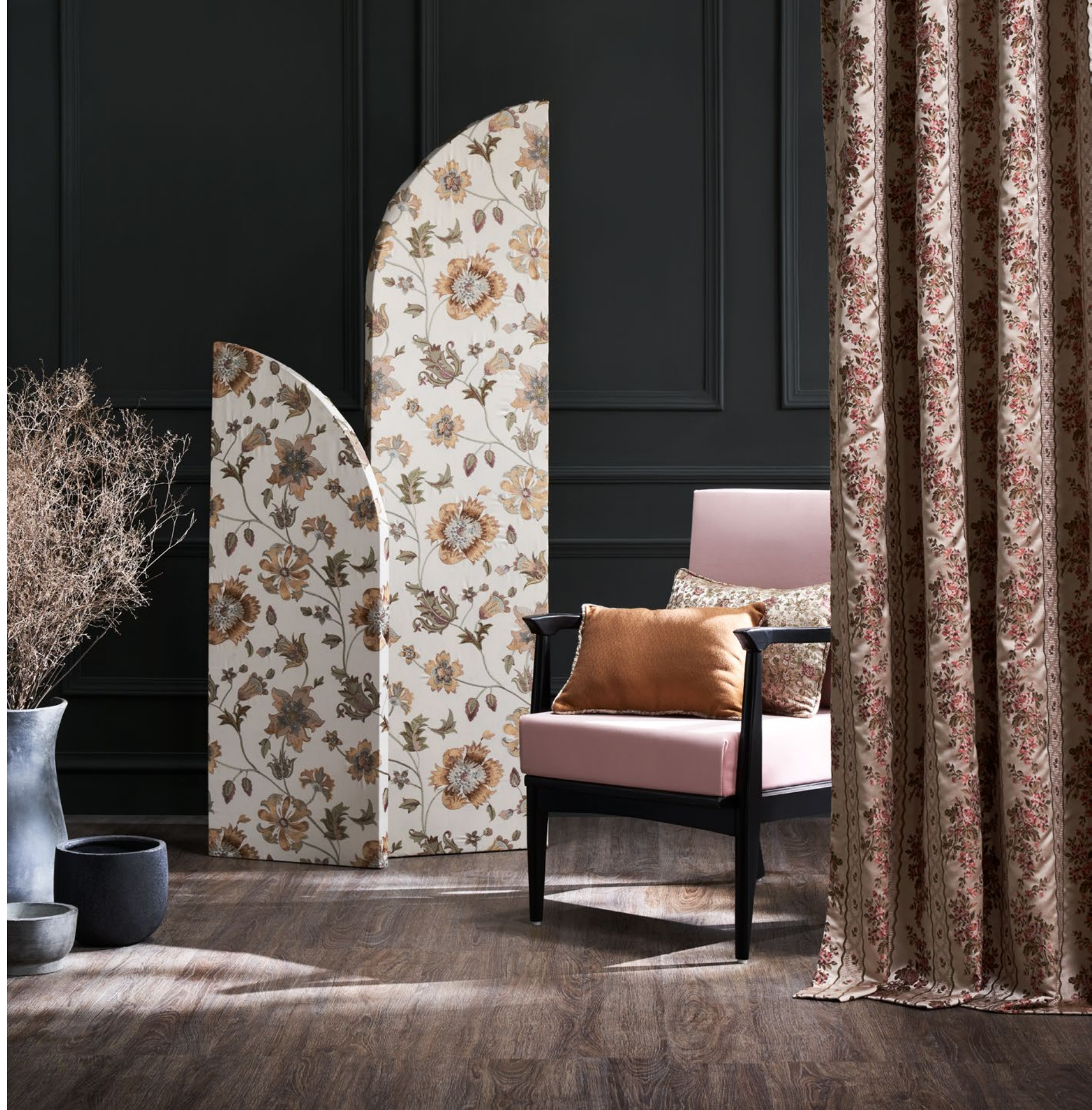
Standing Elements Bruges Beige Armchair Lucca Velvet Mellow Rose, Armchair Cushions Emilia Beige, Aravalli Biscuit Curtain Lorraine Beige