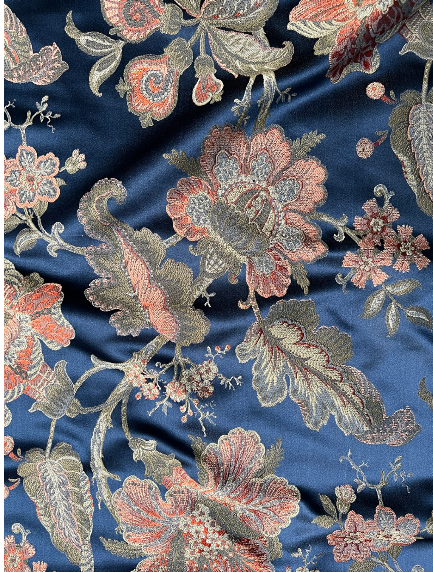
Above — Provence Beige Right — Provence Midnight