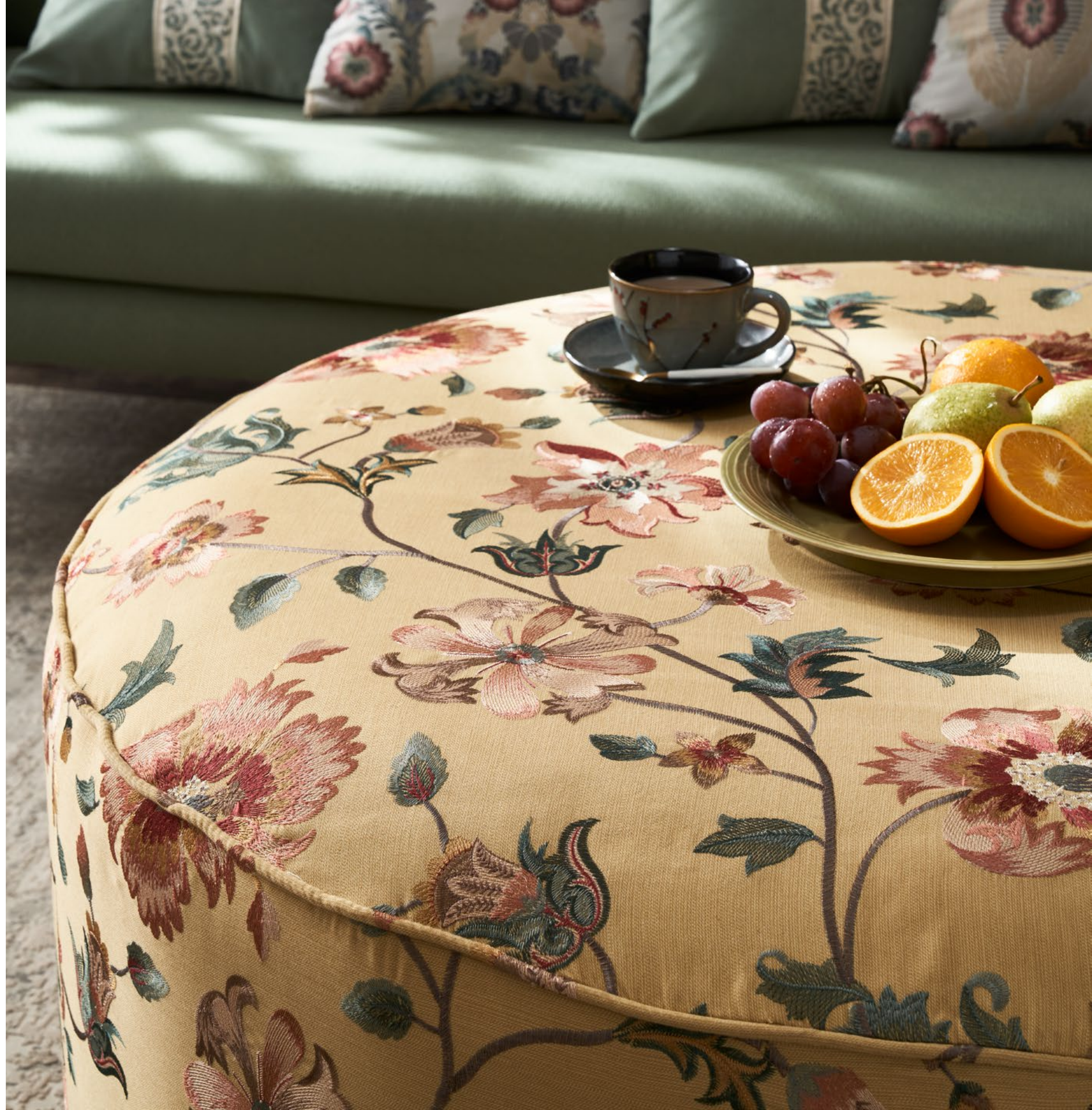
Pouf Bruges Mustard