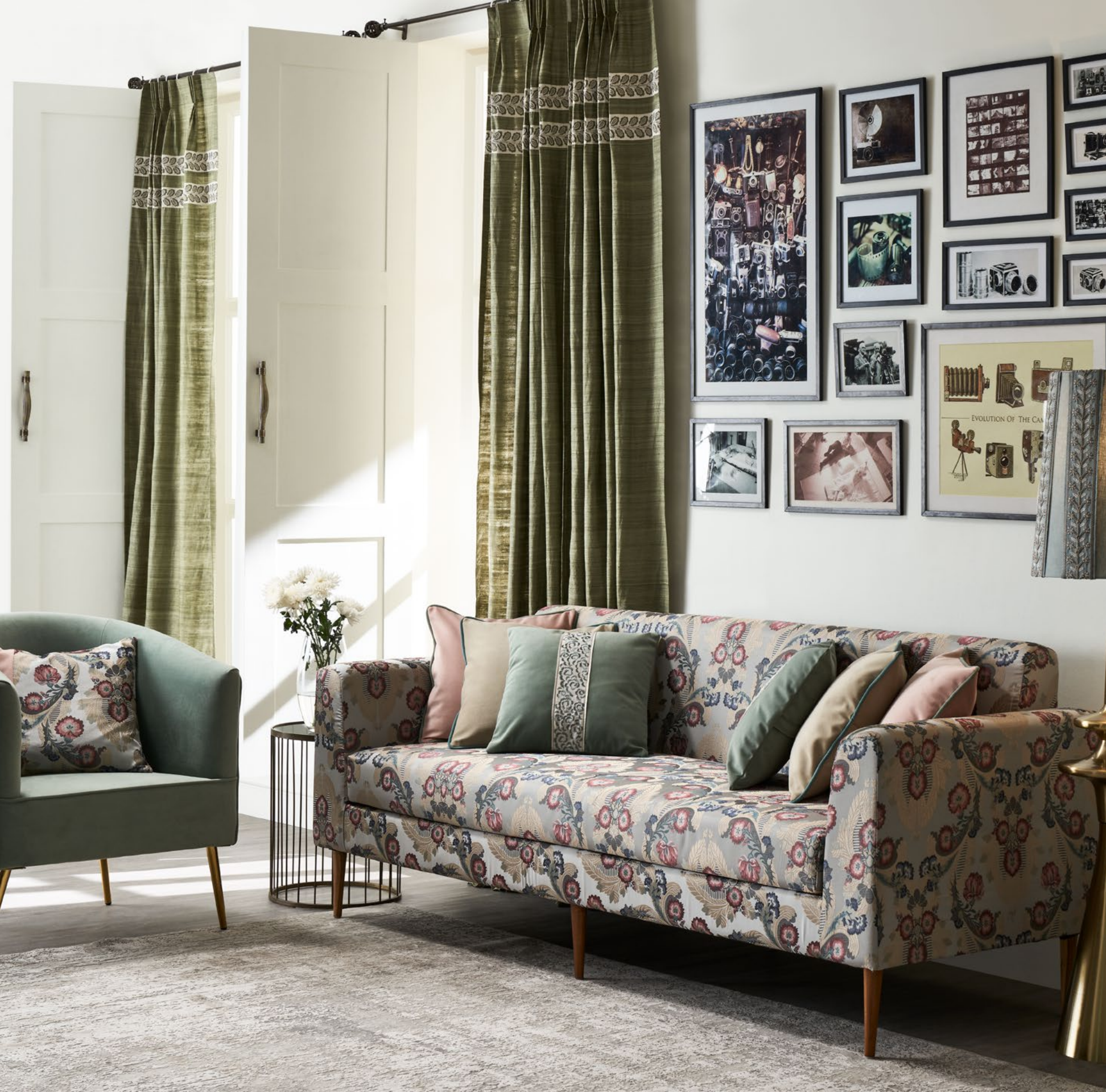
Sofa Bastia Platinum Sofa Cushions Lucca Velvet Mellow Rose, Lucca Velvet Gravel, Lucca Velvet Iceberg Green, Cushion Trim Lewis Border Nicholson Trellis Armchair Lucca Velvet Iceberg Green Armchair Cushion Bastia Platinum Curtain Benaras Silks Kosi Sage Curtain Trim Lewis Border Hemsley Sage Lamp Trim Lewis Border Cosway Crockery