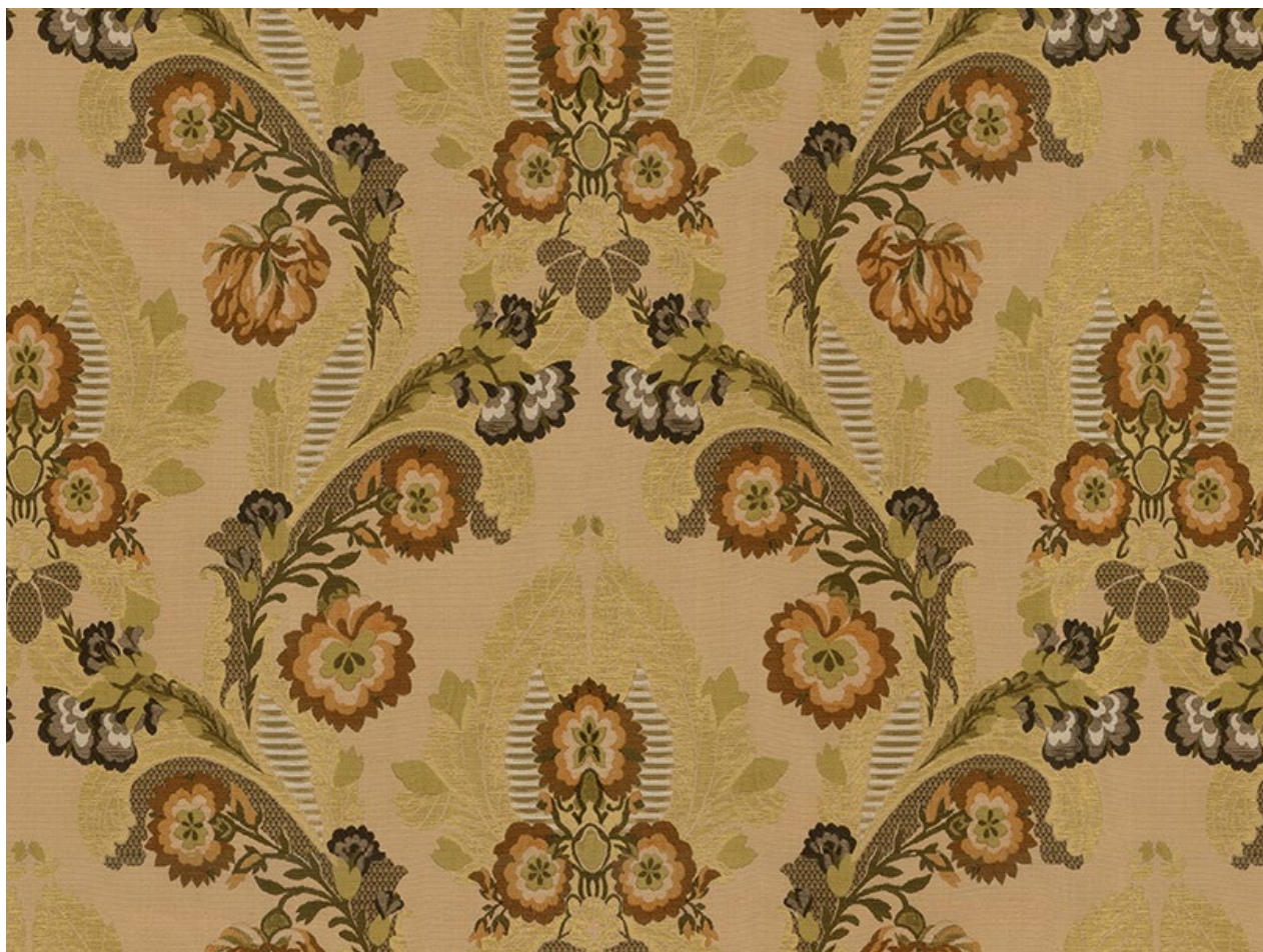
Above — Bastia Teal Top Left — Bastia Midnight Bottom Left — Bastia Mustard