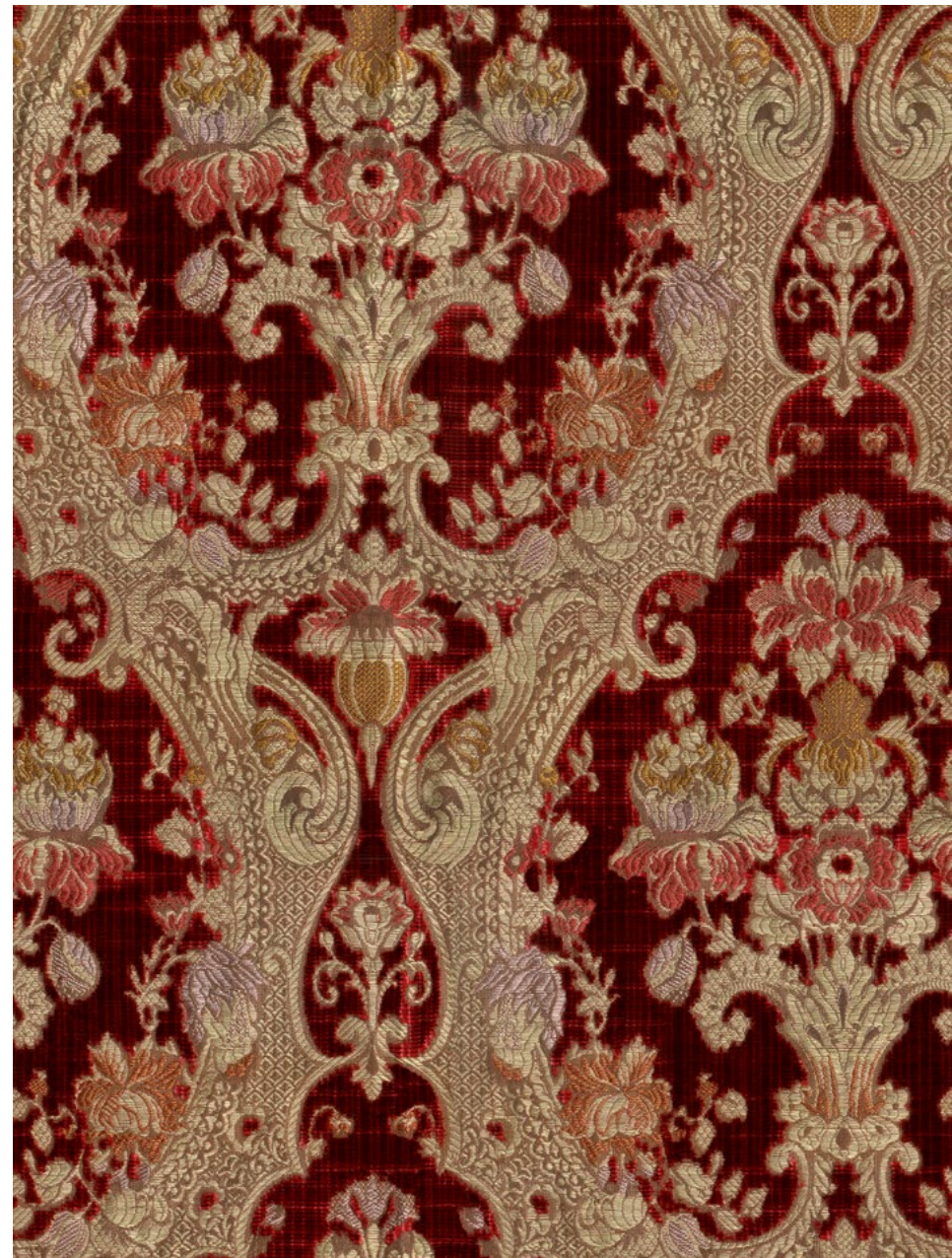
Above — Versailles Rust Right — Wall Bordeaux Burgundy, Chair Drape Bruges Platinum