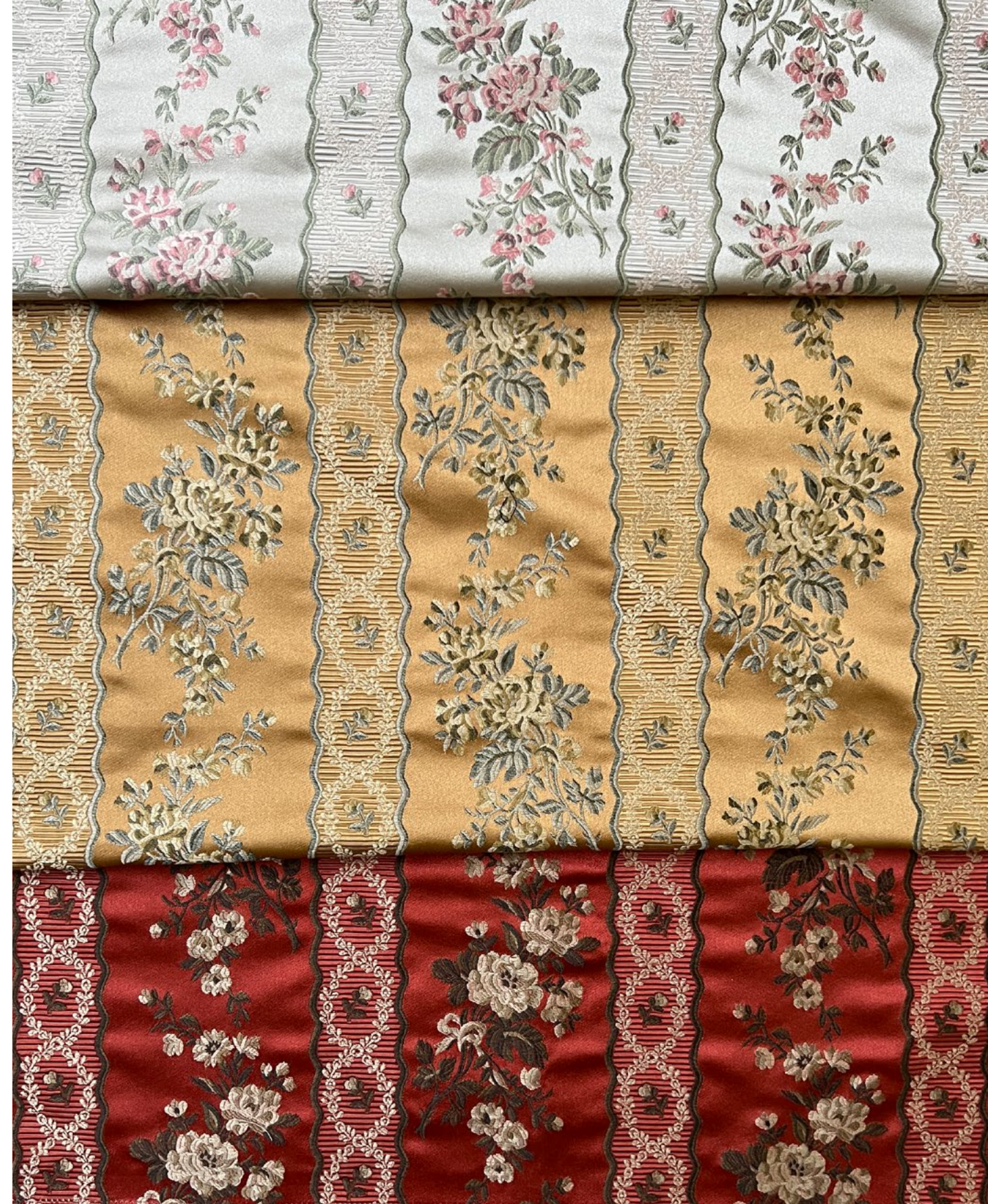
Top to Bottom — Lorraine Platinum, Lorraine Mustard, Lorraine Rust