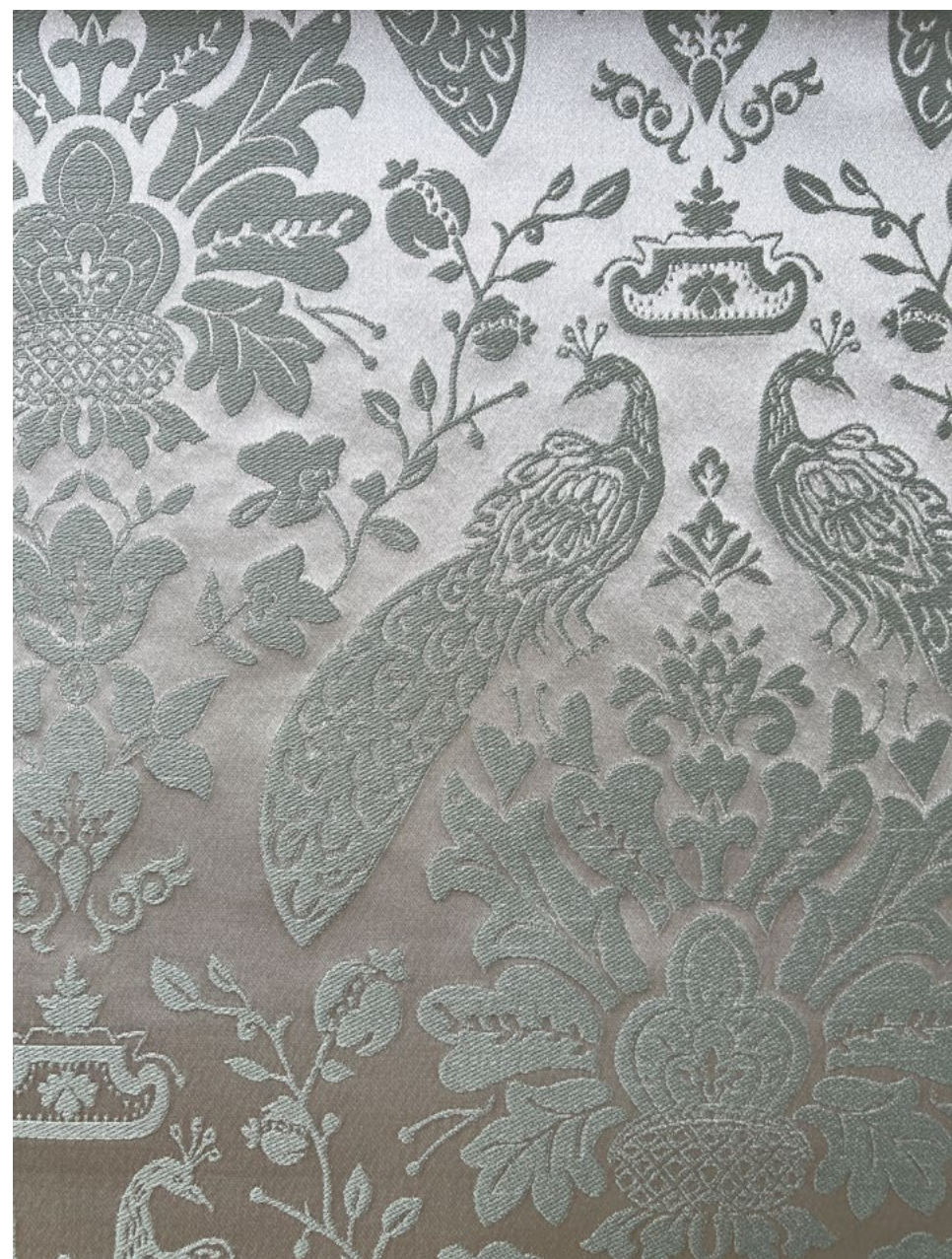
Above — Bordeaux Platinum Right — Top to Bottom Emilia Platinum, Normandy Platinum, Bastia Platinum