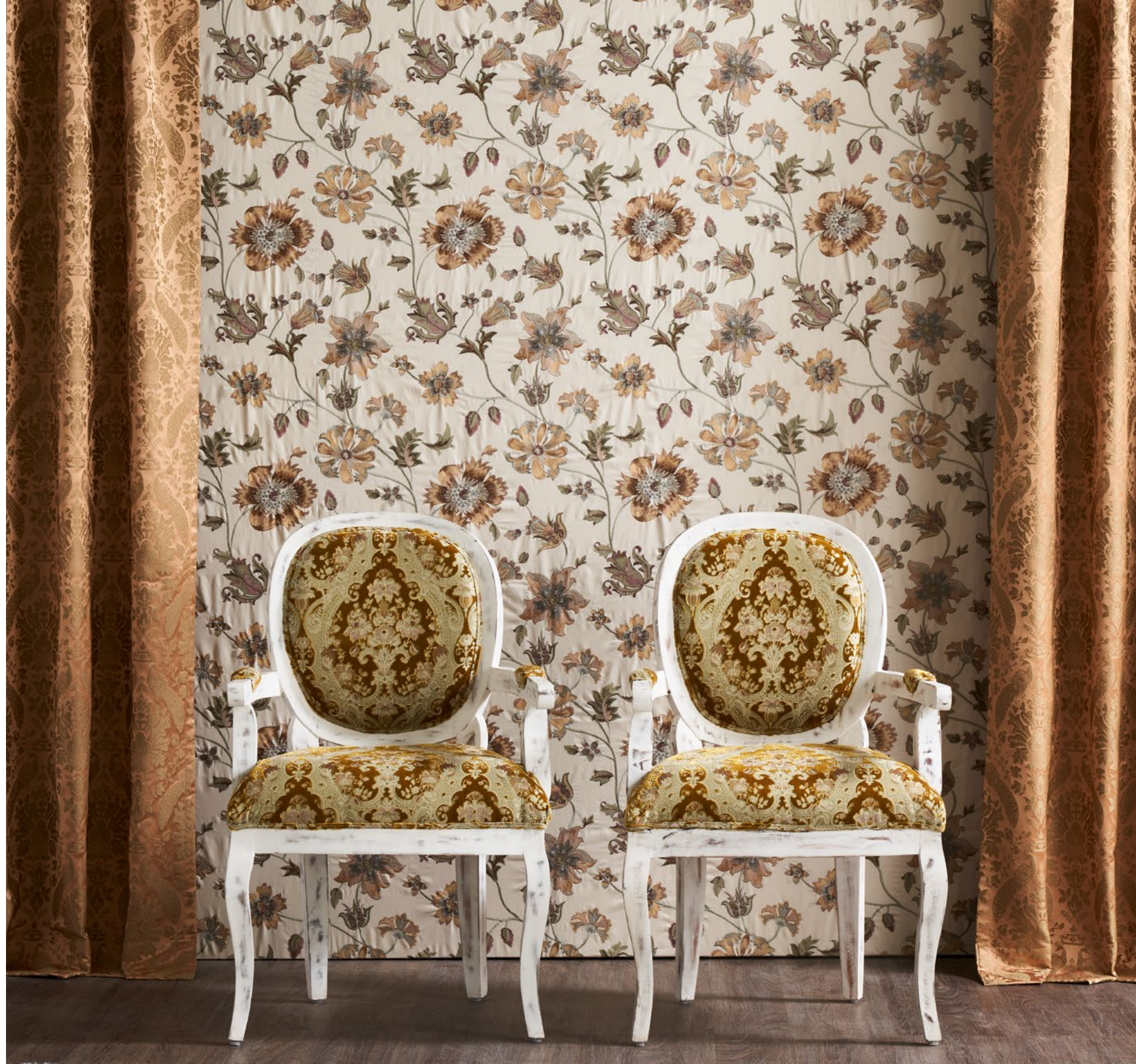
Curtain Bordeaux Mustard, Chairs Versailles Mustard, Wall Bruges Beige