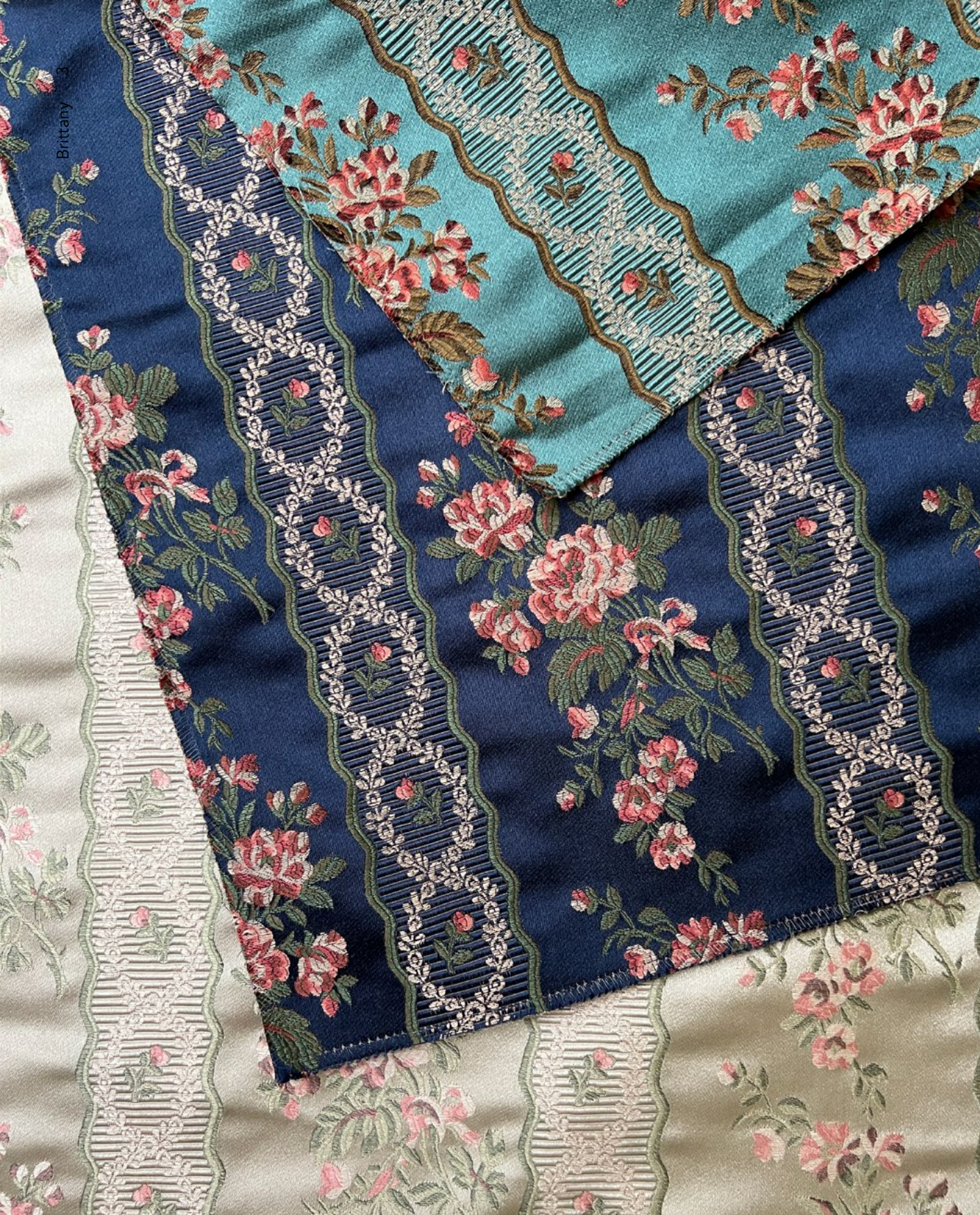
Top to Bottom — Lorraine Teal, Lorraine Midnight, Lorraine Beige