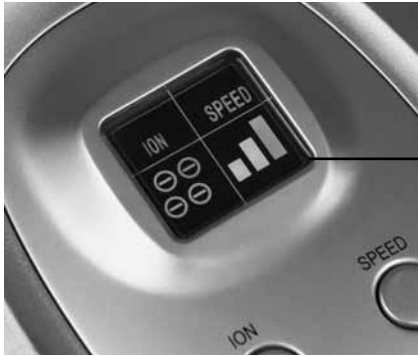
Illuminated display of your selected settings