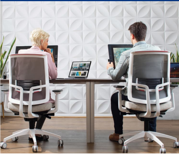
FOCUS 2.0 BY SITONIT