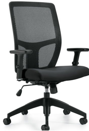
FORMAT BY OFFICES TO GO