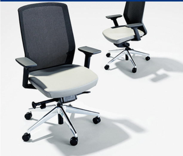
J1 BY TAYCO