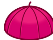
Zucchetto / tsoo-KET-o /

A strip of cloth worn only by deacons, priests, and bishops as the badge of their office. Deacons wear the stole like a sash over one shoulder. Priests and bishops wear it from the back of the neck straight down over both shoulders.