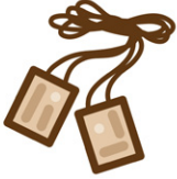
Scapular / SKAP-yoo-lur /

Two pieces of fabric connected by a cord. It is worn to represent a devotion to the Church and her teachings.