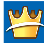
Holy Heroes Crown

A gold box that contains the Eucharist outside of Holy Mass. All tabernacles must have a lock.