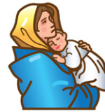
Madonna and Child

The boat built by Noah to save his family and the animals God had created from the flood He sent in punishment for man's sins. It prefigures how we are now saved from Original Sin by baptism.