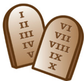
Decalogue / DEK-a-log /

The 10 Commandments which God gave to Moses on Mount Sinai. They reveal what all people everywhere owe to God and to each other.