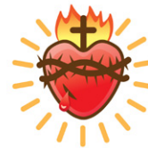
Sacred Heart of Jesus

The branches used to welcome Jesus the Messiah into Jerusalem a few days before His Passion. We commemorate the celebration every year on Palm Sunday, the last Sunday before Easter.