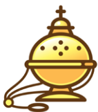
Thurible / THUR-i-bull /

This crown and halo symbol is used in the Holy Heroes logo. It is a reminder of eternal life in Heaven. "Blessed is the man who endures trial, for when he has stood the test he will receive the crown of life which God has promised to those who love Him." (James 1:12)