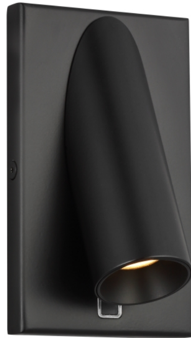
Nightshade Black 3/4 View