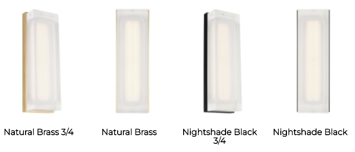
Nightshade Black 3/4

To view all available finish options, please visit techlighting.com