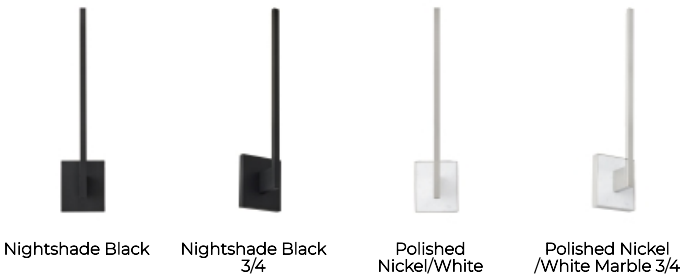
To view all available finish options, please visit techlighting.com