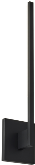
Nightshade Black 3/4

Includes 11.7 watt, 939 delivered lumens, 3000K 90 CRI LED module. 120V dimmable with most LED compatible ELV and TRIAC Dimmers. 277V compatible with 0-10V dimmers. ADA compliant. Mounts up or down. 120V or 277V.