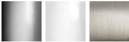
AS BC NI