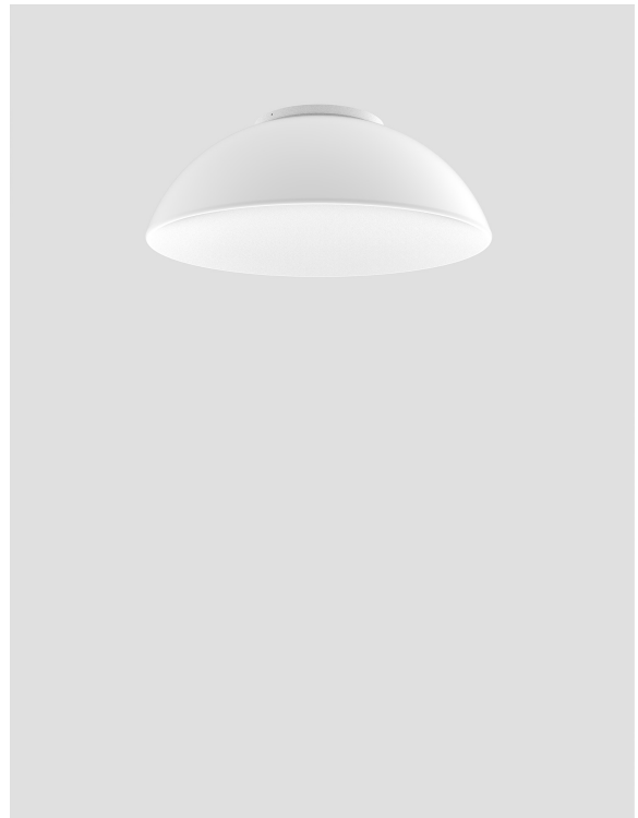
INFIN PL 70 BCST BC E27 CE