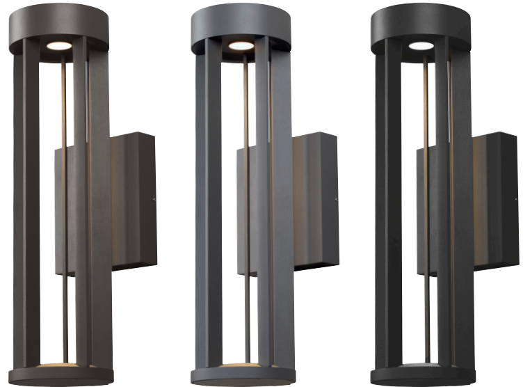
TURBO WALL shown in bronze