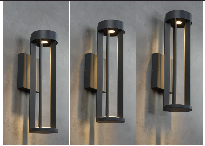
Integrated height adjustment system allows you to customize your fixture position. Low, Mid or High.