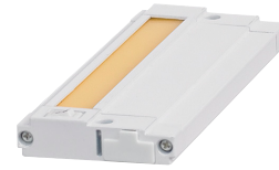
7" WHITE (SHOWN OFF)