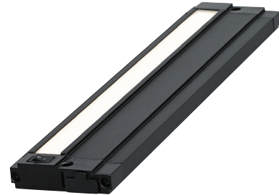
13" BLACK (SHOWN ON)