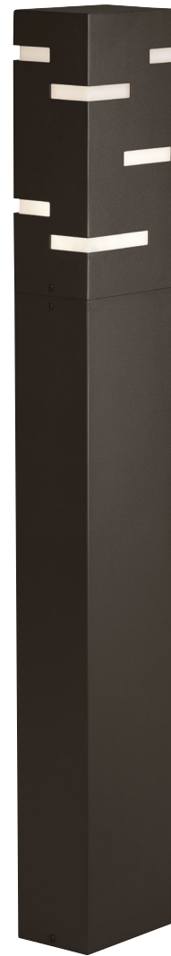
REVEL BOLLARD shown in bronze