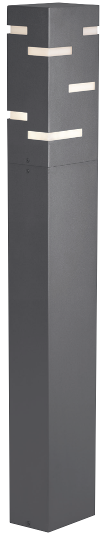
REVEL BOLLARD shown in charcoal