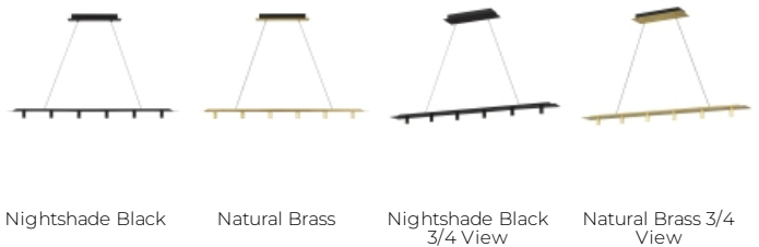
Nightshade Black Natural Brass Nightshade Black 3/4 View Natural Brass 3/4 View

To view all available finish options, please visit techlighting.com